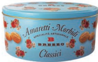
Brezzo - Traditional Amaretti in tin almond flavour 260g x 8 BRE483