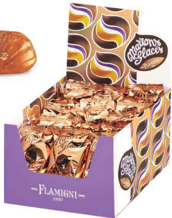
Marrons Glacés Display whole (20g) chestnuts individually wrapped by Flamigni (54pcs) x 1 FLA1130