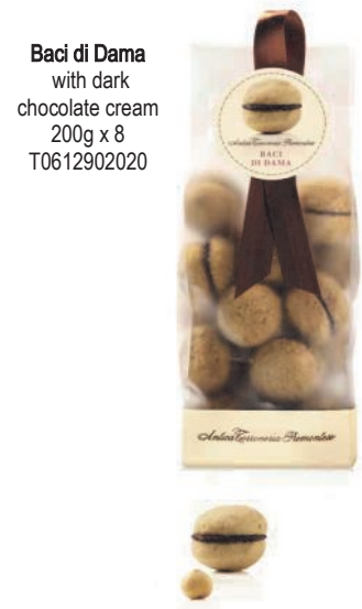
Baci di Dama with dark chocolate cream 200g x 8 T0612902020