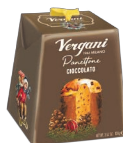
100g Chocolate Panettone with chocolate drops 100g x 24 VER0674