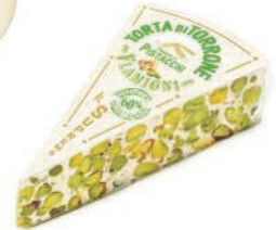
Premium Pistachio Nougat Cake by Flamigni with 60% pistachios 150g x 12 individually wrapped slices FLA78