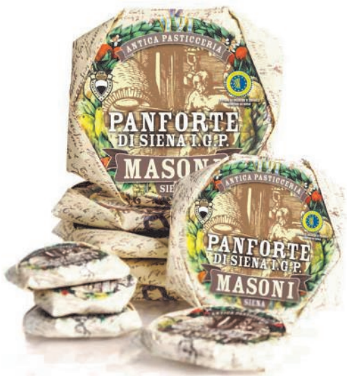
Masoni IGP Siena Panforte 450g x 12 MAS132 250g x 12 MAS134 100g x 12 MAS135