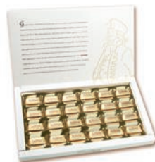
Gianduiotti Gift Box

Cremini milk chocolates with a soft layer of coffee, hazelnut cream. 200g x 6 S9770060