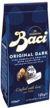
Baci Bag 10 pieces 125g x 12 Bag P12440824