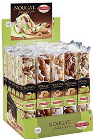
Traditional Soft Nougat pistachio, almond, hazelnut 100g x 25 pcs QUA403984