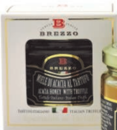
Truffle Honey by Brezzo 120ml x 6 BRE70M