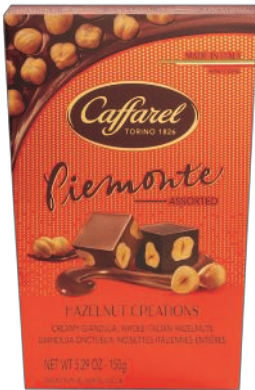
Piemonte Assorted Box Milk and dark chocolate cubes with whole hazelnuts 150g x 8 CAF880852