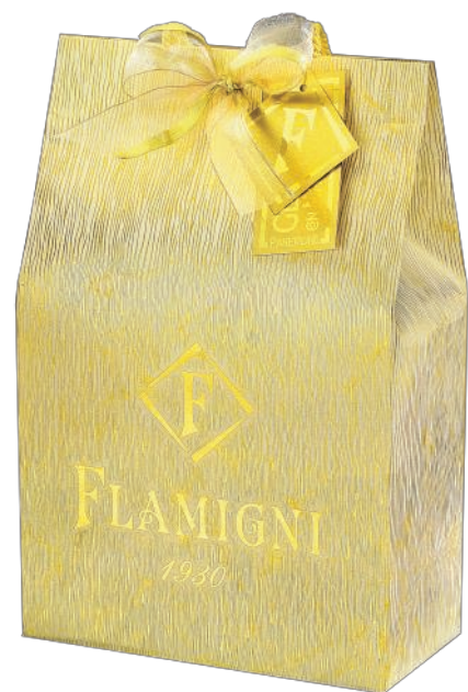
Glazed Panettone in Golden Gift Bag Traditional Panettone coated with almonds and sugar glazed 750g x 9 FLA3630