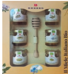
Small Honey Selection Box 6 x 35g jars assortment by Brezzo 210g x 8 BRE300.13