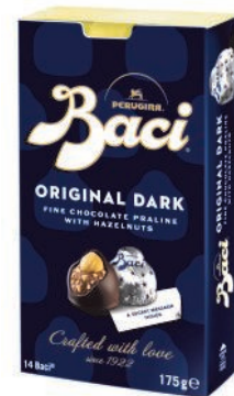
Baci Bijou box 14 pcs 175g x 10 boxes P12439537

Dark chocolate with a whole hazelnut, filled with milk chocolate and pieces of hazelnut. Each piece wrapped in foil contains a messages of love and friendship.