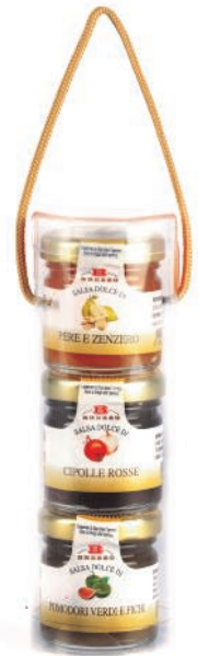
Chutney Selection for cheese by Brezzo (3 jars x 40g) x 12 BRE48TR