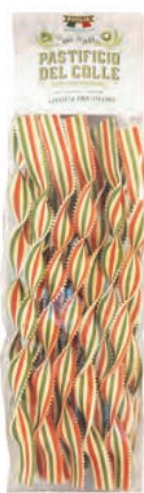
Lingua Tricolore handmade 250g x 12 PAS3188