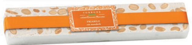
Antica Torrineria - Soft Nougat Hazelnut & Almond 150g x 12 T0604101510 Almond & Pistachio 150g x 12 T0606901500 Hard Nougat - Almond 150g x 12 T0601501510