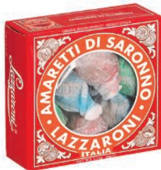
Amaretti Window box 65g x 18 L01157