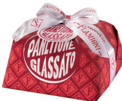
Glazed Panettone with raisins, candied orange and lemon peel, almond glazed 1kg x 9 FLA3945 500g x 12 FLA3933