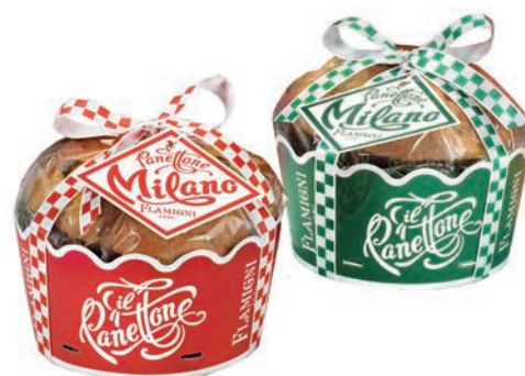
Traditional Panettone in Paper Cup In green and red cups with raisins, candied orange and lemon peel 350g x 12 FLA3940