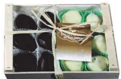
Figs in Dark and White Chocolate Box Figs covered in dark and white chocolate 200g x 12 RAO200B5