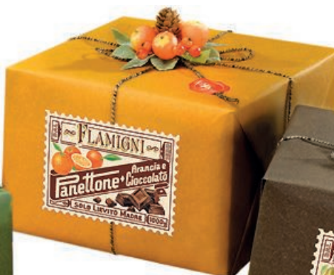
Chocolate Rustic Range - Panettone Dark Chocolate & Orange 1kg x 6 FLA3747