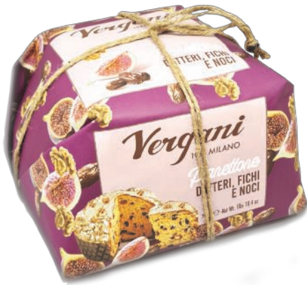
Gourmet range - Date, Fig & Walnut Panettone 750g x 6 VER9949