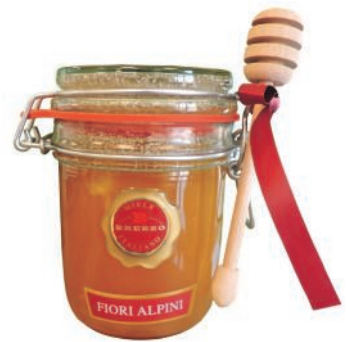
Wildflower Honey from the Alps by Brezzo 400g x 6 BRE39.06