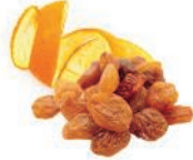
Traditional Panettone with candied orange peel & raisins 750g x 6 VIN1499