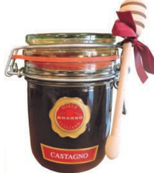
Chestnut Honey by Brezzo 400g x 6 BRE39.12