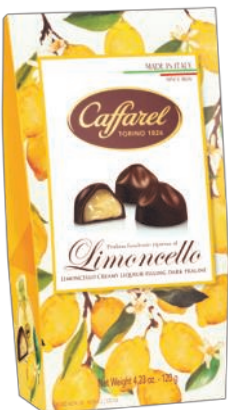
Limoncello ballotin Dark chocolate with liqueur filling 120g x 12 CAF881009