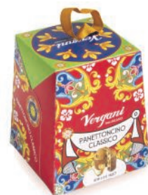
Sicily range Mignon - 100g Traditional Panettone with raisins, candied orange and lemon peel 100g x 24 VER1403