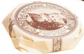
Marchi Vanda - Premium Panforte artisan soft panforte with honey 250g x 12 MVPANF4