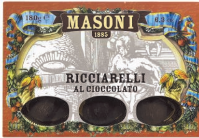
Masoni - Chocolate Ricciarelli 180g x 16 MAS210