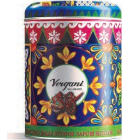
Sicily range Mignon Tins - 100g Traditional Panettone with raisins, candied orange and lemon peel 100g x 12 (4 x each kind of tin) VER0339