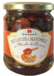
Almond & Pistachio in Honey by Brezzo 240g x 6 BRE32.4