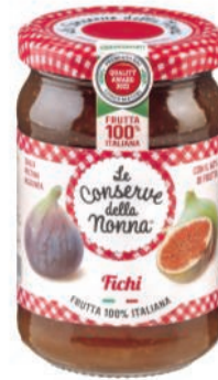
Fig Preserve 340g x 6 NON624