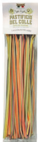
Tagliolini Picasso handmade 250g x 12 PAS3195