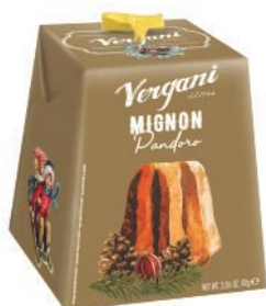
80g Pandoro light plain cake, no raisins or candied fruit peel 80g x 24 VER8485