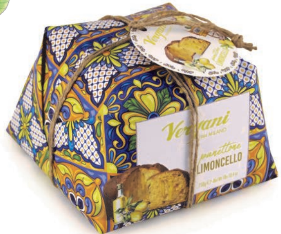
Sicily range - Limoncello Panettone filled with limoncello cream 750g x 6 VER9918