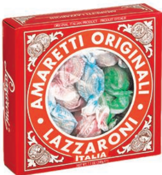
Amaretti Window box 200g x 12 L01168