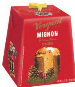
100g Traditional Panettone with raisins, candied orange and lemon peel 100g x 24 VER8454