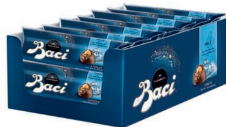
Milk Baci 3 pieces tube display 37.5g x 14 in display P14507206