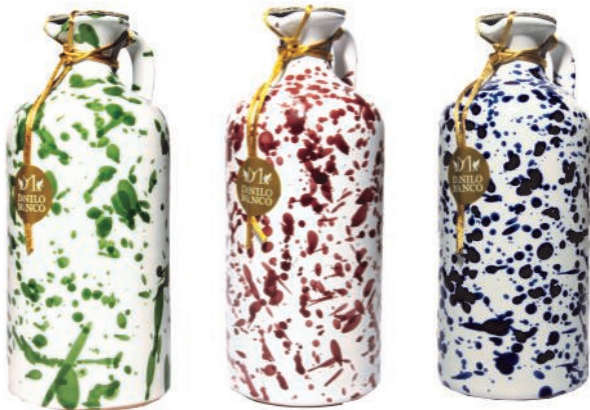
500ml Dotted Terracotta Pots with Extra Virgin Olive oil 500ml x 6 mixed pots ( 2 of each) MAN/POT2

Pots are handmade by artisan craftsmen in Apulia. Each one is unique as it is decorated by hand. Colour of pots may vary.