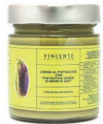
Sicilian Pistachio Cream 45% DOP Bronte Pistachio 180g x 6 VIN01