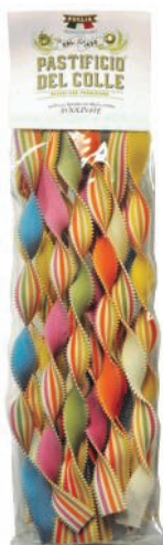
Sviolinate handmade 250g x 12 PAS5441