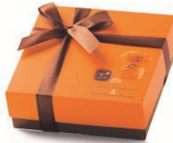
Truffle in gift box Beige - Dark chocolate & hazelnuts 125g x 6 T1604601252 Green - White chocolate & pistachio 125g x 6 T1616501250 Orange - Gianduja 125g x 6 T1612301250