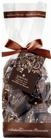
70% Dark Truffle Bag 200g x 12 T0609102000