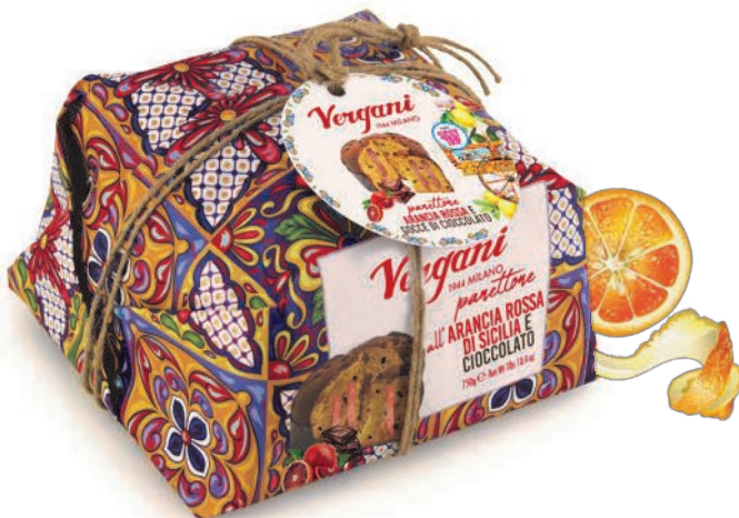
Sicily range - Red Orange Cream & Chocolate Drops Panettone filled with Orange cream and chocolate drops 750g x 6 VER0605