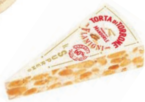
Premium Almond Nougat Cake by Flamigni with 60% almonds 150g x 12 individually wrapped slices FLA77