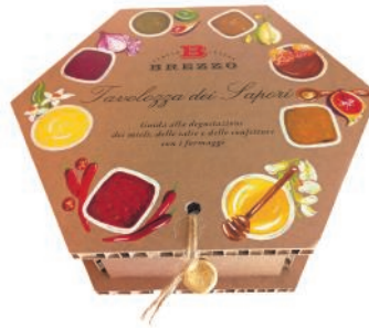
Cheese Condiments Selection by Brezzo The box contains a colourful leaflet detailing each condiment. (12 jars x 35g) x 3 BRE300T