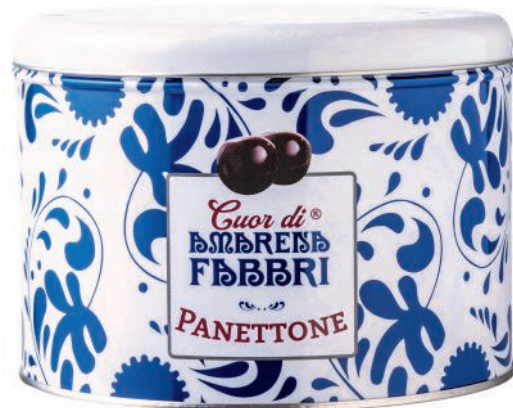
Fabbri Panettone Tin with Fabbri Cherries 750g x 6 FAB9377381