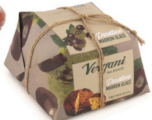
Gourmet range - Marrons glaces Panettone with marrons glaces 750g x 6 VER7051