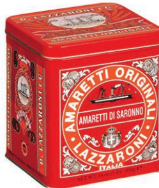
Amaretti tin 450g x 4 L01024