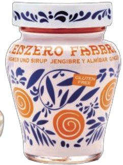
Ginger Fabbri ginger in syrup 230g x 6 FAB9172020