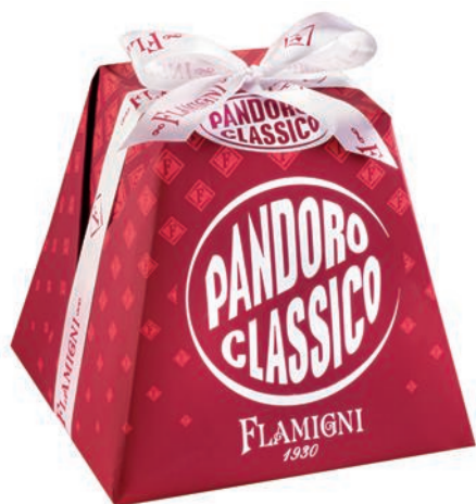
Pandoro Box 1kg x 6 FLA3340