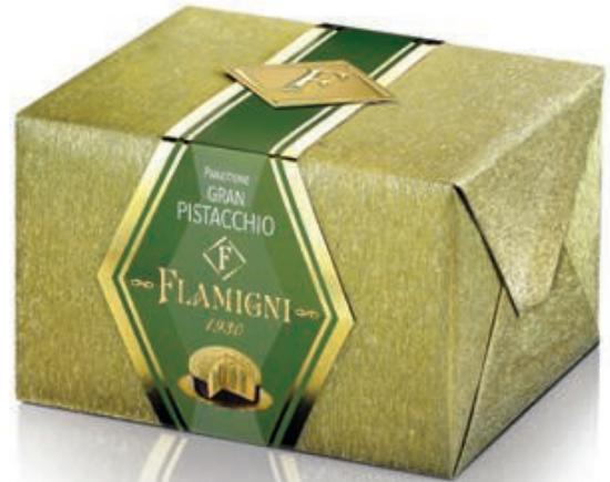
Gran Pistachio Panettone with Pistachio cream coated with white chocolate & pistachio grains 950g x 6 FLA3682