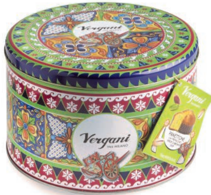
Sicily range Tins - Pistachio Panettone filled with "Bronte" DOP Pistachio cream 750g x 6 VER1465