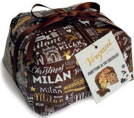
Merry Christmas range - Three Chocolate Panettone with chocolate drops, sprinkled with chocolate drops 750g x 6 VER8898