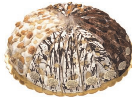
Assorted Chocolate Cream Nougat Cake 3.3kg - 20 individually wrapped slices QUA403879