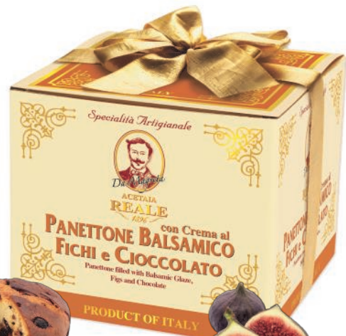
Leonardi - Fig, Chocolate & Balsamic Cream Panettone 750g x 6 LE3060