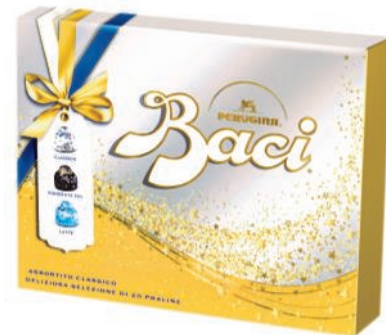
Silver & Gold Assorted Baci box Coated in extra dark, milk and dark chocolate 250g x 10 boxes P14507654