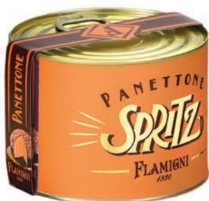
Sprits Panettone in Tin with Spritz cream covered with chocolate and sugar grains. 350g x 8 FLA3973