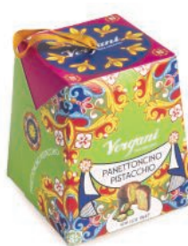
Sicily range Mignon - 100g Pistachio Panettone with Pistachio cream 100g x 24 VER1427