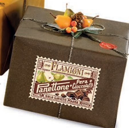
Chocolate Rustic Range - Panettone Dark Chocolate & Pear 1kg x 6 FLA3748