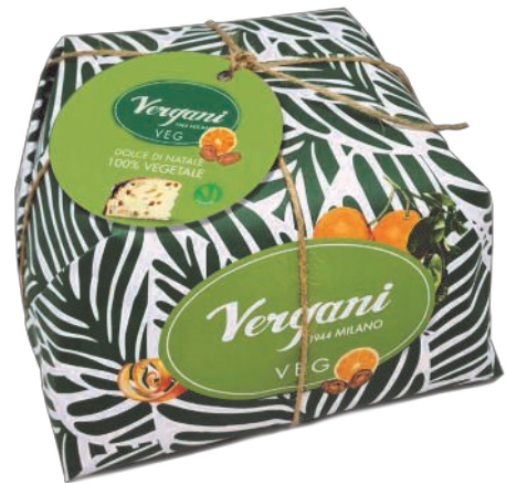
Vegan Christmas Cake with raisins and candied orange peel 750g x 6 VER7105