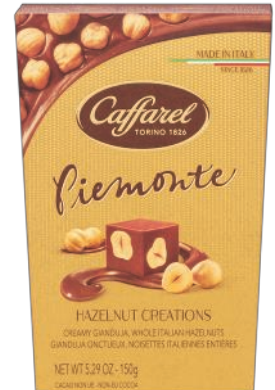
Piemonte Box Milk chocolate cubes with whole hazelnuts 150g x 8 CAF880763