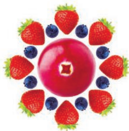
Silvestre - Frutti di Bosco Panettone with wildberries, covered in white chocolate and wildberries 750g x 6 VIN4629