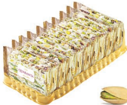
Square Pistachio Cream Nougat Cake 1.8kg - 12 individually wrapped slices QUA404054