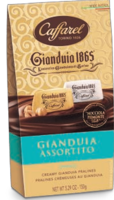
Mixed Milk & Dark Gianduia ballotin chocolate with hazelnut paste 150g x 12 CAF880871