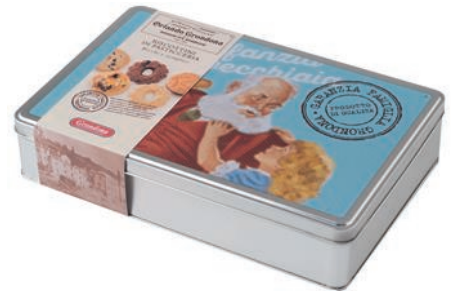
Assorted Patisserie Biscuits in tin by Grondona 310g x 6 GRO9902