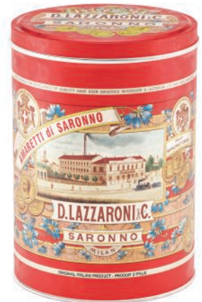
Amaretti Old Time tin 250g x 6 L15060