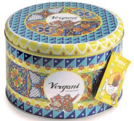
Sicily range Tins - Lemon Cream Panettone filled with Sicily lemon cream 750g x 6 VER1458