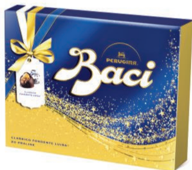
Blue & Gold Baci box Coated in dark chocolate 250g x 10 boxes P14507676