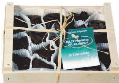
Figs in Chocolate Box Stuffed with walnuts Figs covered in dark chocolate 200g x 12 RAO200B4