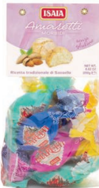
Traditional Amaretti almond flavour 250g x 8 ISA132