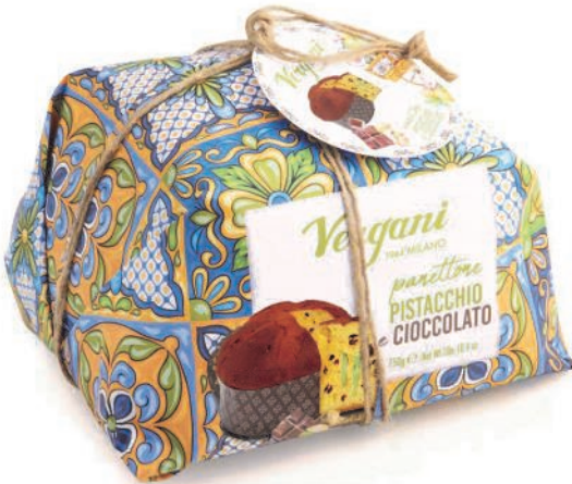
Sicily range - Pistachio Cream & Chocolate Drops Panettone filled with pistachio cream, chocolate drops and covered in dark chocolate 750g x 6 VER9925