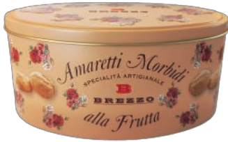
Brezzo - Mixed Fruit Amaretti in tin strawberry, lemon, peach & chocolate flavour 260g x 8 BRE482