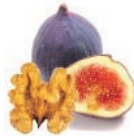
Didime Panettone with figs, walnuts & Malvasia wine 750g x 6 VIN2304