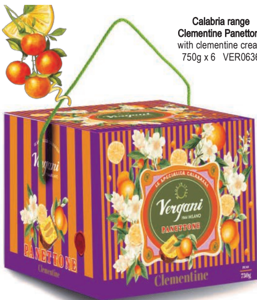
Calabria range Clementine Panettone with clementine cream 750g x 6 VER0636