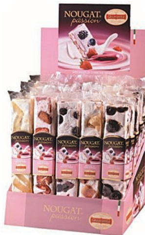
Summer Fruit Selection cherry, exotic fruit, berries, strawberry, lemon 100g x 25 pcs QUA403982