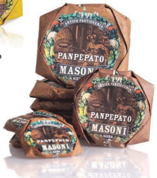
Panpepato with spices by Masoni 250g x 12 MAS108