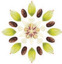
Cocoa - Chocolate Panettone with chocolate drops, covered in dark 70% cocoa chocolate and pistachio nuts 750g x 6 VIN4636