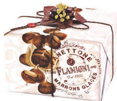
Marron Glace Panettone with pieces of marrons glacés 1kg x 6 FLA3721