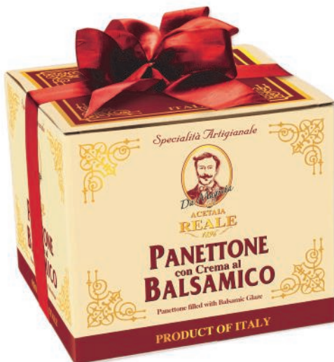
Leonardi - Balsamic Cream Panettone 750g x 6 LE3050