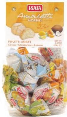
Mixed Fruit Flavours Amaretti tangerine, lemon, and coconut 250g x 8 ISA100