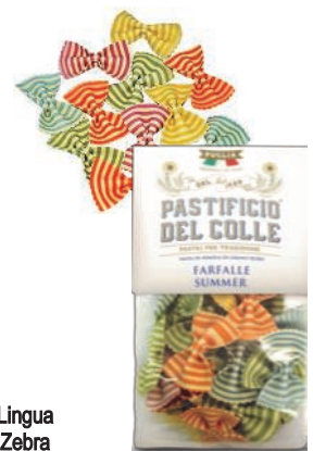
Farfalle Summer handmade 250g x 12 PAS3980