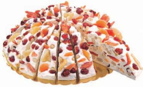
Exotic Fruit Nougat Cake 3.3kg - 20 individually wrapped slices QUA403884