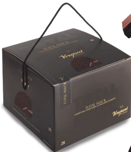
Total Black - Chocolate Panettone Box with cocoa dough and chocolate drops 750g x 6 VER0469