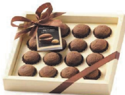
Baci di Dama in box dark biscuits with white chocolate cream 180g x 10 T1612901810