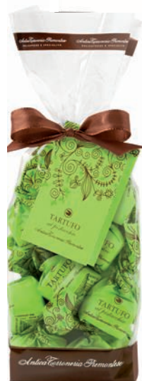
Pistachio Truffle Bag truffles with white chocolate 200g x 12 T0616502000