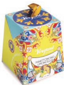
Sicily range Mignon - 100g Limoncello Panettone with Limoncello Cream 100g x 24 VER1410