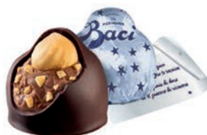
Baci Bulk 3kg x 1 P12439386