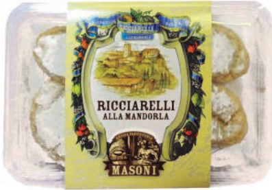
Masoni - Ricciarelli in clear tray IGP Siena 240g x 12 MAS201