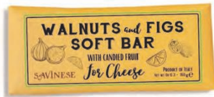
Barretta / Fruit & Nuts Bar condiment for cheese 180g x 12 SAV180DEBR