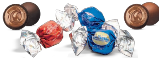
Supreme Blue and Red di Natale Box

Assorted milk and dark chocolates filled with caramel cream 400g x 5 S9777050