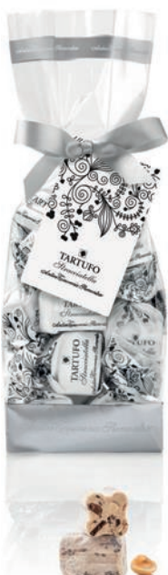
Stracciatella Chocolate Truffle Bag 200g x 12 T0611902010