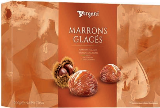
Marrons Glacés box whole (17g) chestnuts by Vergani 200g x 8 VCH49015