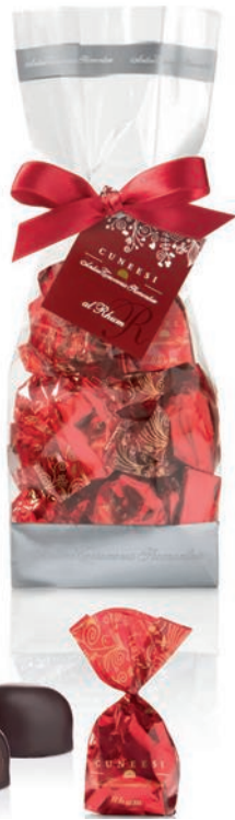
Rum Cuneesi Bag 200g x 12 T0610002020