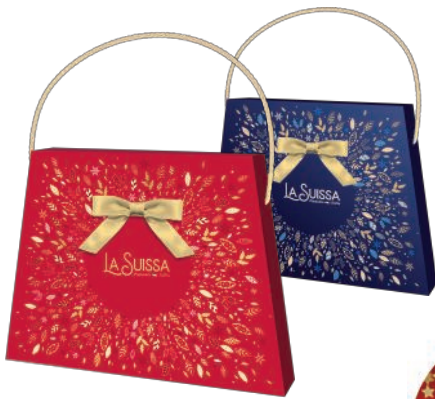
Red and Blue Handbag Box

Milk and dark chocolate pralines filled with caramel cream, hazelnut and tiramisu truffles .210g x 8 S10387080