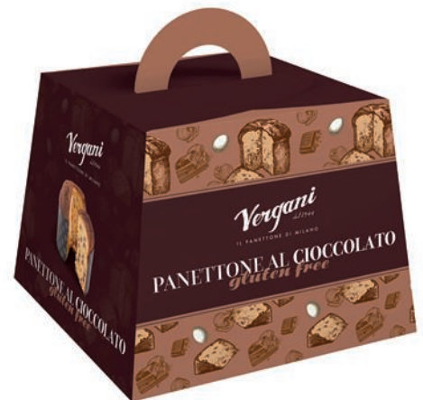
Gluten free Chocolate Panettone with chocolate drops 600g x 6 VER9215