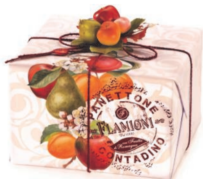
Contadino Panettone Almond glazed cake with candied pear, apple, peach and apricot 1kg x 6 FLA3720