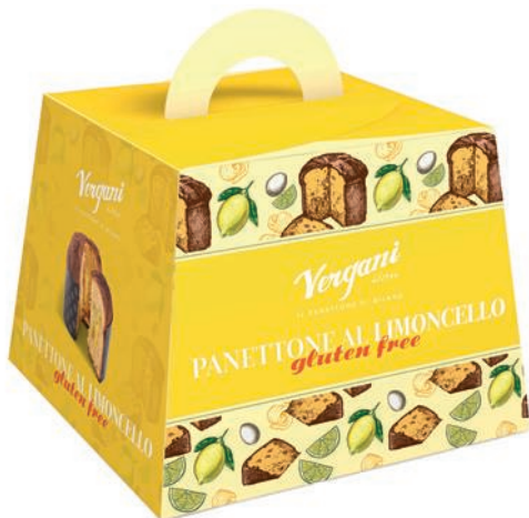
Gluten free Limoncello Panettone with limoncello cream 600g x 6 VER9222