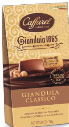
Gianduia ballotin milk chocolate with hazelnut paste 150g x 12 CAF879859