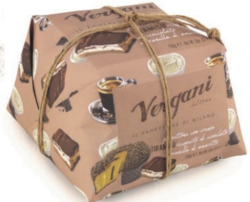
Gourmet range - Tiramisu Panettone filled with tiramisu cream and covered with dark chocolate 750g x 6 VER4760