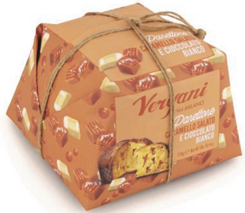
Gourmet range - Salted Caramel Panettone with pieces of soft caramel and white chocolate 750g x 6 VER3404