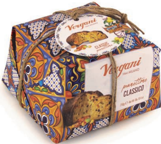
Sicily range - Traditional Milanese Panettone with raisins, candied orange and lemon peel 750g x 6 VER9888