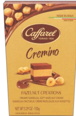
Cremino Box Milk gianduia chocolate with soft hazelnut cream 150g x 8 CAF880766