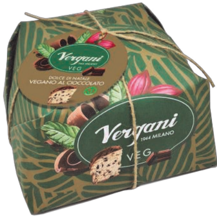
Chocolate Vegan Christmas Cake with chocolate drops 750g x 6 VER9239