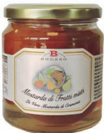
Mustarda - candied mixed fruit chutney by Brezzo 380g x 6 BRE46.3