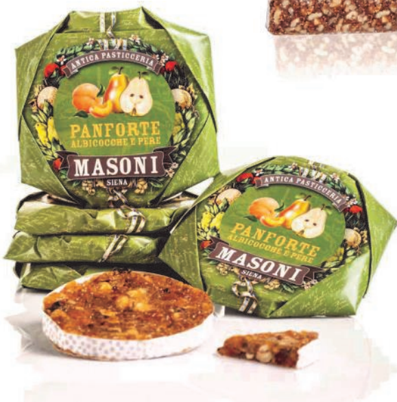
Apricot & Pear Panforte by Masoni 250g x 12 MAS864