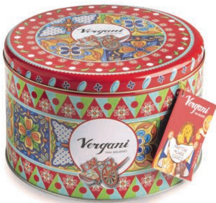
Sicily range Tins - Traditional Milanese Panettone with raisins, candied orange and lemon peel 750g x 6 VER1441