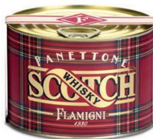
Scotch Whisky Panettone in Tin with Scotch Whisky cream covered with white chocolate and caramelised sugar. 350g x 8 FLA3972