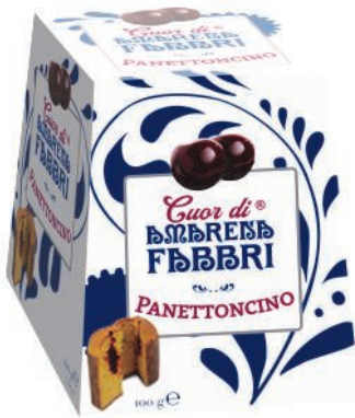
Baby Fabbri Panettone with Fabbri Cherries 100g x 12 FAB9370410