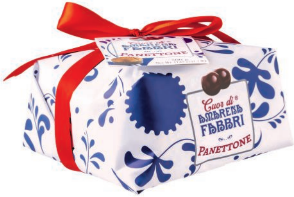
Fabbri Panettone Hand Wrapped with Fabbri Cherries 1Kg x 6 FAB9370412