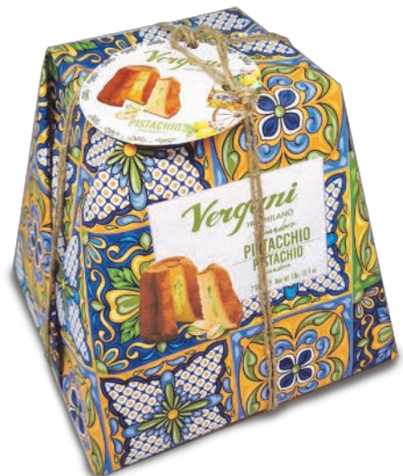
Sicily range - Pistachio Pandoro light cake with Pistachio Cream 750g x 6 VER1397