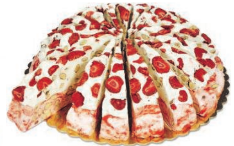
Strawberry & Cream Nougat Cake 3.3kg - 20 individually wrapped slices QUA403885