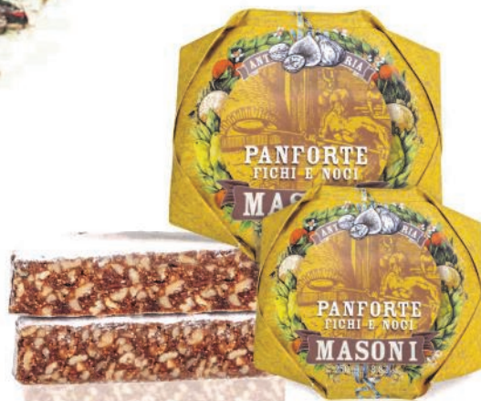
Figs & Walnuts Panforte by Masoni 350g x 12 MAS843 100g x 12 MAS845