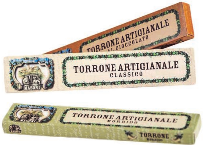
Masoni Almond Nougat HARD - traditional MAS720 SOFT - chocolate coating MAS724 SOFT - traditional MAS722 200g x 12