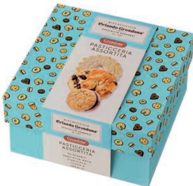
Assorted Patisserie Biscuits in box by Grondona 390g x 6 GRO9961