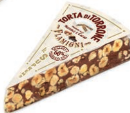
Premium Chocolate Nougat Cake by Flamigni with chocolate and 60% Piedmont hazelnuts 150g x 12 individually wrapped slices FLA79