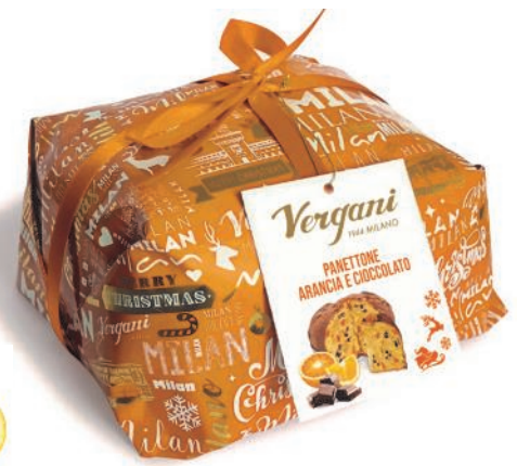
Merry Christmas range - Chocolate & Orange Panettone with chocolate drops, and candied orange peel 750g x 6 VER5798