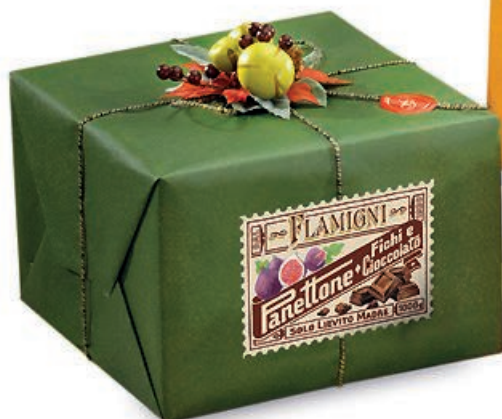
Chocolate Rustic Range - Panettone Dark Chocolate & Figs 1kg x 6 FLA3746