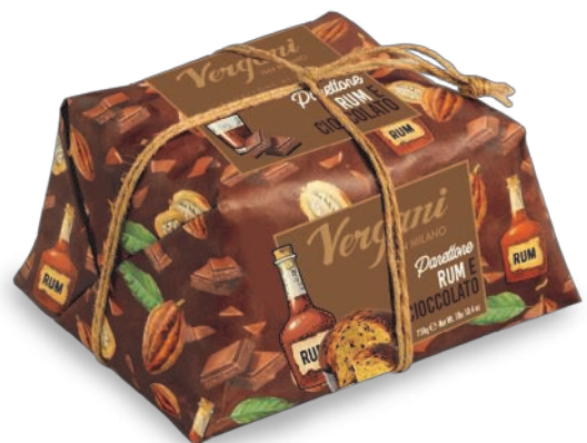
Gourmet range - Rum & Chocolate Panettone with chocolate drops 750g x 6 VER0681