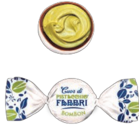
Fabbri Pistachio Chocolates 120g x 10 FAB9173111