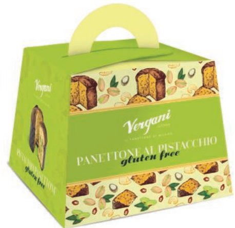
Gluten free Pistachio Panettone with pistachio cream 600g x 6 VER5576