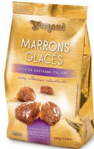
Marrons Glacés bag chestnuts in pieces by Vergani 200g x 20 VCH49000

made solely from chestnuts grown in Italy