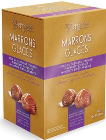
Marrons Glacés box whole chestnuts by Vergani 140g x 12 VCH49013