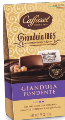
Dark Gianduia ballotin chocolate with hazelnut paste 150g x 12 CAF879860