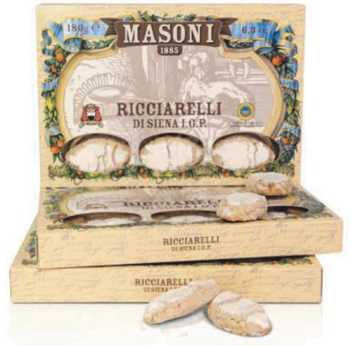
Masoni - Ricciarelli Gift Box IGP Siena by Masoni 180g x 16 MAS204

Almond paste cookies made with freshly crushed almonds, blended with sugar and other ingredients. Due to their soft delicate texture they are among the world's most exquisite pastries.