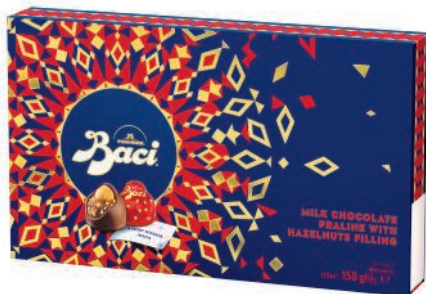
Milk Baci 12 pcs gift box 150g x 6 boxes P14506900