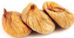
FIG SPECIALITIES from CALABRIA