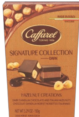
Signature Collection Box Dark chocolate cremino and piemonte 150g x 8 CAF880782