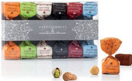
Box Chocolate Truffles Selection 165g x 12 T1605501650