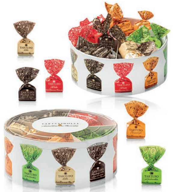
Round Box Chocolate Truffles Selection 350g x 6 T1605503510