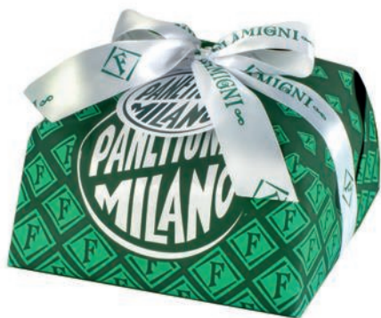
Traditional (Classico) Panettone with raisins, candied orange and lemon peel 1kg x 9 FLA3944 500g x 12 FLA3932