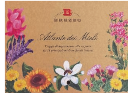
Large Honey Selection Box 18 jars honey assortment by Brezzo The box contains a colourful leaflet detailing each kind of honey. (18 x 35g) x 3 BRE300A