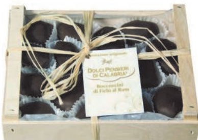
Figs in Rum covered in Dark Chocolate Box Figs soaked in rum, stuffed with cherries and covered in dark chocolate 200g x 12 RAO200B8