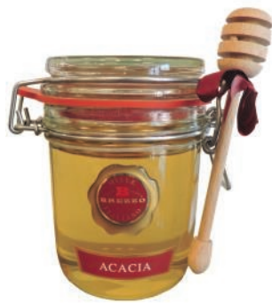
Acacia Honey by Brezzo 400g x 6 BRE39.02