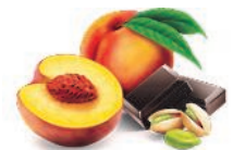
Printemps Panettone with dark chocolate drops, peach and Sicilian pistachio 750g x 6 VIN2298