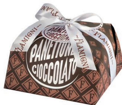
Chocolate Panettone with chocolate drops, glazed 1kg x 9 FLA3947