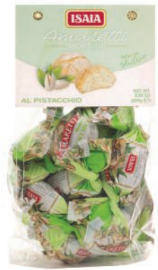
Pistachio Amaretti 250g x 8 ISA005