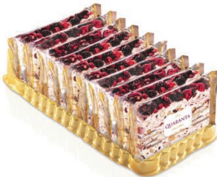
Square Forest Fruit Nougat Cake 1.8kg - 12 individually wrapped slices QUA404053