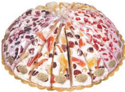
Assorted Fruit Nougat Cake Flavours: Fruit, Berries, Strawberry, Lemon Cake 3.3kg - 20 individually wrapped slices QUA403878