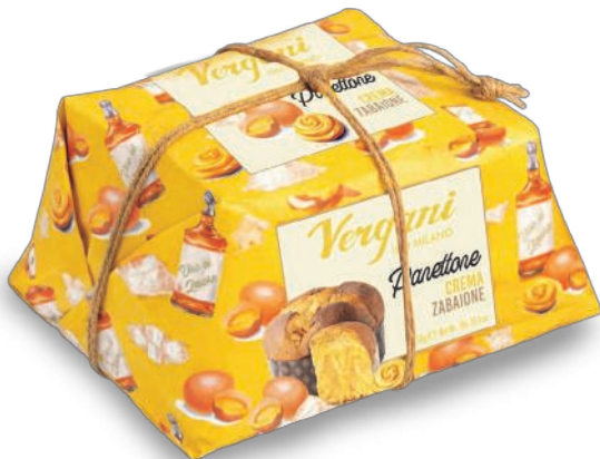
Gourmet range - Zabaione Panettone with Zabaione cream 750g x 6 VER0704