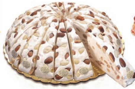
Almond Nougat Cake 3.3kg - 20 individually wrapped slices QUA403890