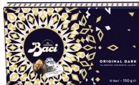
Baci 12 pcs gift box 150g x 6 boxes P12439387