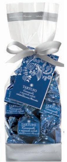
Caramelised Truffle Bag with salted hazelnuts & dark chocolate 200g x 12 T0607002000