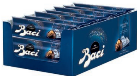
Dark Baci 3 pieces tube display 37.5g x 14 in display P12439533