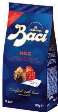
Milk Baci Bag 10 pieces 125g x 12 Bag P14507307