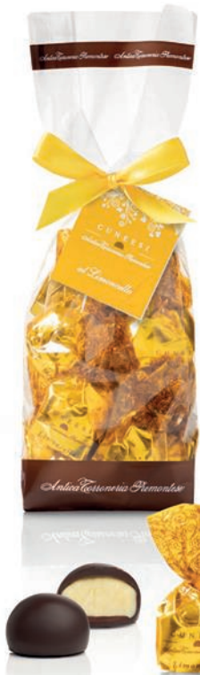
Limocello Cuneesi Bag 200g x 12 T0610402010