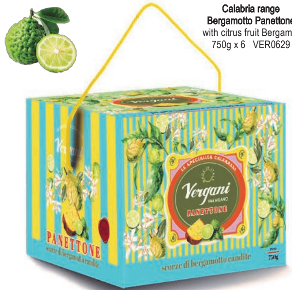
Calabria range Bergamotto Panettone with citrus fruit Bergamot 750g x 6 VER0629