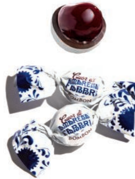
Fabbri Cherry Chocolates wild cherries in syrup 150g x 10 FAB9173110