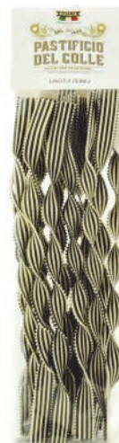
Lingua Zebra handmade 250g x 12 PAS3478