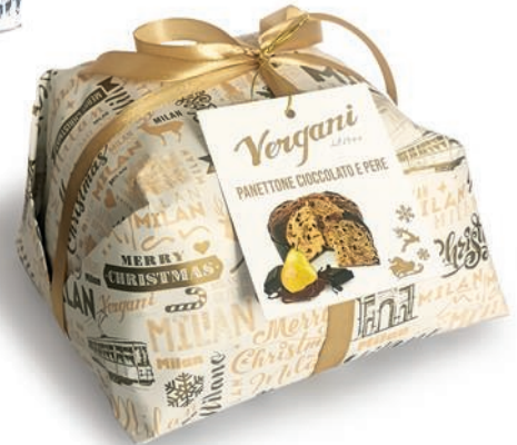
Merry Christmas range - Chocolate & Pear Panettone with chocolate drops, and candied pear 750g x 6 VER8874