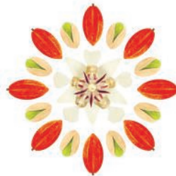
Fastuka Panettone Plain cake covered in white chocolate & pistachio nuts 750g x 6 VIN4605