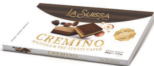
Cremini Gift Box

Cremini milk chocolates with a soft layer of coffee, hazelnut cream. 200g x 6 S9770060