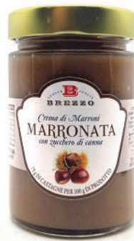
Chestnut Spread by Brezzo 350g x 6 BRE45.8