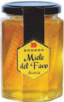
Acacia Honeycomb by Brezzo 290g x 6 BREFA03