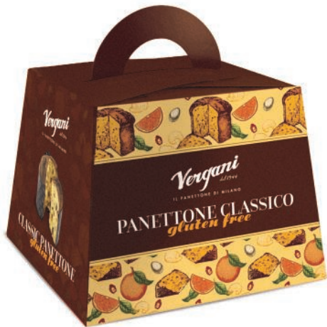
Gluten free Panettone with raisins and candied orange peel 600g x 6 VER2629