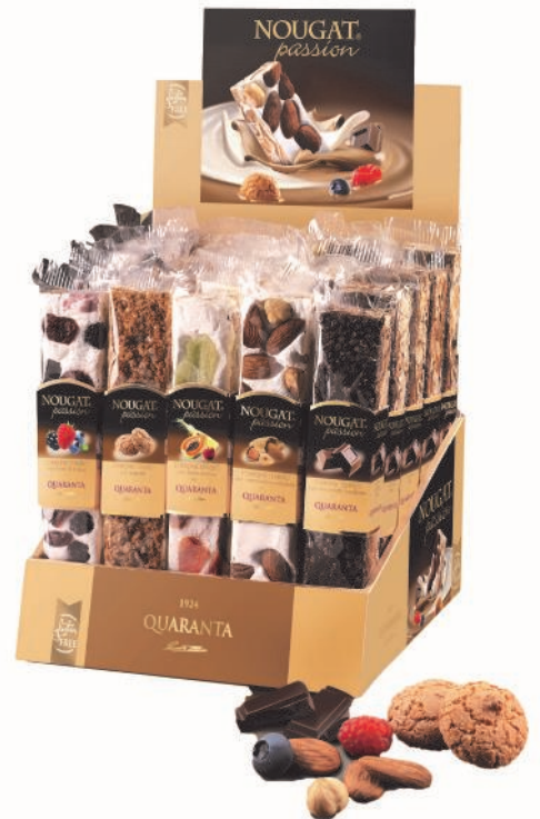
Assorted Soft Nougat Chocolate, Fruit & Nut 100g x 25 pcs QUA403980