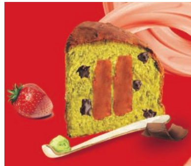
Tokyo Style - Chocolate Panettone with Matcha tea dough, strawberry cream and chocolate drops 800g x 6 VER0599