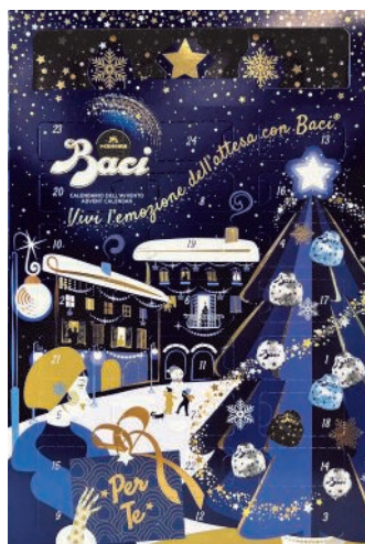
Advent Calendar - Assorted Baci Coated in extra dark, milk and dark chocolate 278g x 10 boxes P14510037