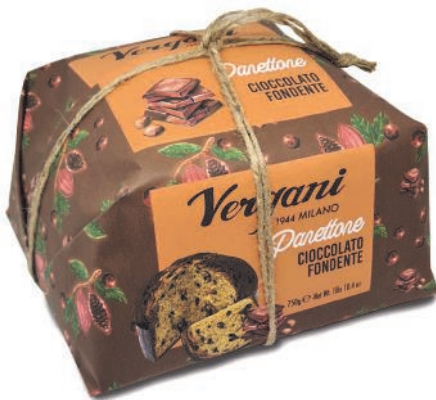
Gourmet range - Dark Chocolate Panettone with chocolate drops 750g x 6 VER0308