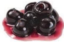
Amarena Fabbri wild cherries in syrup 600g x 6 FAB9981168 400g x 6 FAB9961115 230g x 6 FAB9961138