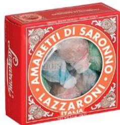
Amaretti Window box 65g x 18 L01157