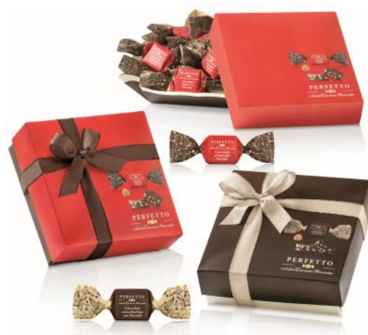
Peretto Red or Brown Box

Red box - milk chocolate with hazelnuts CODE T1616801251 Brown box - Extra dark chocolate with hazelnuts CODE T1602601251 125g x 6