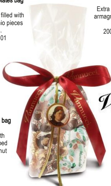
Hazelnut & Almond Chocolates bag by Vannucci Extra dark chocolate filled with hazelnut or almond paste topped with either caramelized hazelnut or almond. 200g x 10 CODE VAN04