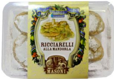
Masoni - Ricciarelli in clear tray IGP Siena 240g x 12 MAS201