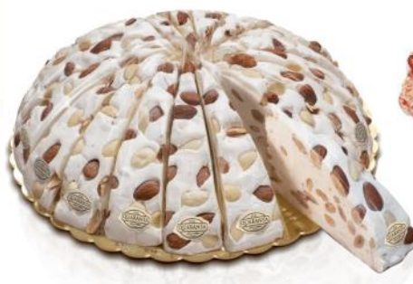
Almond Nougat Cake 3.3kg - 20 slices, each slice 165g CODE QUA403890