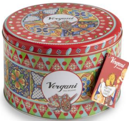
Sicily range Tins - Traditional Milanese Panettone with raisins, candied orange and lemon peel 750g x 6 VER1441