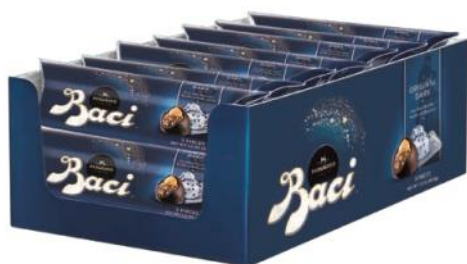
Dark Baci 3 pieces tube display 37.5g x 14 in display CODE P12439533