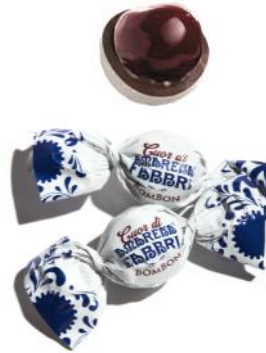
Fabbri Cherry Chocolates wild cherries in syrup 150g x 10 CODE FAB9173110