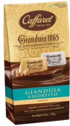
Mixed Milk & Dark Gianduia bag chocolate with hazelnut paste 150g x 12 CODE CAF80871