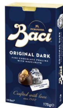
Baci Bijou box 14 pcs 175g x 10 boxes CODE P12439537

Dark chocolate with a whole hazelnut , filled with milk chocolate and pieces of hazelnut. Each piece wrapped in foil contains a messages of love and friendship.