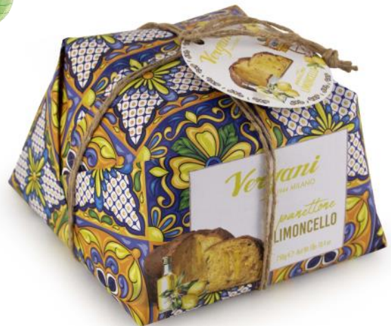
Sicily range - Limoncello Panettone filled with limoncello cream 750g x 6 VER9918