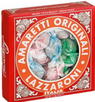
Amaretti Window box 200g x 12 L01168