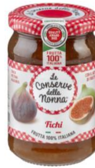
Fig Preserve 340g x 6 CODE NON624