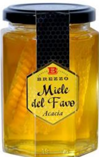
Acacia Honeycomb by Brezzo 250g x 6 CODE BREFA03