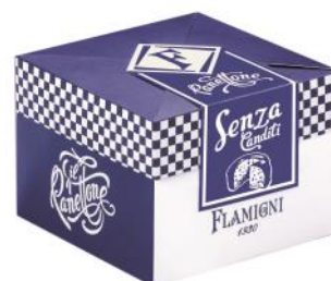
No Candied Peel Panettone Box with raisins, no candied peel 500g x 12 FLA3934