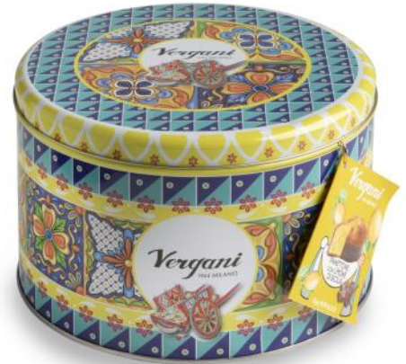
Sicily range Tins - Lemon Cream Panettone filled with Sicily lemon cream 750g x 6 VER1458