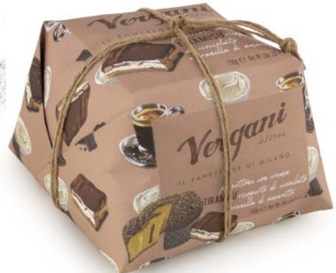
Gourmet range - Tiramisu Panettone filled with tiramisu cream and covered with dark chocolate 750g x 6 VER4760