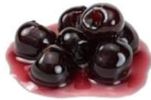
Amarena Fabbri wild cherries in syrup 600g x 6 CODE FAB9981168 400g x 6 CODE FAB9961115 230g x 6 CODE FAB9961138