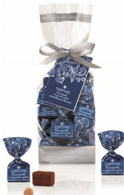
Caramelised Truffle Bag with salted hazelnuts & dark chocolate 200g x 12 CODE T0607002000