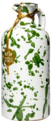
500ml Dotted Terracotta Pots with Extra Virgin Olive oil 500ml x 6 mixed pots ( 2 of each) CODE MAN/POT2

Pots are handmade by artisan craftsmen in Apulia. Each one is unique as it is decorated by hand. Design of pots may vary.