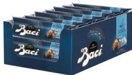
Milk Baci 3 pieces tube display 37.5g x 14 in display CODE P12439595