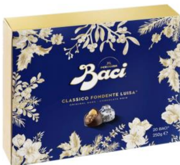
Mistletoe Baci box Coated in dark chocolate 250g x 10 boxes CODE P12560886