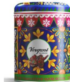
Sicily range Mignon Tins - 100g Traditional Panettone with raisins, candied orange and lemon peel 100g x 12 (4 x each kind of tin) VER0339