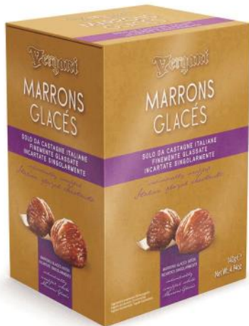
Marrons Glacés box whole chestnuts by Vergani 140g x 24 CODE VCH49013