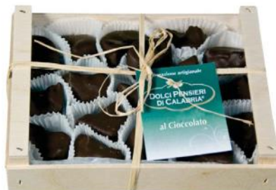
Figs in Chocolate Box Stuffed with walnuts Figs covered in dark chocolate 200g x 12 CODE RAO200B4