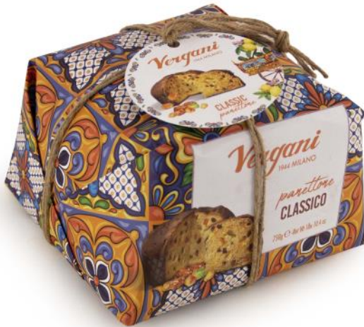
Sicily range - Traditional Milanese Panettone with raisins, candied orange and lemon peel 750g x 6 VER9888