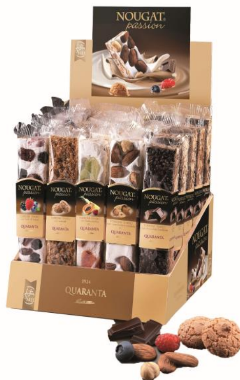
Assorted Soft Nougat Chocolate, Fruit & Nut 100g x 25 pcs CODE QUA403980