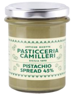
Camilleri Pistachio Cream 45% Pistachio 200g x 10 CODE VIN202