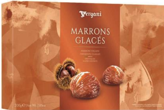
Marrons Glacés box whole (17g) chestnuts by Vergani 200g x 8 CODE VCH49015