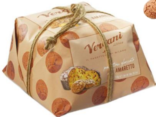
Gourmet range - Amaretto Panettone with candied orange peel and raisins covered with almond glaze and crushed amaretto. 750g x 6 VER2933