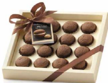
Baci di Dama in box dark biscuits with white chocolate cream 180g x 10 T1612901810