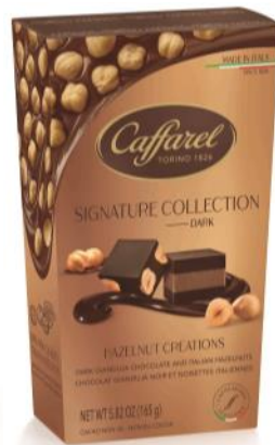
Signature Collection Dark chocolate cremino and piemonte 150g x 8 CODE CAF80782