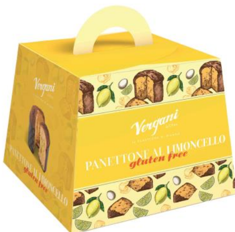
Gluten free Limoncello Panettone with limoncello cream 600g x 6 VER9222