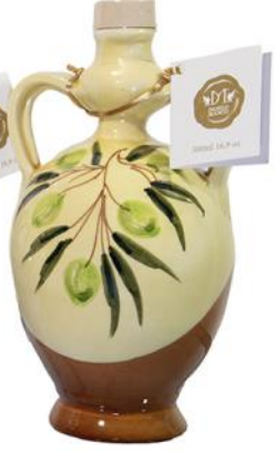
500ml Traditional Terracotta Pots with Extra Virgin Olive oil 500ml x 6 mixed pots (2 of each king) CODE MAN/POT1