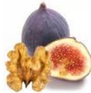
Didime Panettone with figs, walnuts & Malvasia wine 750g x 6 CODE VIN2304