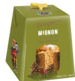
100g Chocolate & Pear Panettone with chocolate drops 100g x 24 VER8461