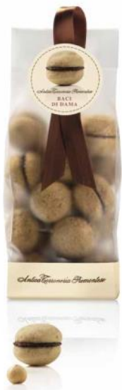
Baci di Dama with dark chocolate cream 200g x 8 T0612902020