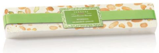
Antica Torroneria - Soft Nougat Hazelnut & Almond 150g x 12 CODE T0604101510 Almond & Pistachio 150g x 12 CODE T0606901500