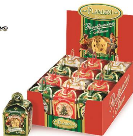
80g Traditional Panettone in display with raisins, candied orange and lemon peel 80g x 36 FLA3900