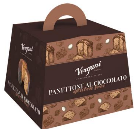
Gluten free Chocolate Panettone with chocolate drops 600g x 6 VER9215