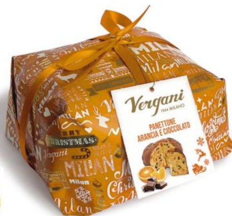
Merry Christmas range - Chocolate & Orange Panettone with chocolate drops, and candied orange peel 750g x 6 VER5798