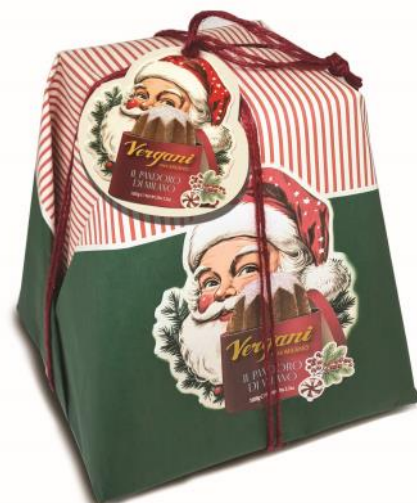
Santa range - Traditional Pandoro light plain cake, no raisins or candied fruit peel, dusted with icing sugar 1kg x 6 VER4685