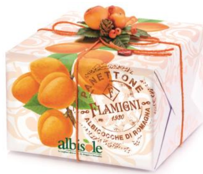
Apricot Panettone with Albisole apricot from Emilia-Romagna