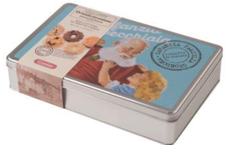
Assorted Patisserie Biscuits in tin by Grondona 310g x 6 GRO9902