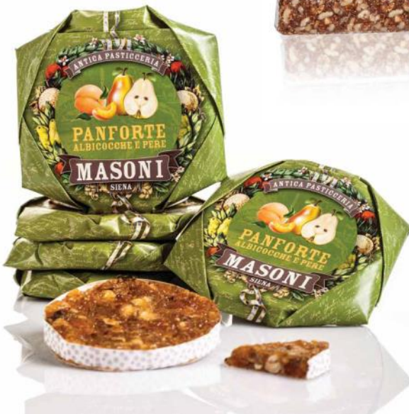
Apricot & Pear Panforte by Masoni 250g x 12 MAS864