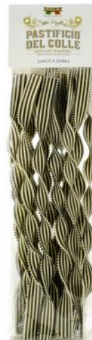
Lingua Zebra handmade 250g x 12 CODE PAS03