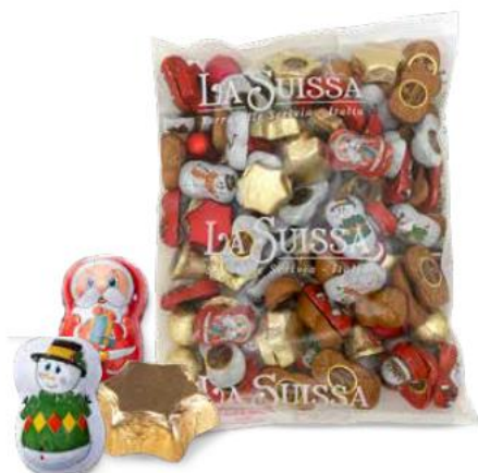
Assorted Christmas Bulk Milk chocolates filled with 1Kg x 1 CODE SUI28757