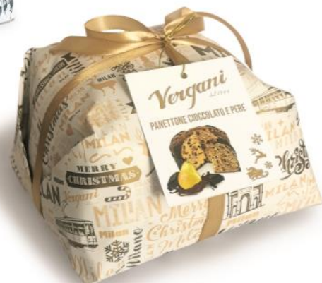
Merry Christmas range - Chocolate & Pear Panettone with chocolate drops, and candied pear 750g x 6 VER8874