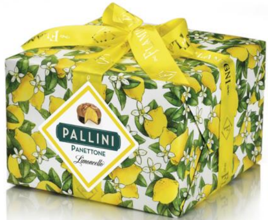
Limoncello Panettone with Pallini Limoncello cream and candied citron 850g x 9 FLA3991