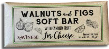
Barretta / Fruit & Nuts Bar condiment for cheese 180g x 12 CODE SAV180DEBR