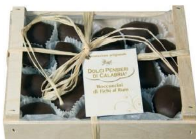
Figs in Rum covered in Dark Chocolate Box Figs soaked in rum covered in dark chocolate 200g x 12 CODE RAO200B8