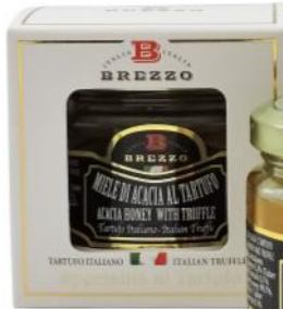
Truffle Honey by Brezzo 120ml x 6 CODE BRE70M