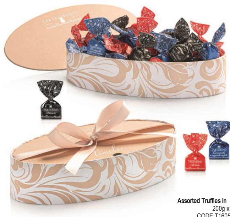
Assorted Truffles in Oval Beige Box 200g x 8 CODE T1605502170

Red box - milk chocolate with hazelnuts CODE T1616801251 Brown box - Extra dark chocolate with hazelnuts CODE T1602601251 125g x 6