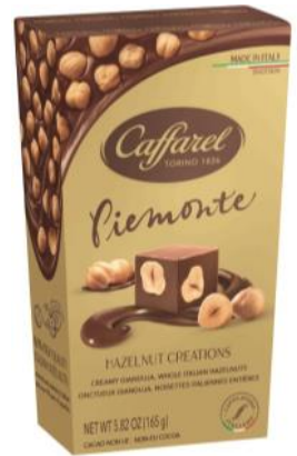
Piemonte Box Milk chocolate cubes with whole hazelnuts 150g x 8 CODE CAF80763