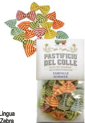
Farfalle Summer handmade 250g x 12 CODE PAS02