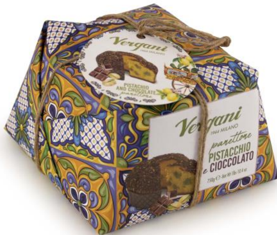
Sicily range - Pistachio Panettone filled with pistachio cream, covered in dark chocolate and sprinkled with crushed pistachio nuts 750g x 6 VER9925