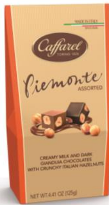
Piemonte Assorted window ballotin Milk and dark chocolate cubes with whole hazelnuts 125g x 12 CODE CAF80291