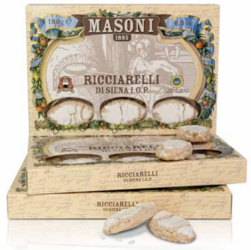
Masoni - Ricciarelli Gift Box IGP Siena by Masoni 180g x 16 MAS204

Almond paste cookies made with freshly crushed almonds, blended with sugar and other ingredients. Due to their soft delicate texture they are among the world's most exquisite pastries.