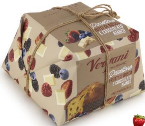
Gourmet range - Wildberries Panettone with wild strawberries, raspberries, blackberries, blackcurrant and white chocolate 750g x 6 VER9796