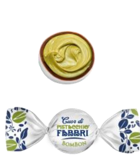
Fabbri Pistachio Chocolates 120g x 10 CODE FAB9173111