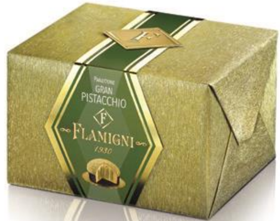
Gran Pistachio Panettone with Pistachio cream coated with white chocolate & pistachio grains 950g x 9 FLA3682