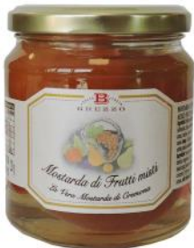
Mostarda - candied mixed fruit chutney by Brezzo 380g x 6 CODE BRE46.3