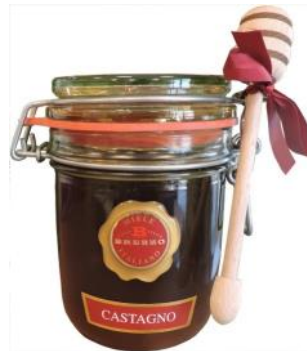
Chestnut Honey by Brezzo 400g x 6 CODE BRE39.12