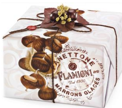
Marrone Glaces Panettone with pieces of marron glace