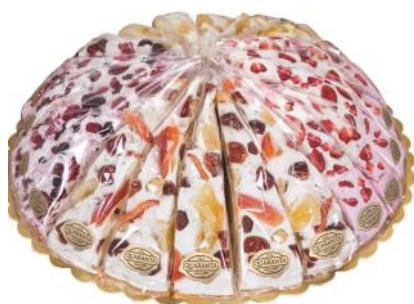
Assorted Fruit Nougat Cake Flavours: Fruit, Berries, Strawberry, Lemon Cake 3.3kg - 20 individually wrapped slices CODE QUA403878