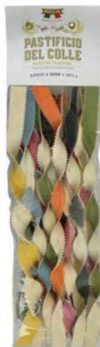
Lingua Biricchina handmade 250g x 12 CODE PAS10