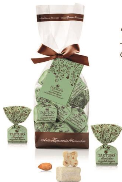
Almond & White Chocolate Truffle Bag 200g x 12 CODE T0608102000