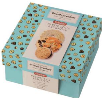
Assorted Patisserie Biscuits in box by Grondona 390g x 6 GRO9961