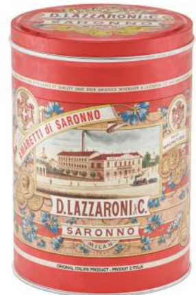
Amaretti Old Time tin 250g x 6 L15060