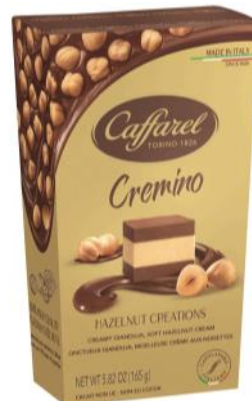
Cremino Box Milk gianduia chocolate with soft hazelnut cream 150g x 8 CODE CAF80766