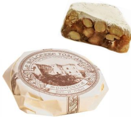
Marchi Vanda - Premium Panforte artisan soft panforte with honey 250g x 12 CODE MVPANF4