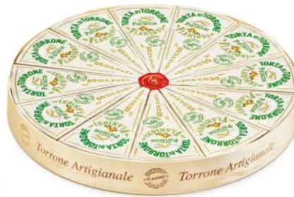
Premium Pistachio Nougat Cake by Flamigni with 60% pistachios 150g x 12 individually wrapped slices CODE FLA78