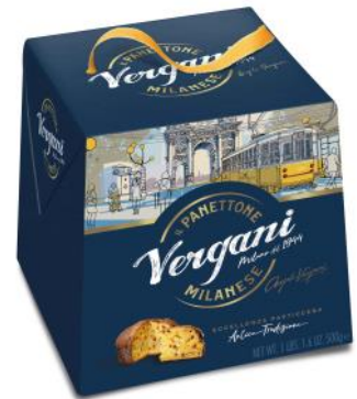
Traditional Milanese Panettone with raisins, candied orange and lemon peel 1Kg x 6 VER0014 750g x 6 VER0021