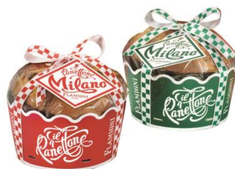
Traditional Panettone in Paper Cup In green and red cups with raisins, candied orange and lemon peel 350g x 12 FLA3940