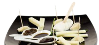
Condiment Selection Display for Cheeses by Leonardi Red onion, pear, figs and honey 130g x 16 CODE LE1540