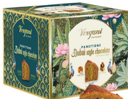
Dubai Chocolate & Pistachio Panettone dough enriched with cocoa, Pistachio & Kataifi cream and chocolate drops, bringing a taste of Middle East pastry with perfect balance of smoothness and crunchy texture. Packaging is designed with luxurious gold details making it a perfect, sophisticated gift.