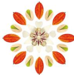
Fastuka Panettone Plain cake covered in white chocolate & pistachio nuts 750g x 6 CODE VIN4605