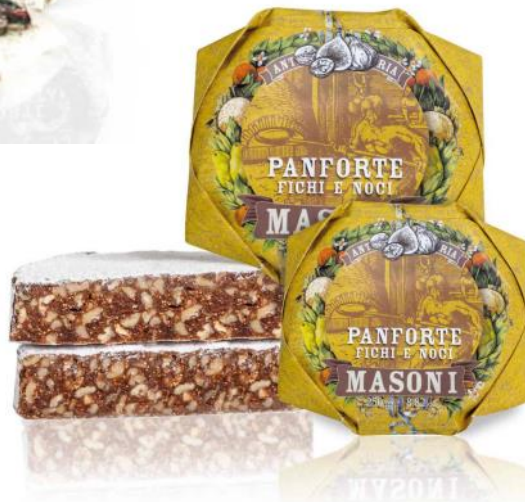
Figs & Walnuts Panforte by Masoni 350g x 12 MAS843 100g x 12 MAS845