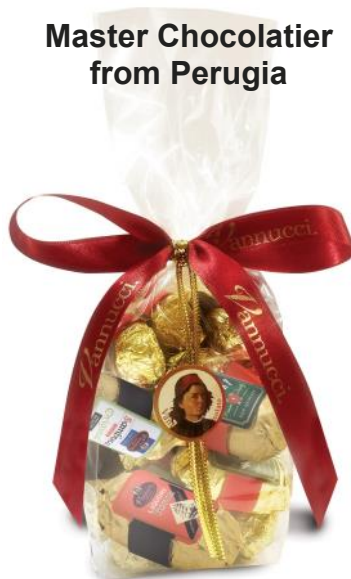
Liquore Chocolates bag by Vannucci Extra dark chocolate filled with armagnac, whisky, grappa, rum and sambuca. 200g x 10 CODE VAN02