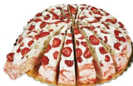
Strawberry & Cream Nougat Cake 3.3kg - 20 individually wrapped slices CODE QUA403885