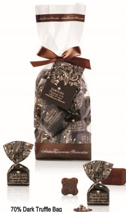
70% Dark Truffle Bag 200g x 12 CODE T0609102000