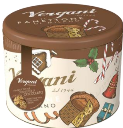
Tin - Chocolate Panettone with chocolate drops 750g x 6 VER9550