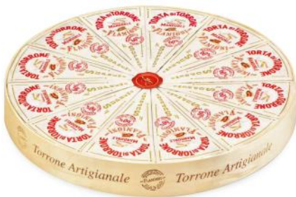
Premium Almond Nougat Cake by Flamigni with 60% almonds 150g x 12 individually wrapped slices CODE FLA77