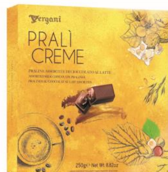
Milk chocolate Pralines Box By Vergani Assorted Pralines with cream fillings 250g x 8 CODE VCH60105