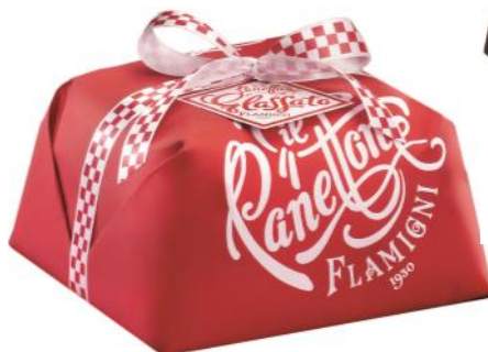
Glazed Panettone with raisins, candied orange and lemon peel, almond glazed 1kg x 9 FLA3945