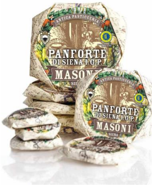
Masoni IGP Siena Panforte 450g x 12 MAS132 250g x 12 MAS134 100g x 12 MAS135