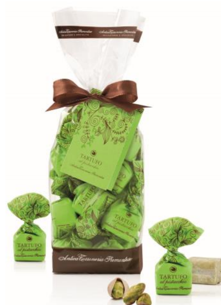
Pistachio Truffle Bag truffles with white chocolate 200g x 12 CODE T0616502000