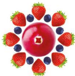
Silvestre - Frutti di Bosco Panettone with wildberries, covered in white chocolate and wildberries 750g x 6 CODE VIN4629