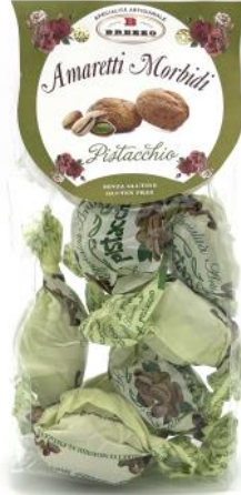
Pistachio Amaretti 150g x 6 CODE BRE590