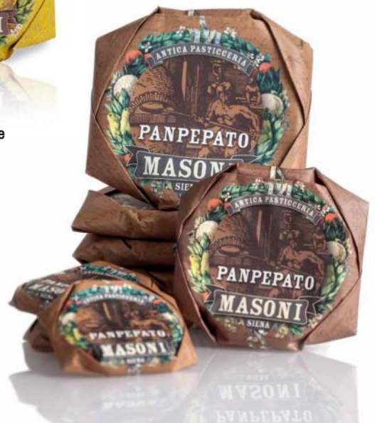
Panpepato with spices by Masoni 250g x 12 MAS108