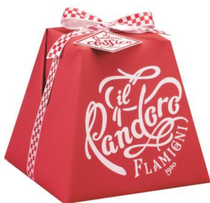
Pandoro Box 1kg x 6 CODE FLA3340