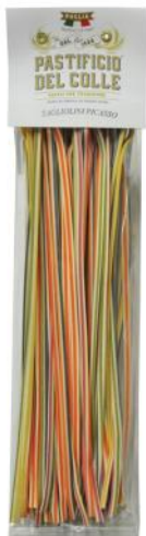
Tagliolini Picasso handmade 250g x 12 CODE PAS01