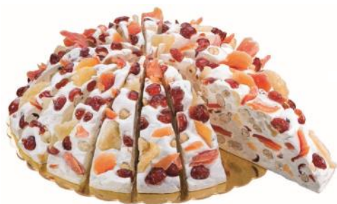
Exotic Fruit Nougat Cake 3.3kg - 20 individually wrapped slices CODE QUA403884