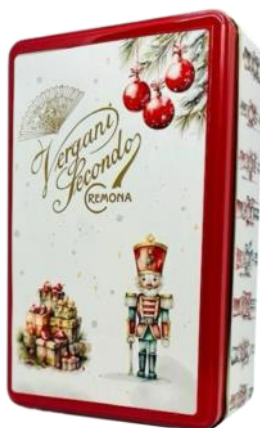
Nutmcracker tin By Vergani Milk Chocolates with hazelnut cream 140g x 10 CODE VCH60005