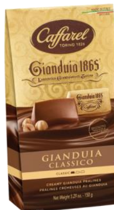
Gianduia window ballotin milk chocolate with hazelnut paste 150g x 12 CODE CAF79859