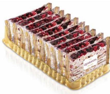
Square Forest Fruit Nougat Cake 1.8kg - 12 individually wrapped slices CODE QUA404053