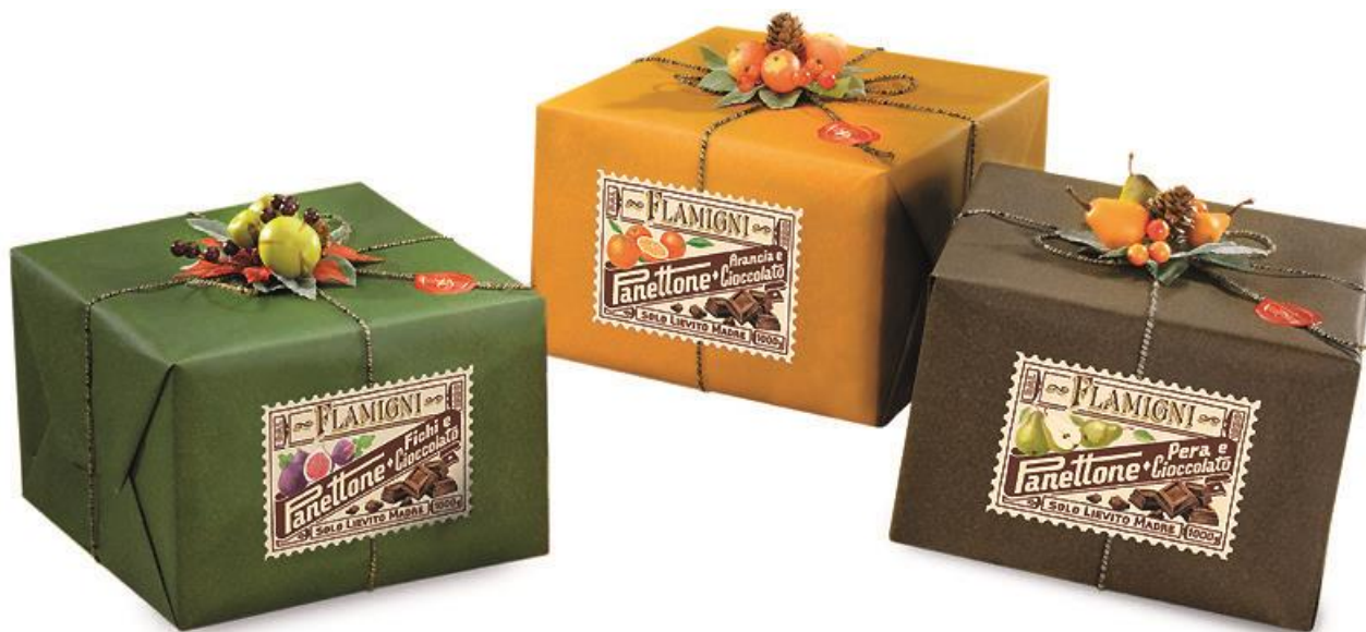
Chocolate Rustic Panettone Assortment in Box Dark Chocolate & Figs, Chocolate & Pear, Chocolate & Orange 1kg x 9 (3 panettone of each kind) CODE FLA3745