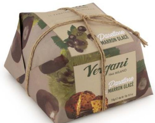
Gourmet range - Marrons glaces Panettone with marrons glaces 750g x 6 VER7051