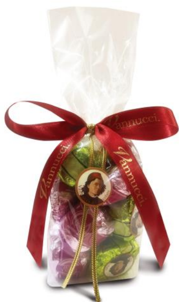
Pistachio & Strawberry Chocolates bag by Vannucci Milk and Extra dark chocolate filled with pistachio mousse and pistachio pieces or strawberry pieces. 200g x 10 CODE VAN01