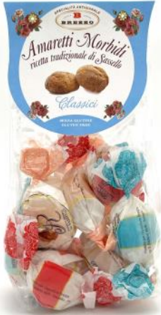
Traditional Amaretti almond flavour 150g x 6 CODE BRE504