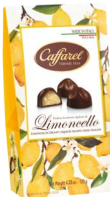
Limoncello ballottin Dark chocolate with liqueur filling 120g x 12 CODE CAF79977