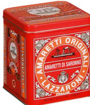
Amaretti tin 450g x 4 L01024