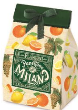
Traditional Panettone in Gift Bag with raisins, candied orange and lemon peel 500g x 12 FLA3731