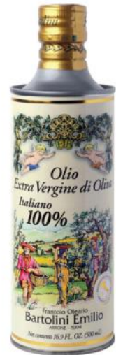
Gli Angeli tin medium fruity EVOO from Umbria by Bartolini 500ml x 6 CODE BAR008