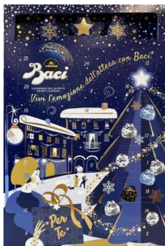
Advent Calendar - Assorted Baci Coated in extra dark, milk and dark chocolate 278g x 10 boxes CODE P12613345