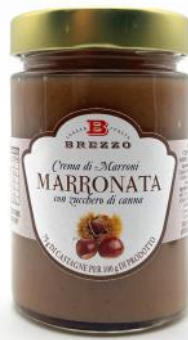
Chestnut Spread by Brezzo 350g x 6 CODE BRE45.8