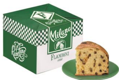
Traditional (Classico) Panettone Box with raisins, candied orange and lemon peel 500g x 12 FLA3932