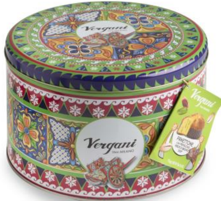
Sicily range Tins - Pistachio Panettone filled with "Bronte" DOP Pistachio cream 750g x 6 VER1465