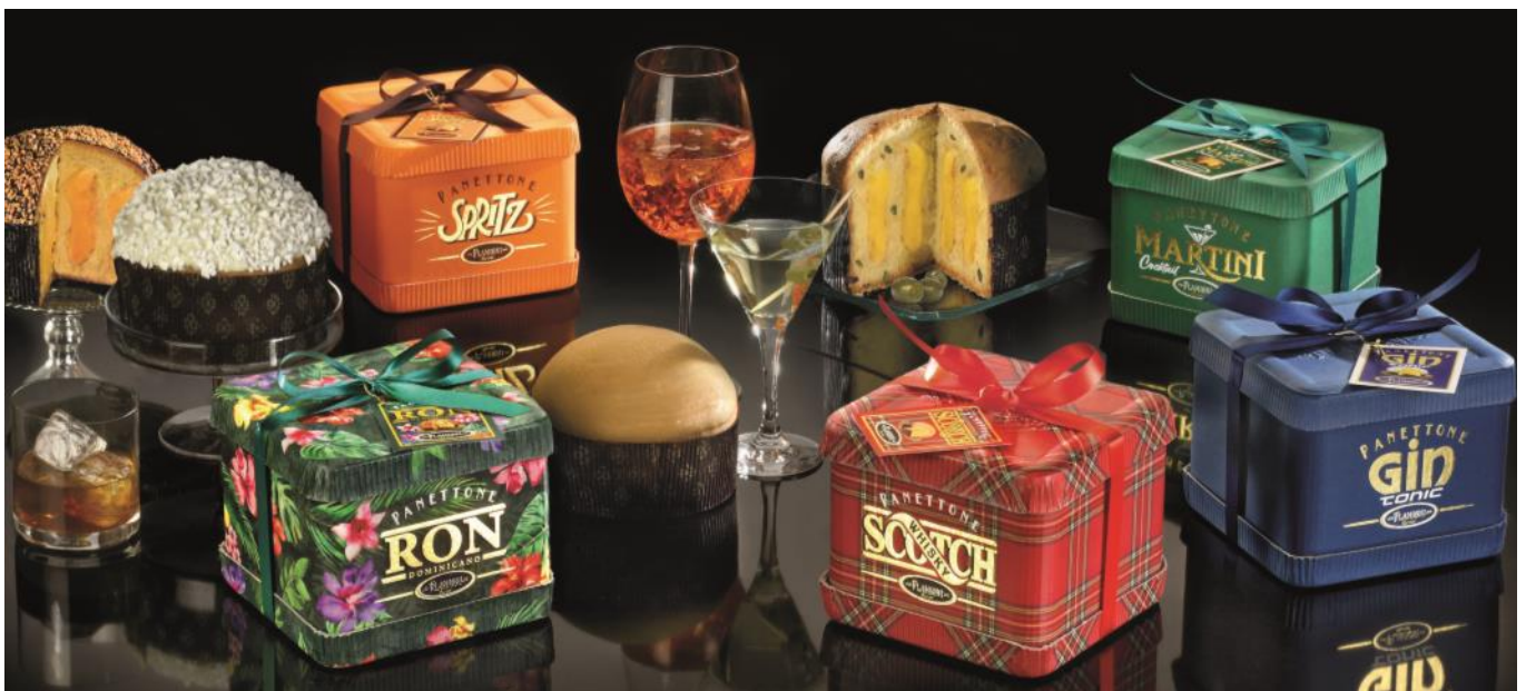
Cocktail Cream Selection Panettone Panettone Gin Tonic, Rum, Martini, Spritz and Scotch cream. 350g x 18 (5 kinds of panettone) FLA3975