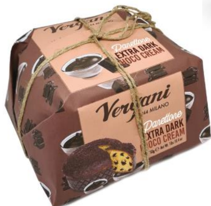
Gourmet range - Extra Dark Chocolate Cream Panettone 750g x 6 VER0322