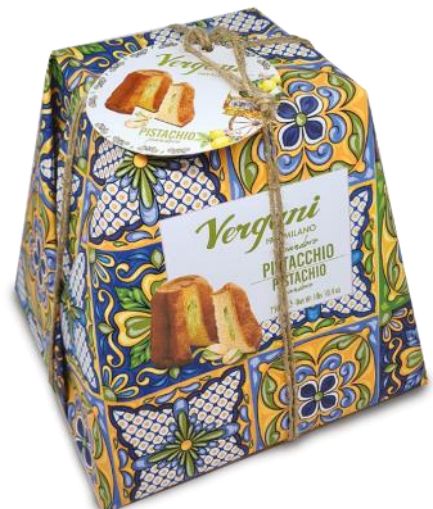
Sicily range - Pistachio Pandoro light cake with Pistachio Cream 750g x 6 VER1397