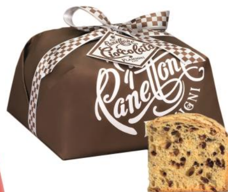
Chocolate Panettone with chocolate drops, glazed 1kg x 9 FLA3947