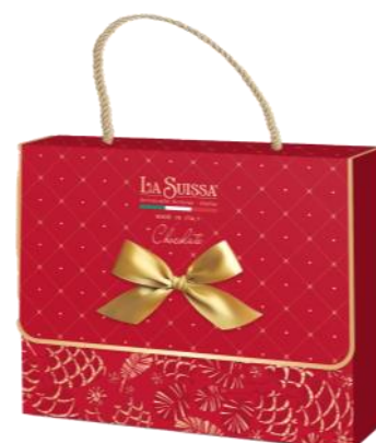
Handbag Box Milk chocolates filled with hazelnut, amaretto, coffee and cocoa cream. 500g x 8 CODE SUI28812