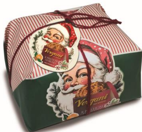
Santa range - Traditional Milanese Panettone with raisins, candied orange and lemon peel 1kg x 6 VER4371