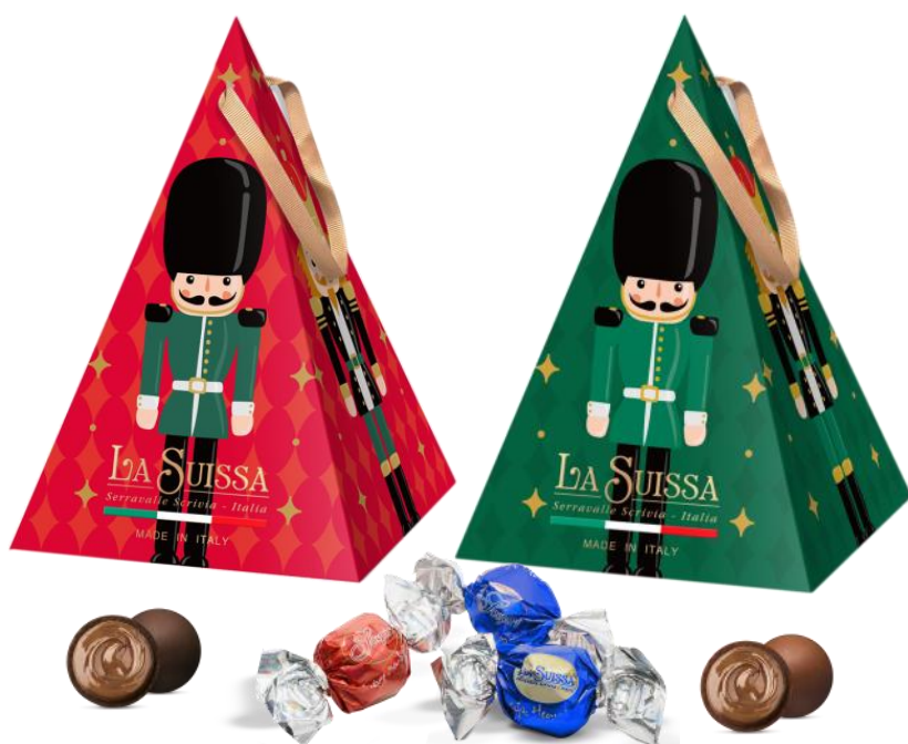
Pyramid Box Milk and dark chocolates filled with caramel cream. 200g x 8 CODE SUI29912