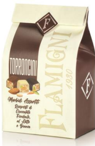
Flamigni Nougat in bags Covered in chocolate assorted soft nougat in 5 flavours: orange, lemon, vanilla, milk chocolate and dark chocolate 180g x 12 CODE FLA178