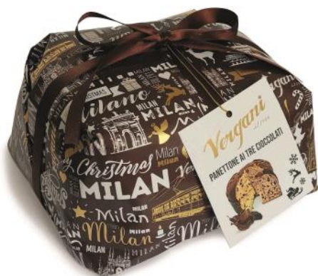
Merry Christmas range - Three Chocolate Panettone with chocolate drops, sprinkled with chocolate drops 750g x 6 VER8898