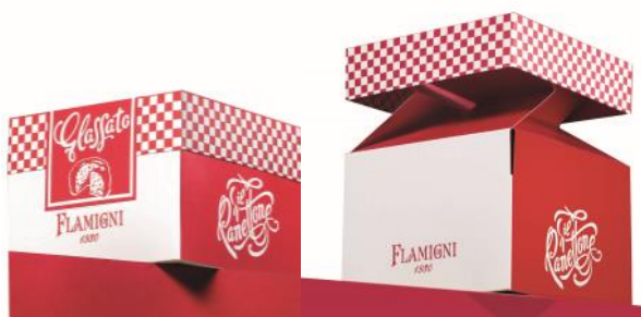
Glazed Panettone Box with raisins, candied orange and lemon peel, almond glazed 500g x 12 FLA3933