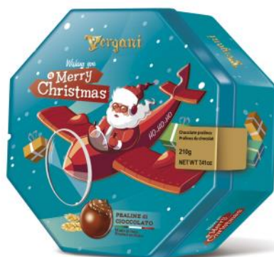
Christmas Blue tin By Vergani Milk Chocolate Pralines with hazelnuts and cereals 210g x 8 CODE VCH63240