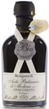
Organic Invecchiato "Riserva" 10* Balsamic Vinegar of Modena by Mengazzoli 250ml x 3 CODE MEG4309