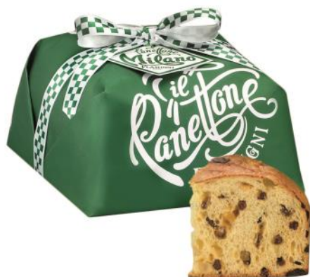
Traditional (Classico) Panettone with raisins, candied orange and lemon peel 1kg x 9 FLA3944