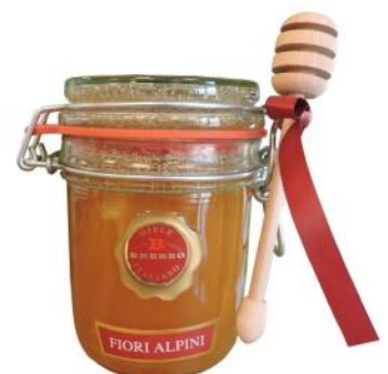
Wildflower Honey from the Alps by Brezzo 400g x 6 CODE BRE39.06