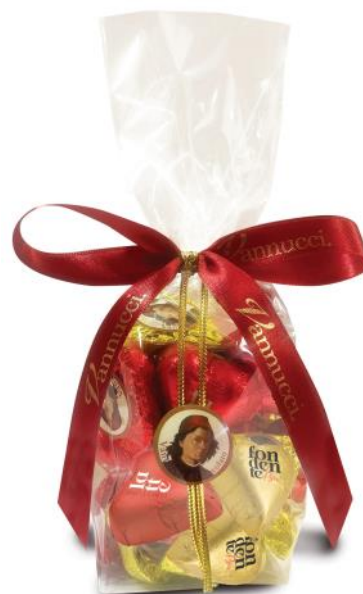
Liquore Chocolates bag by Vannucci Milk and 73% Extra dark heart shaped chocolates. 200g x 10 CODE VAN03