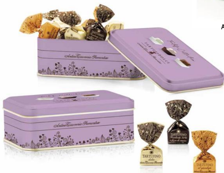
Assorted Small Truffles in purple tin 140g x 8 CODE T1705501410