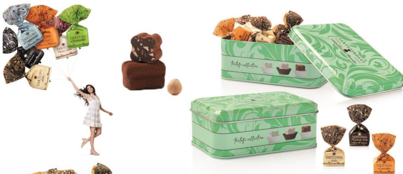
Assorted Small Truffles in green tin 140g x 8 CODE T1705501420