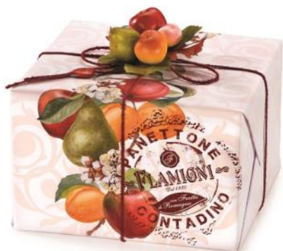
Contadino Panettone Almond glazed cake with candied pear, apple, peach and apricot