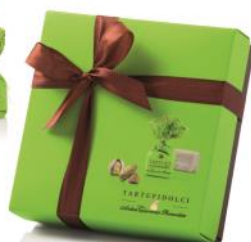
Truffle in gift box Beige - Dark chocolate & hazelnuts 125g x 6 CODE T1604601252 Green - White chocolate & pistachio 125g x 6 CODE T1616501250