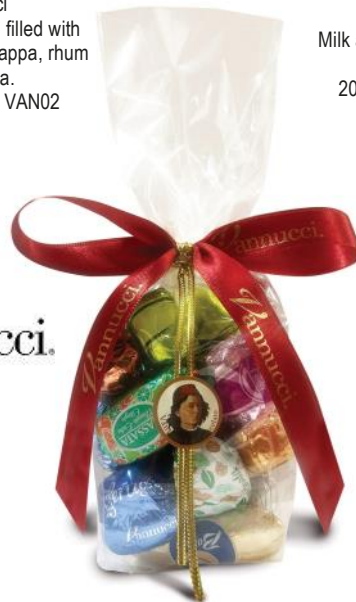
Assorted Chocolate Pralines bag by Vannucci Selection of chocolates. 200g x 10 CODE VAN05