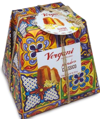
Sicily range - Pandoro light cake without candied fruit or raisins, dusted with icing sugar 750g x 6 VER9895