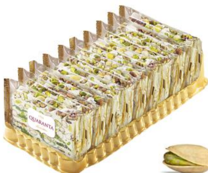
Square Pistachio Cream Nougat Cake 1.8kg - 12 individually wrapped slices CODE QUA404054