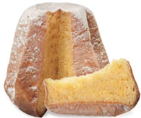
Traditional Pandoro Box light plain cake, no raisins or candied fruit peel, dusted with icing sugar 750g x 6 VER8263