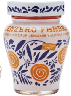
Ginger Fabbri ginger in syrup 230g x 6 CODE FAB9172020