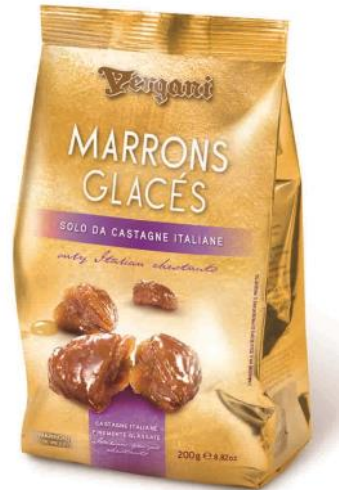
Marrons Glacés bag chestnuts in pieces by Vergani 200g x 20 CODE VCH49000

made solely from chestnuts grown in Italy