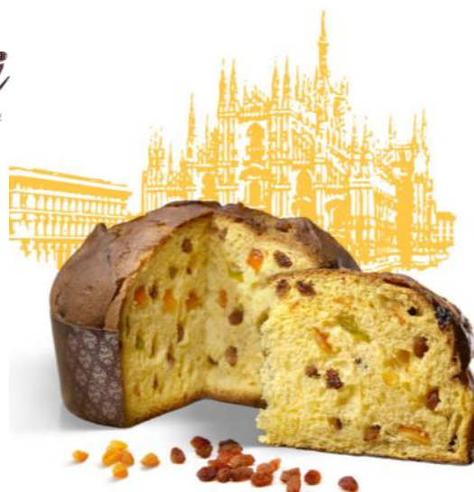
Merry Christmas range - Traditional Milanese Panettone with raisins, candied orange and lemon peel 750g x 6 VER8805 500g x 6 VER8799