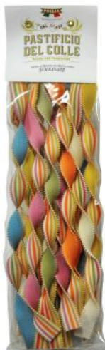
Sviolate handmade 250g x 12 CODE PAS06