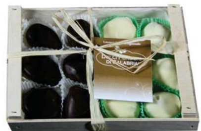
Figs in Dark and White Chocolate Box Figs covered in dark and white chocolate 200g x 12 CODE RAO200B5