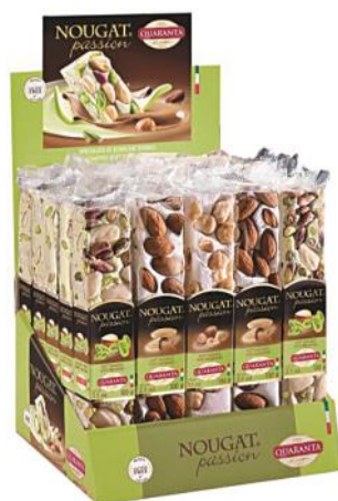
Traditional Soft Nougat pistachio, almond, hazelnut 100g x 25 pcs CODE QUA403984