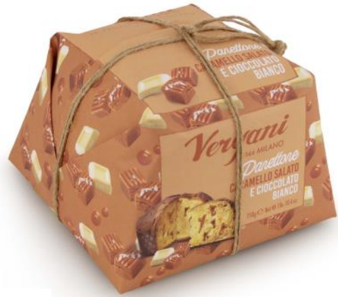
Gourmet range - Salted Caramel Panettone with pieces of soft caramel and white chocolate 750g x 6 VER3404