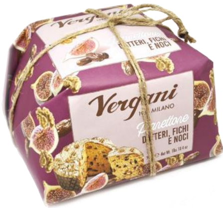
Gourmet range - Date, Fig & Walnut Panettone 750g x 6 VER9949