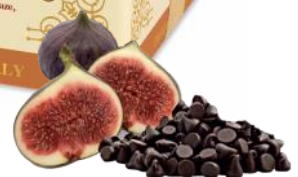
Leonardi - Balsamic Cream Panettone 750g x 6 CODE LE3050