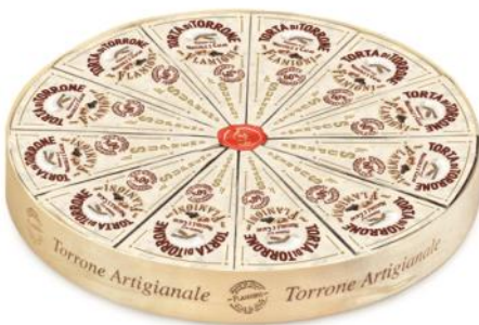
Premium Chocolate Nougat Cake by Flamigni with chocolate and 60% Piedmont hazelnuts 150g x 12 individually wrapped slices CODE FLA79