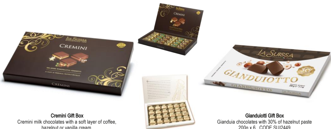
Cremini Gift Box Cremini milk chocolates with a soft layer of coffee, hazelnut or vanilla cream. 280g x 6 CODE SUI24465