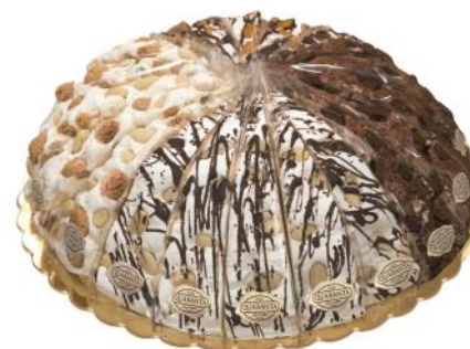
Assorted Chocolate Cream Nougat Cake 3.3kg - 20 individually wrapped slices CODE QUA403879