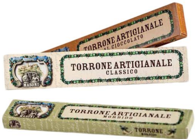
Masoni Almond Nougat HARD - traditional CODE MAS720 SOFT - chocolate coating CODE MAS724 SOFT - traditional CODE MAS722 200g x 12