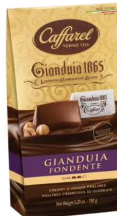
Dark Gianduia window ballotin chocolate with hazelnut paste 150g x 12 CODE CAF79860