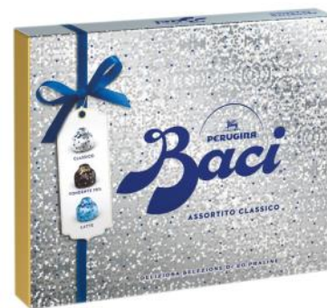
Silver Assorted Baci gift box Coated in extra dark, milk and dark chocolate 250g x 10 boxes CODE P12597082