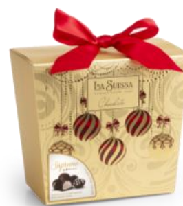
Supreme di Natale Box Assorted milk and dark chocolates filled with cream 400g x 5 CODE SUI27771