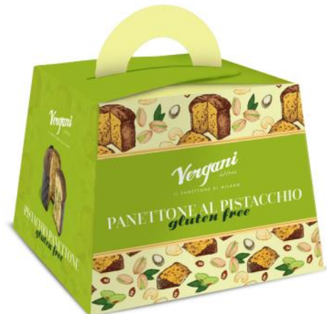
Gluten free Pistachio Panettone with pistachio cream 600g x 6 VER5576