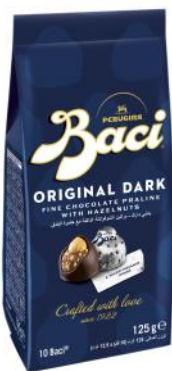
Baci Bag 10 pieces 125g x 12 Bag CODE P12440824