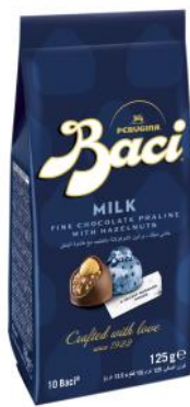
Milk Baci Bag 10 pieces 125g x 12 Bag CODE P12439571