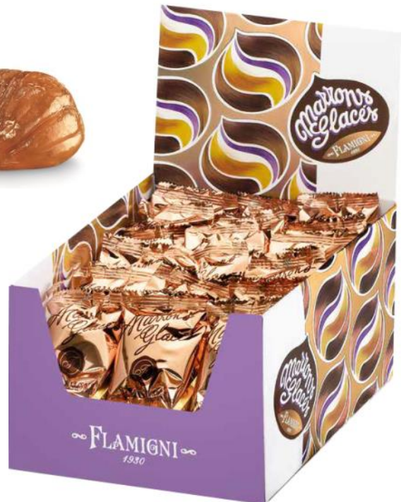
Marrons Glacés Display whole (20g) chestnuts individually wrapped by Flamigni (54pcs) x 1 CODE FLA1130