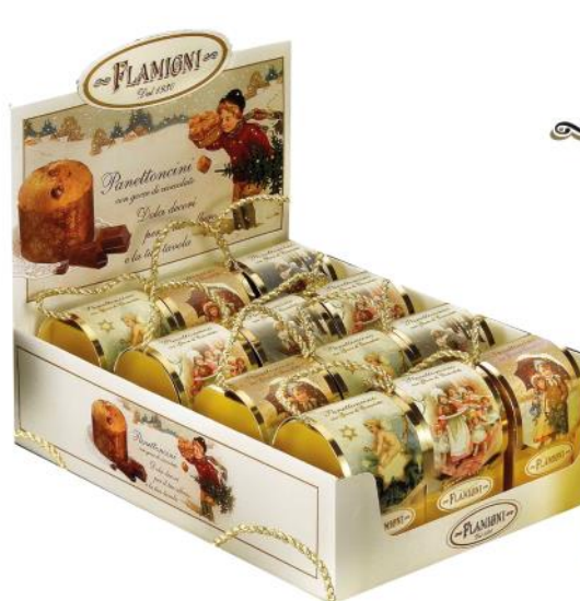
80g Chocolate Panettone in display with chocolate drops 80g x 36 FLA3601