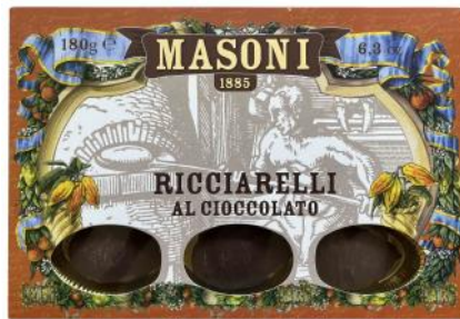
Masoni - Chocolate Ricciarelli 180g x 16 MAS210