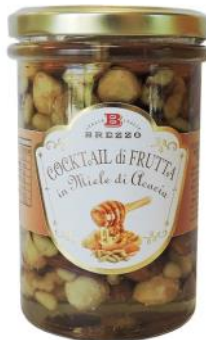
Nuts in Acacia Honey by Brezzo 350g x 6 CODE BRE40.5