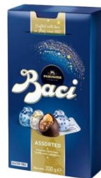
Assorted Baci Bijou box 14 pcs dark, milk and white chocolate 175g x 10 boxes CODE 12439601