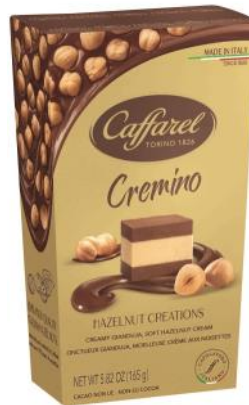
Cremino Box Milk gianduaia chocolate with soft hazelnut cream 150g x 8 CODE CAF80353