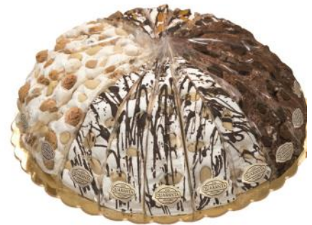
Assorted Chocolate Cream Nougat Cake 3.3kg - 20 individually wrapped slices CODE QUA403879