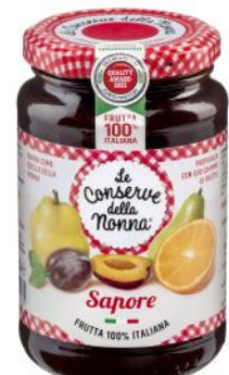
Mixed Fruit/Sapora can be used as chutney for cheese & meats 420g x 6 CODE NON23