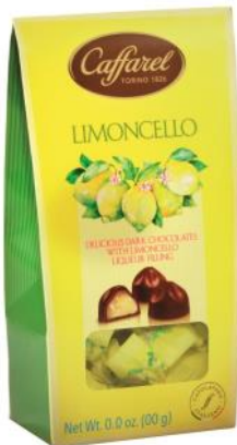
Limoncello ballotin Dark chocolate with liqueur filling 120g x 12 CODE CAF79977