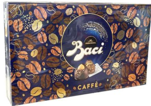
Coffee Baci gift box Coated in dark chocolate 150g x 6 boxes CODE 12555482