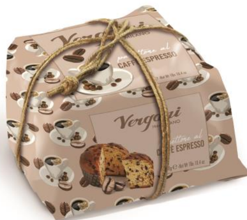
Gourmet range - Coffee & Chocolate Panettone with Vergnano coffee and chocolate drops 750g x 6 VER9857