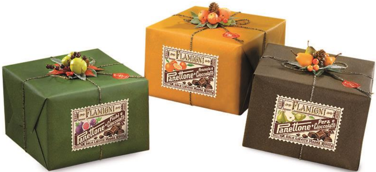
Chocolate Rustic Panettone Assortment in Box Dark Chocolate & Figs, Chocolate & Pear, Chocolate & Orange 1kg x 9 (3 panettone of each kind) CODE FLA3745