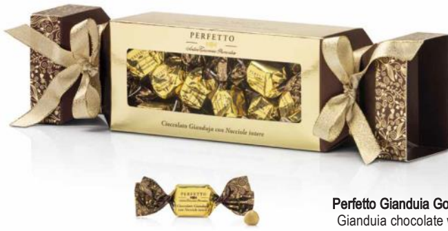
Perfetto Gianduia Golden Twist Box Gianduia chocolate with hazelnuts 280g x 4 CODE T1604402800