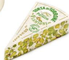
Premium Pistachio Nougat Cake by Flamigni with 60% pistachios 150g 12 individually wrapped slices CODE FLA78