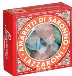
Amaretti Window box 65g x 18 L01157