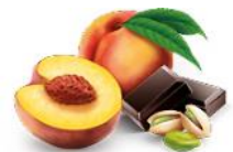
Printemps Panettone with dark chocolate drops, peach and Sicilian pistachio 750g x 6 CODE VIN2298