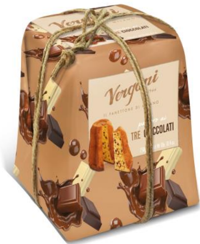
Gourmet range - Three Chocolates Pandoro with dark, milk and white chocolate drops, 750g x 6 VER8119