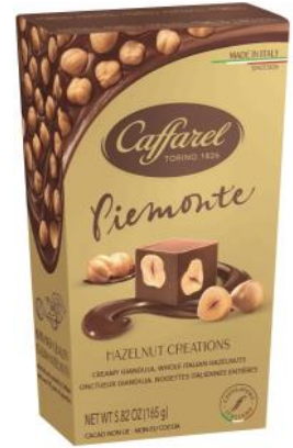
Piemonte Box Milk chocolate cubes with whole hazelnuts 150g x 8 CODE CAF80352