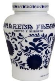
Amarena Fabbri wild cherries in syrup 230g x 6 CODE FAB03