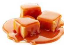
Gourmet range - Salted Caramel Panettone with pieces of soft caramel and white chocolate 750g x 6 VER3404