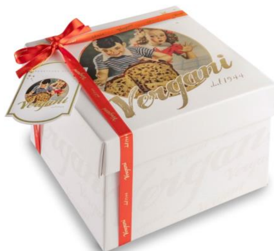
Etoile box Gourmet Milanese Panettone with premium quality Ingredients: raisins, candied Sicilian orange peel, Madagascar Bourbon vanilla pods, acacia honey from Tuscany 1kg x 6 VER3206