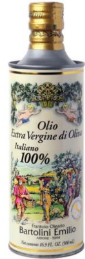
Gli Angeli tin medium fruity EVOO from Umbria by Bartolini 500ml x 6 CODE BAR008