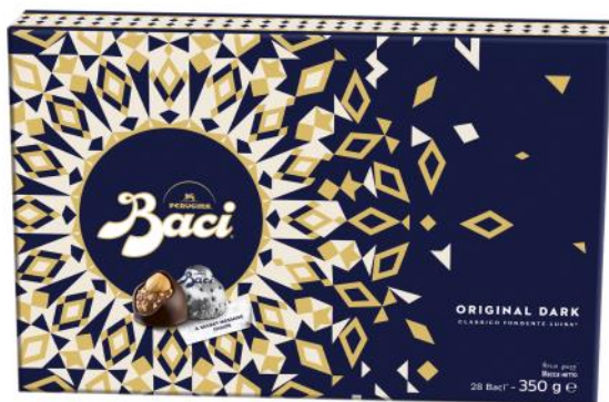
Baci 28 pcs gift box 350g x 6 CODE 12439754