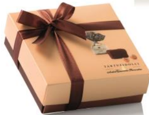
Truffle in gift box Beige - Dark chocolate & hazelnuts 125g x 6 CODE T1604601252 Green - White chocolate & pistachio 125g x 6 CODE T1616501250