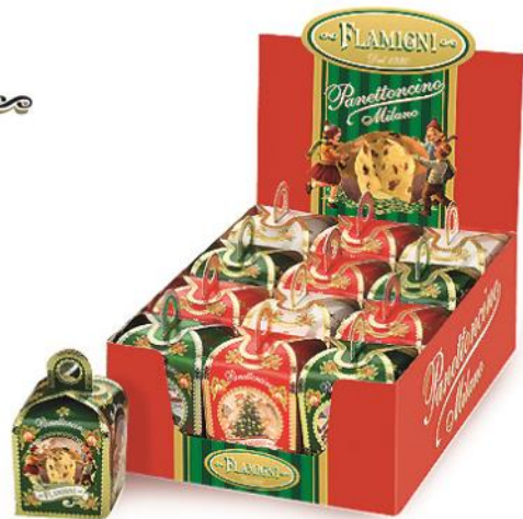
80g Traditional Panettone in display with raisins, candied orange and lemon peel 80g x 36 FLA3900