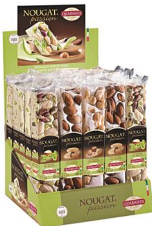
Traditional Soft Nougat pistachio, almond, hazelnut CODE QUA403984