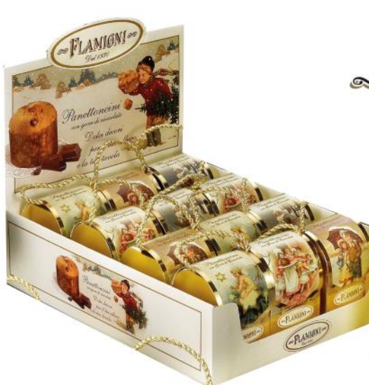
80g Chocolate Panettone in display with chocolate drops 80g x 36 FLA3601