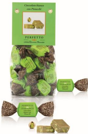
Perfetto Pistachio Bag white chocolate with pistachio 150g x 8 CODE T0612701520