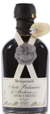
Organic Invecchiato "Riserva" 10* Balsamic Vinegar of Modena by Mengazzoli 250ml x 3 CODE MEG4309