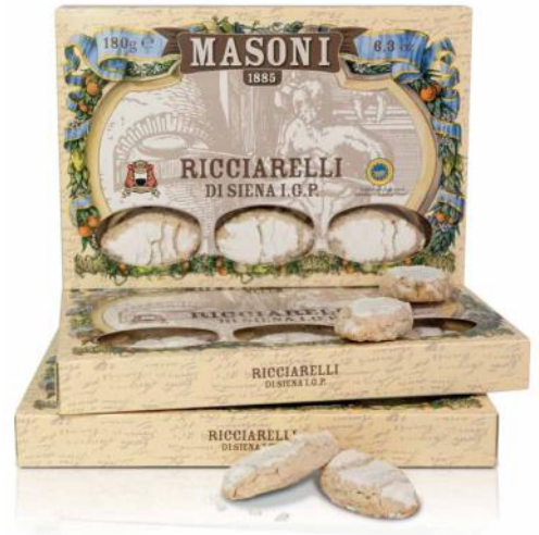
Masoni - Ricciarelli Gift Box IGP Siena by Masoni 180g x 18 MAS204