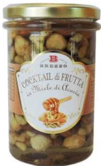
Nuts in Acacia Honey by Brezzo 350g x 6 CODE BRE40.5