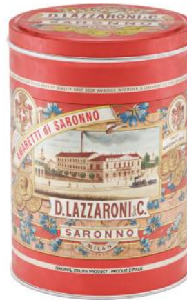
Amaretti Old Time tin 250g x 6 L15060