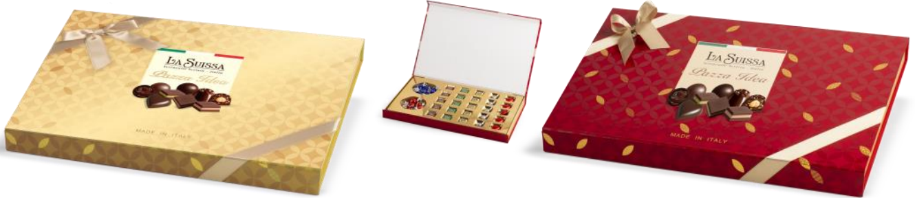
Assorted Gift Box - Pazza Idea Milk, dark and giandua chocolates filled with assorted cream 430g x 4 CODE SUI28814