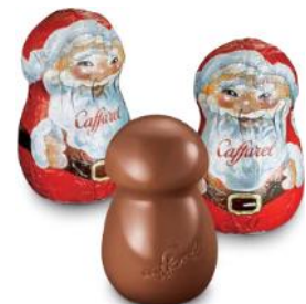
Santa Claus Bulk milk chocolate with gianduaia creamy filling (over 100pcs) 1kg x 1 CODE CAF37512