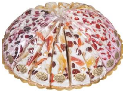
Assorted Fruit Nougat Cake Flavours: Fruit, Berries, Strawberry, Lemon Cake 3.3kg - 20 individually wrapped slices CODE QUA403878