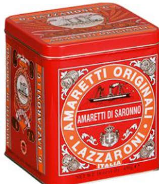
Amaretti tin 450g x 4 L01024