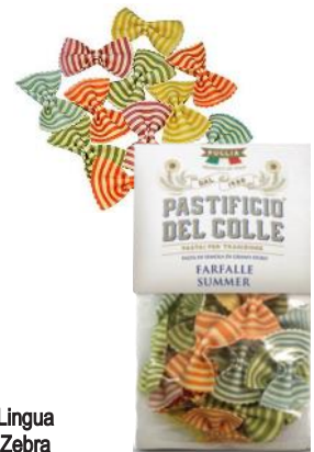
Farfalle Summer handmade 250g x 12 CODE PAS02