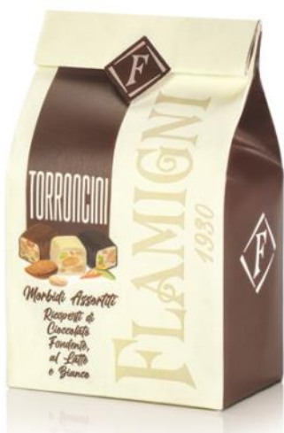
Flamigni Nougat in bags Covered in chocolate assorted soft nougat in 5 flavours: orange, lemon, vanilla, milk chocolate and dark chocolate 180g x 12 CODE FLA178