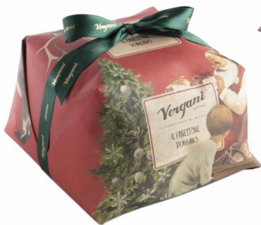
Santa range - Traditional Milanese Panettone with raisins, candied orange and lemon peel 1kg x 6 VER1401