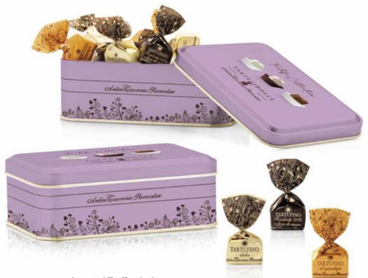
Assorted Truffles in tin 140g x 8 CODE T1705501410