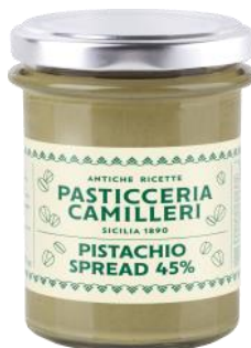
Camilleri Pistachio Cream 45% Pistachio 200g x 10 CODE VIN202