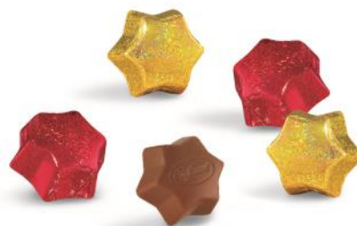
Stars Bulk milk chocolate over 200 pcs 1kg x 1 CODE CAF40508