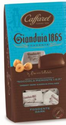
Dark Gianduaia window ballotin chocolate with hazelnut paste 150g x 12 CODE CAF79860