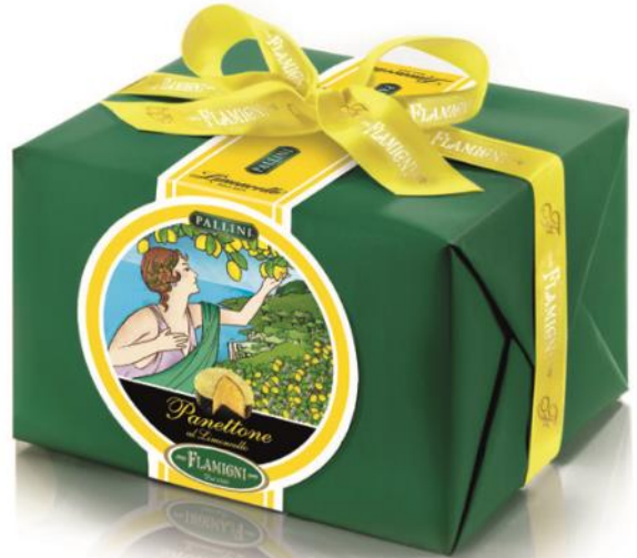
Limoncello Panettone with Limoncello cream and candied citron, coated with white chocolate and lemon flavoured grains 950g x 9 FLA3991