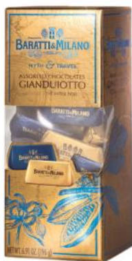
Gold Window Box Milk & Dark Gianduiotti 196g x 10 CODE BM4342