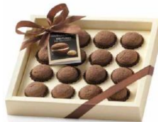
Baci di Dama in box dark biscuits with white chocolate cream 150g x 10 T1612901810