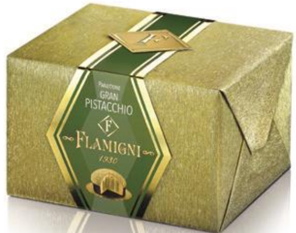
Gran Pistachio Panettone with Pistachio cream coated with white chocolate & pistachio grains 950g x 9 FLA3682