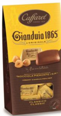
Gianduaia window ballotin milk chocolate with hazelnut paste 150g x 12 CODE CAF79859