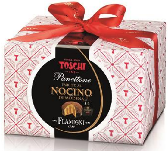
Nocino Toschi Panettone with Toschi Modena nut liqueur cream, coated with dark chocolate and crushed nuts 950g x 6 FLA3993