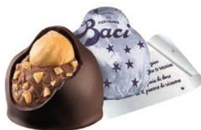
Baci Bulk 3kg x 1 CODE 12439386