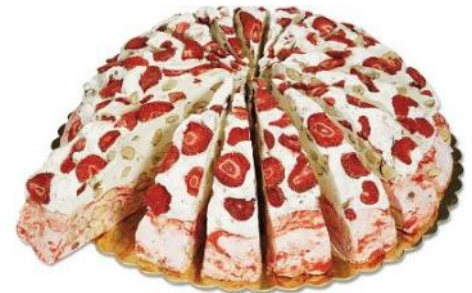
Strawberry & Cream Nougat Cake 3.3kg - 20 individually wrapped slices CODE QUA403885