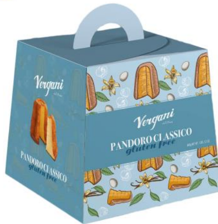
Gluten free Pandoro light plain cake, no raisins or candied fruit peel 600g x 6 VER9833