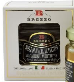
Truffle Honey by Brezzo 120ml x 6 CODE TRU05