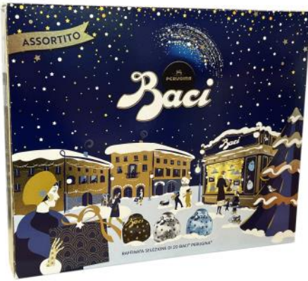
Christmas Assorted Baci gift box Coated in extra dark, milk and dark chocolate 250g x 10 boxes CODE 12488344