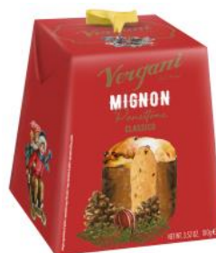
100g Traditional Panettone with raisins, candied orange and lemon peel 100g x 12 VER8454