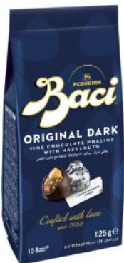
Baci Bag 10 pieces 125g x 12 Bag CODE 12440824