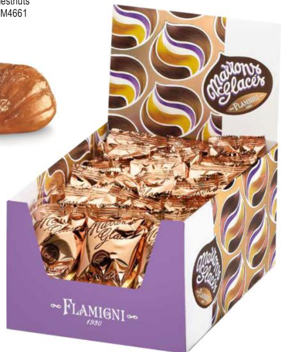
Marrons Glacés Display whole (20g) chestnuts individually wrapped by Flamigni (54pcs) x 1 CODE FLA1130