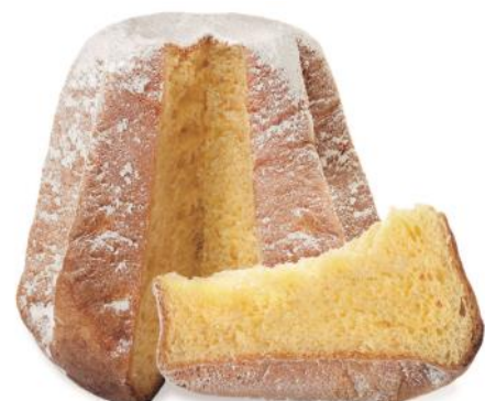
Oro - Pandoro Box Traditional 1kg x 6 CODE FLA3307