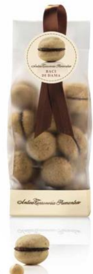
Baci di Dama with dark chocolate cream 200g x 8 T0612902020