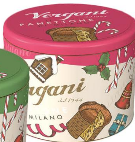
Tin - Black Cherry Panettone with candied black cherry 750g x 6 VER9567