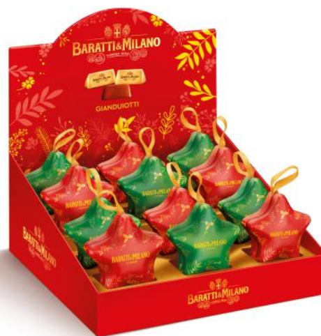
Christmas Star Display Tin balls with giandua chocolates 38g x 12 Ball size: 10cm in diameter CODE BM4789