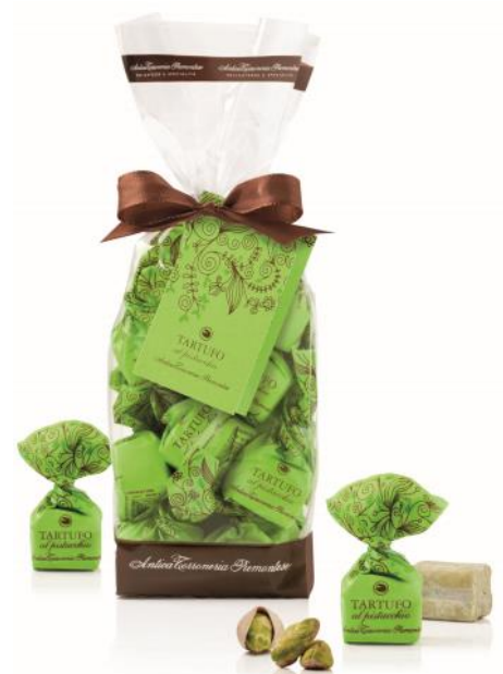
Pistachio Truffle Bag truffles with white chocolate 200g x 12 CODE T0616502000