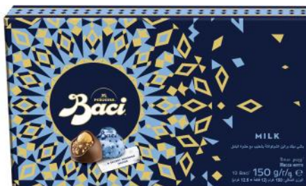
Milk Baci 12 pcs gift box 150g x 6 boxes CODE 12439542