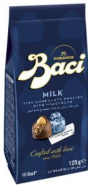
Milk Baci Bag 10 pieces 125g x 12 Bag CODE 12439571