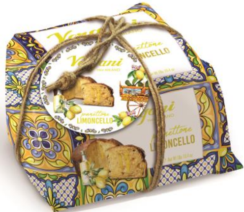
Sicily range - Limoncello Panettone filled with limoncello cream 750g x 6 VER9918