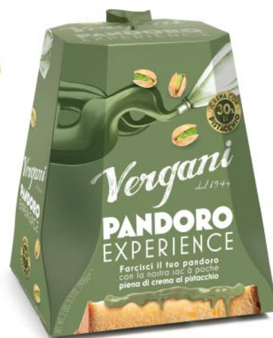
Pistachio Pandoro Box light plain cake with 30% pistachio cream sac a poche 850g x 6 VER8089