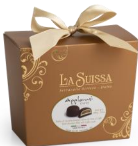
Coffee chocolate Box Dark chocolates filled with coffee cream 200g x 8 CODE SUI28884