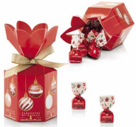
Christmas Flower Box Truffles 180g x 6 CODE T1611001840