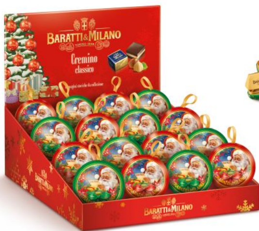
Christmas Ball Display Tin balls with cremino chocolates 42g x 16 Ball size: 10cm in diameter CODE BM4787