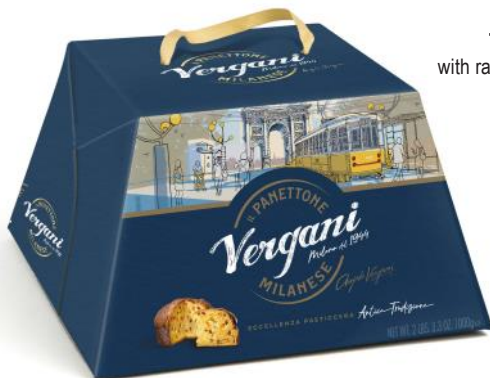
Traditional Milanese Panettone with raisins, candied orange and lemon peel 750g x 6 VER0021