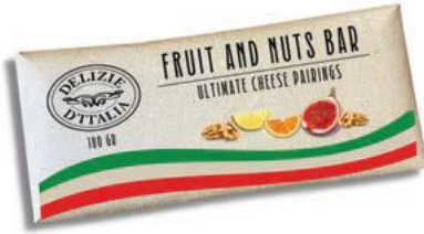
Barretta / Fruit & Nuts Bar condiment for cheese 180g x 12 CODE SAV180DEBR