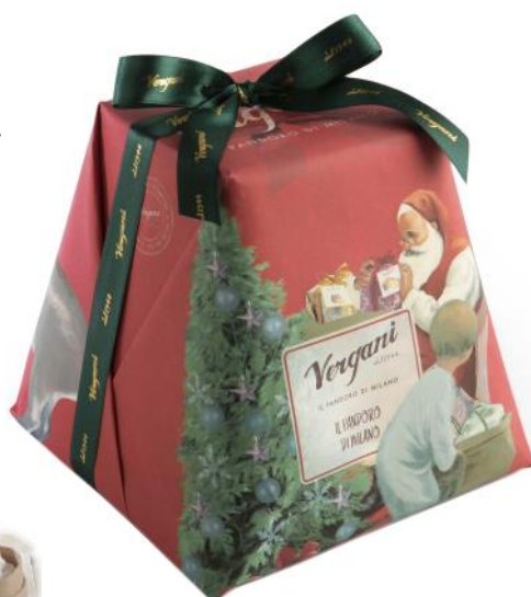
Santa range - Traditional Pandoro light plain cake, no raisins or candied fruit peel, dusted with icing sugar 1kg x 6 VER4685