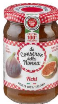
Fig 340g x 6 CODE NON624