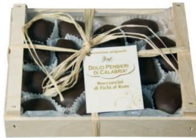
Figs in Rum covered in Dark Chocolate Box Figs soaked in rum covered in dark chocolate 200g x 12 CODE RAO200P8