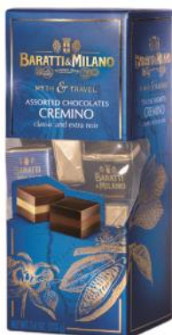
Blue Window Box Milk & Dark Cremino 210g x 10 CODE BM4478