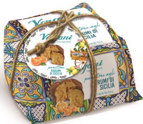
Sicily range - Agrumi Panettone with citrus fruit: candied orange and lemon peel 750g x 6 VER9901