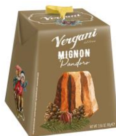
80g Pandoro light plain cake, no raisins or candid fruit peel 80g x 12 VER8485