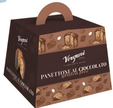
Gluten free Chocolate Panettone with chocolate drops! 600g x 6 VER9215