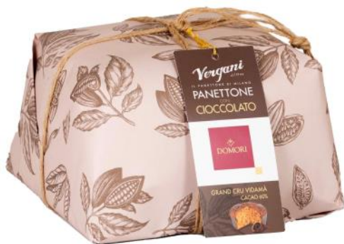
Gourmet range - Domori Chocolate Panettone Grand Cru Vidama with 60% cocoa dark chocolate drops 750g x 6 VER8096