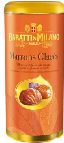
Marrons Glacés Tin whole chestnuts by Baratti & Milano 180g x 6 CODE BM4664