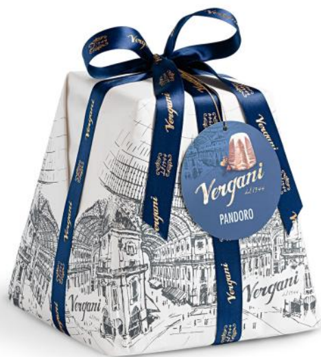
Galleria range - Pandoro light cake without candied fruit or raisins, dusted with icing sugar 750g x 6 VER0724