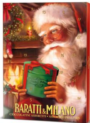
Advent Calendar Assorted Chocolates: cremino, gianduiotto, filled chocolates 248g x 6 CODE BM4788