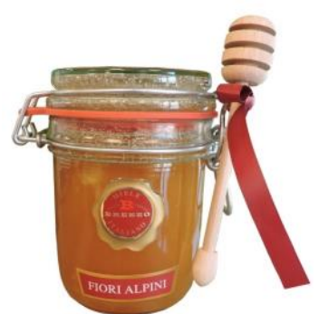
Wildflower Honey from the Alps by Brezzo 400g x 6 CODE BRE39.06