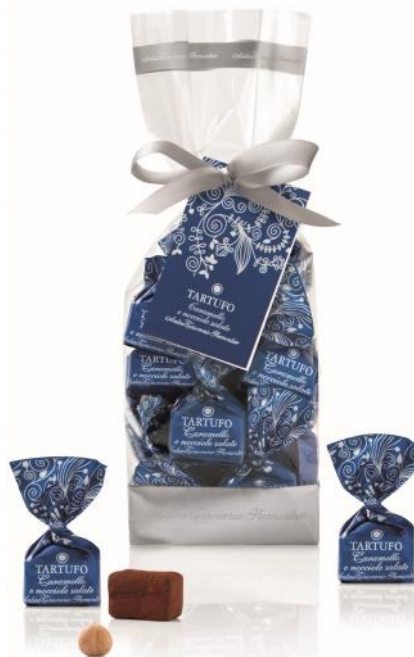
Caramelised Truffle Bag with salted hazelnuts & dark chocolate 200g x 12 CODE T0607002000