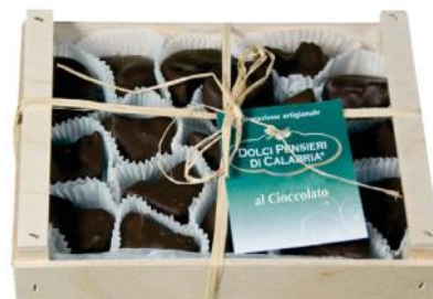
Figs in Chocolate Box Stuffed with walnuts Figs covered in dark chocolate 200g x 12 CODE RAO200B4