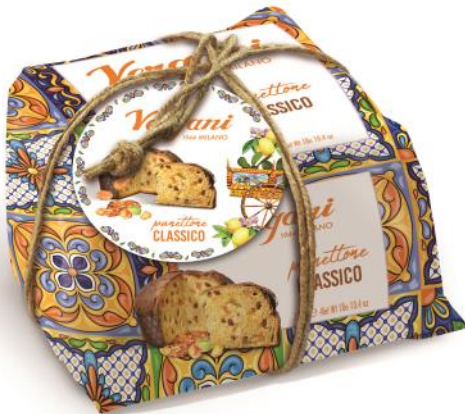
Sicily range - Traditional Milanese Panettone with raisins, candied orange and lemon peel 750g x 6 VER9888

The only traditional Italian cakes made in Milan by Vergani family using selected finest ingredients and traditional methods of baking. The cakes are perfectly balanced in flavour and texture with soft and moist dough and delicious taste.