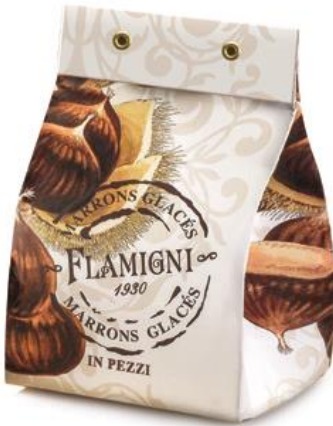
Marrons Glacés bag chestnuts in pieces by Flamigni 300g x 12 CODE FLA1134