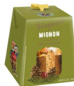
100g Chocolate & Pear Panettone with chocolate drops 100g x 12 VER8461