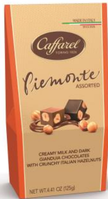
Piemonte Assorted window ballotin Milk and dark chocolate cubes with whole hazelnuts 125g x 12 CODE CAF80291