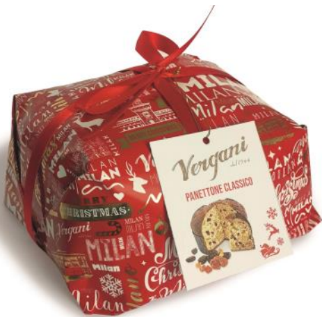
Merry Christmas range - Traditional Milanese Panettone with raisins, candied orange and lemon peel 1kg x 6 VER8812 750g x 6 VER8805 500g x 6 VER8799