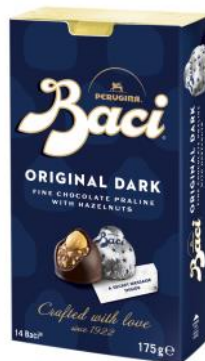
Baci Bijou box 14 pcs 175g x 10 boxes CODE 12439537