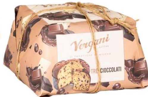
Gourmet range - Three Chocolates Panettone with dark, milk and white chocolate drops, 750g x 6 VER4708