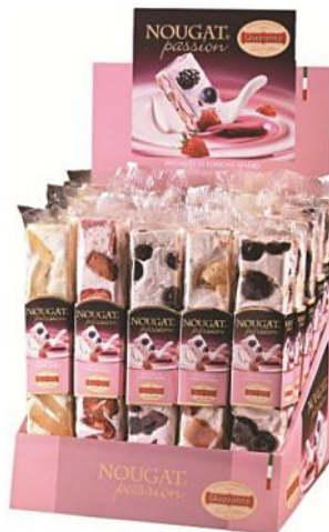
Summer Fruit Selection cherry, exotic fruit, berries, strawberry, lemon CODE QUA403982