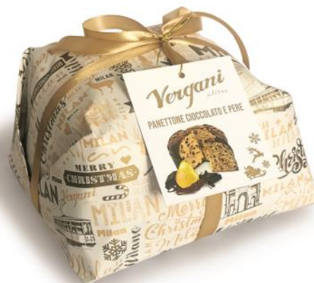
Merry Christmas range - Chocolate & Pear Panettone with chocolate drops, and candied pear 1kg x 6 VER8881