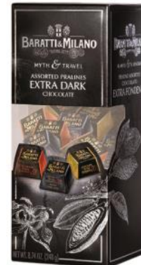
Black Window Box Assorted Dark Chocolates 248g x 10 CODE BM4472