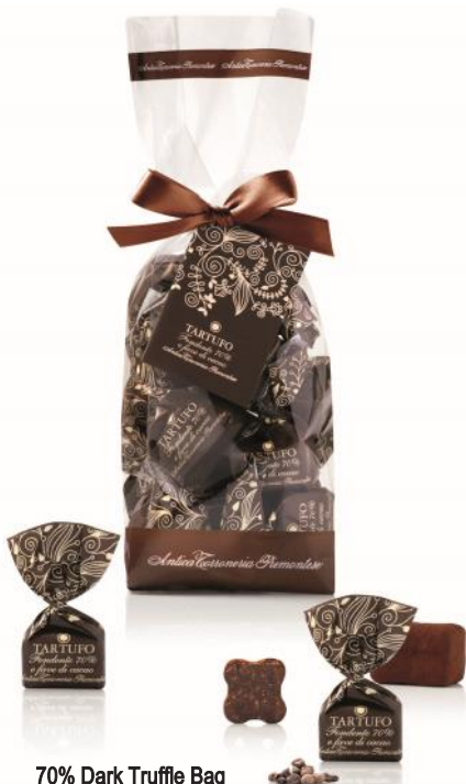
70% Dark Truffle Bag 200g x 12 CODE T0609102000