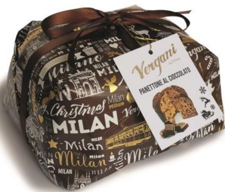
Merry Christmas range - Chocolate Panettone with chocolate drops, sprinkled with chocolate drops 1kg x 6 VER8867