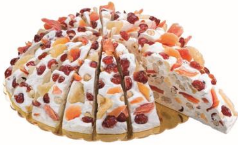
Exotic Fruit Nougat Cake 3.3kg - 20 individually wrapped slices CODE QUA403884