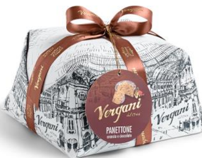
Galleria range - Chocolate Panettone with chocolate drops, sprinkled with chocolate drops 500g x 6 VER2537