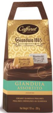
Mixed Milk & Dark Gianduaia bag chocolate with hazelnut paste 200g x 16 CODE CAF73357