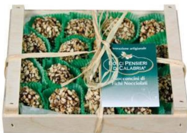
Figs in Chocolate & Hazelnuts Box Figs covered in dark chocolate and crushed hazelnuts 200g x 12 CODE RAO200B11