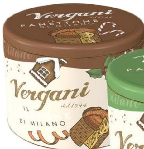
Tin - Chocolate Panettone with chocolate drops 750g x 6 VER9550