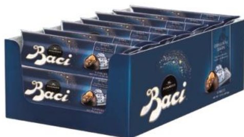
Dark Baci 3 pieces tube display 37.5g x 14 in display CODE 12439533