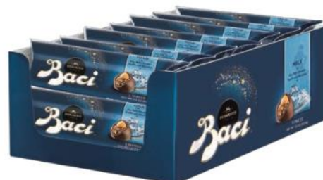
Milk Baci 3 pieces tube display 37.5g x 14 in display CODE 12439595