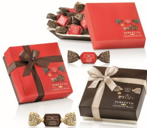
Perfetto Red or Brown Box Red box - milk chocolate with hazelnuts CODE T1616801251 Brown box - Extra dark chocolate with hazelnuts CODE T1602601251 125g x 6