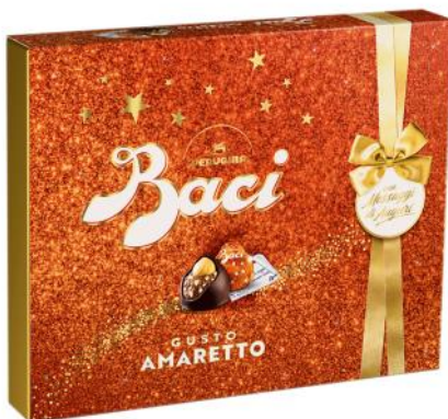
Amaretto Baci gift box Coated in dark chocolate 200g x 10 boxes CODE 12552125