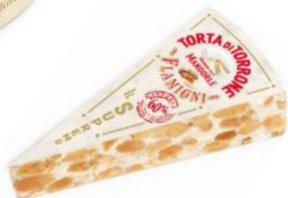
Premium Almond Nougat Cake by Flamigni with 60% almonds 150g x 12 individually wrapped slices CODE FLA77