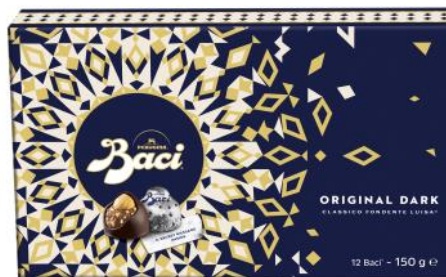
Baci 12 pcs gift box 150g x 6 boxes CODE 12439387