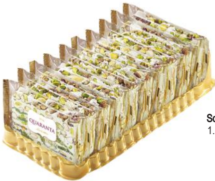
Square Pistachio Cream Nougat Cake 1.8kg - 12 individually wrapped slices CODE QUA404054