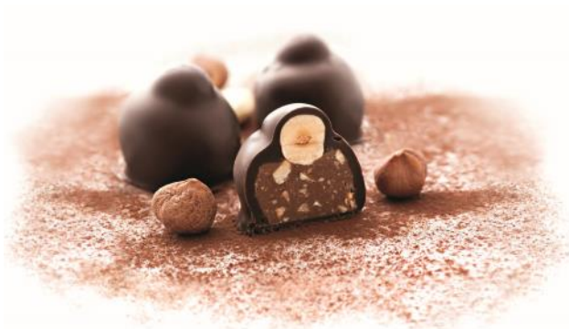
Dark chocolate with a whole hazelnut , filled with milk chocolate and pieces of hazelnut. Each piece wrapped in foil contains a messages of love and friendship.