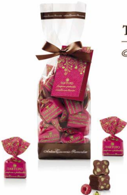
Raspberry & Pistachio Truffle Bag 200g x 12 CODE T0607902000