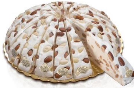
Almond Nougat Cake 2.2kg - 20 slices, each slice 1.10g CODE QUA404037