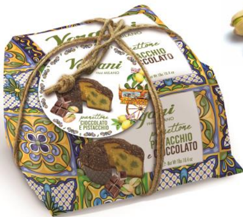
Sicily range - Pistachio Panettone filled with pistachio cream, covered in dark chocolate and sprinkled with crushed pistachio nuts 750g x 6 VER9925