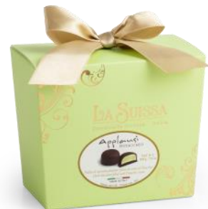
Pistachio chocolate Box Dark chocolates filled with pistachio cream 200g x 8 CODE SUI28883