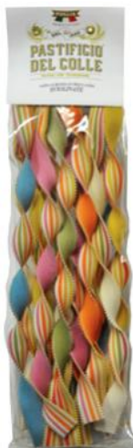
Sviolate handmade 250g x 12 CODE PAS06