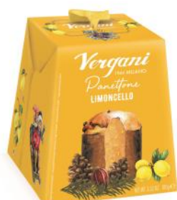
80g Limoncello Panettone With limoncello cream 80g x 12 VER9871