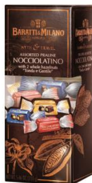
Brown Window Box Assorted pralines 210g x 10 CODE BM4474