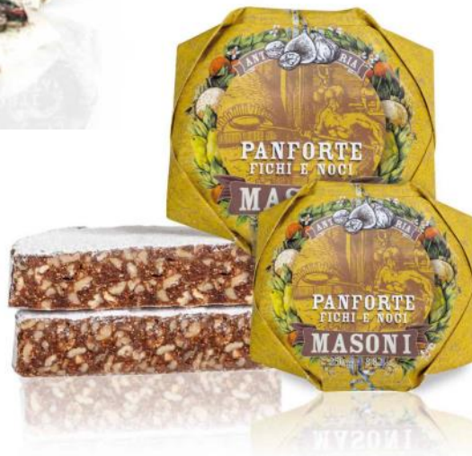
Figs & Walnuts Panforte by Masoni 350g x 12 MAS843 100g x 12 MAS845