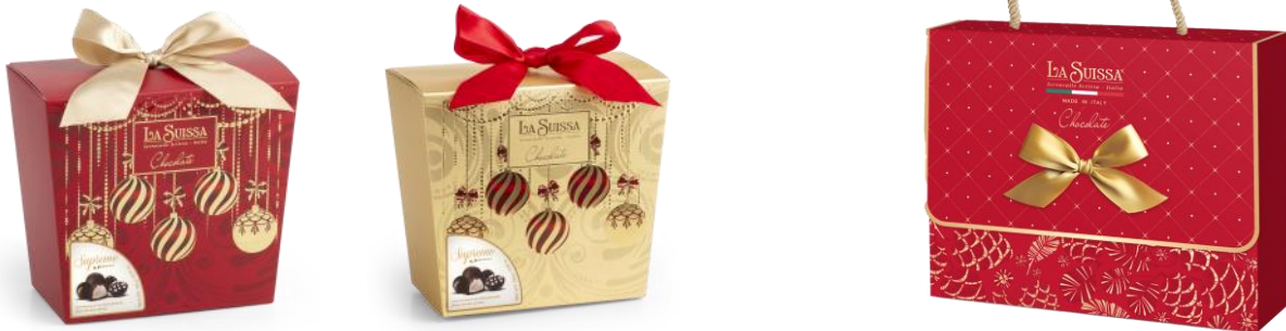
Supreme di Natale Box Assorted milk and dark chocolates filled with cream 400g x 5 CODE SUI27771