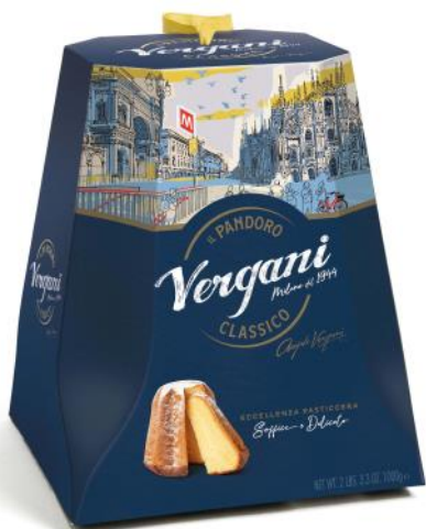
Traditional Pandoro Box light plain cake, no raisins or candid fruit peel, dusted with icing sugar 750g x 6 VER8263