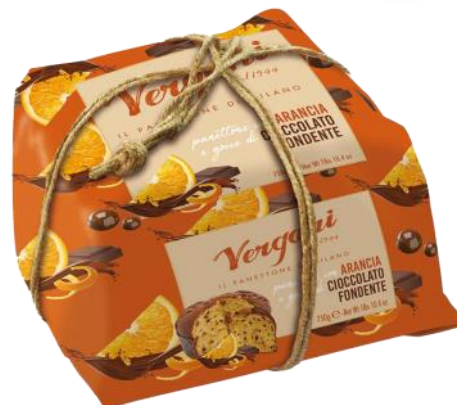
Gourmet range - Chocolate & Orange Panettone with chocolate drops, and candied orange peel 750g x 6 VER9178

Cocoa comes from an area in Ivory Coast, where the exchange of pollen with wild plants of orange, mango, wild coffee and cardamom near the cultivated cocoa plantation gives a particular fragrance to the dark chocolate Grand Cru Vidama.