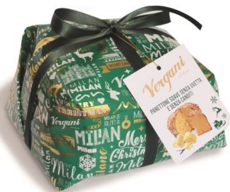
Merry Christmas range - Soave Panettone (no fruit or raisins) almond glazed 900g x 6 VER8942