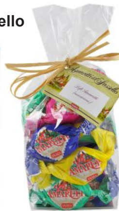
Traditional Amaretti almond flavour 215g x 10 CODE ISA04