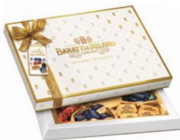
Blue & White Gift Box Assorted Chocolates: cremino, gianduiotto, 70% extra dark chocolate, dark & milk nocciolotto 300g x 6 (3+3) CODE BM4408