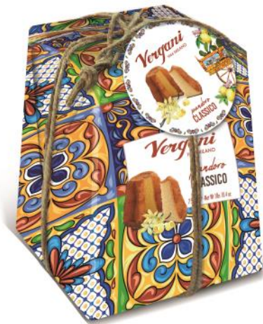
Sicily range - Pandoro light cake without candied fruit or raisins, dusted with icing sugar 750g x 6 VER9895