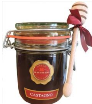
Chestnut Honey by Brezzo 400g x 6 CODE BRE39.12