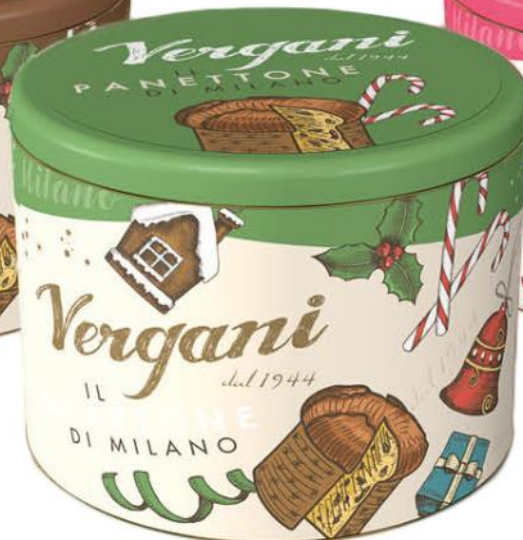
Tin - Traditional Panettone with raisins, candied orange and lemon peel 750g x 6 VER9543