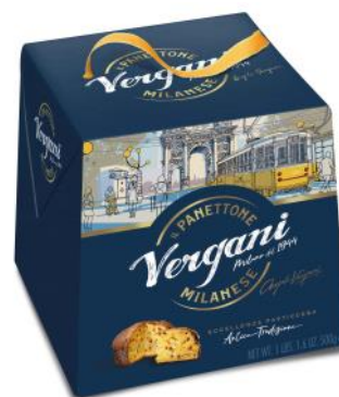
Traditional Panettone with raisins, candied orange and lemon peel 500g x 20 VER0076