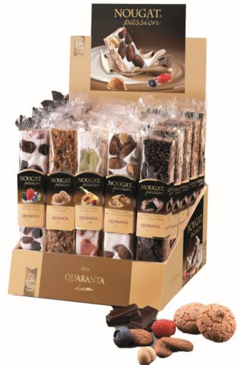
Assorted Soft Nougat Chocolate, Fruit & Nut CODE QUA403980