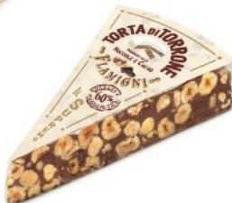
Premium Chocolate Nougat Cake by Flamigni with chocolate and hazelnuts 150g x 12 individually wrapped slices CODE FLA79