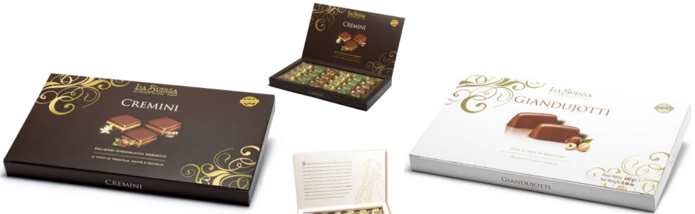
Cremini Gift Box Cremini milk chocolates with a soft layer of coffee, hazelnut or vanilla cream. 280g x 6 CODE SUI24465