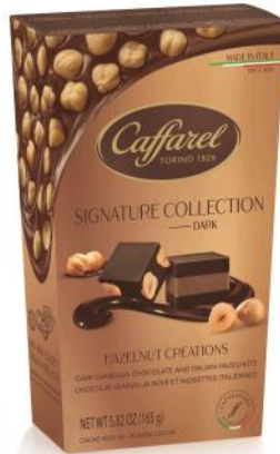
Signature Collection Dark chocolate cremino and piemonte 150g x 8 CODE CAF80545