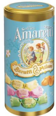
Soft Amaretti in cylinder tin Baratti & Milano 145g x 6 CODE BM4604