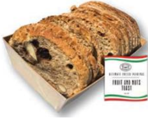
Toast with almonds, peanuts, figs and spices for cheese 120g x 16 CODE SAV120TS