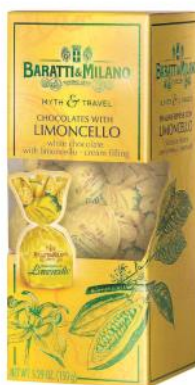
Yellow Window Box Chocolates with Limoncello 210g x 10 CODE BM4471