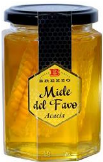
Acacia Honeycomb by Brezzo 250g x 6 CODE BREFA03