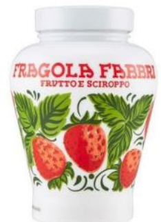
Fragola Fabbri strawberries in syrup 600g x 6 CODE FAB02