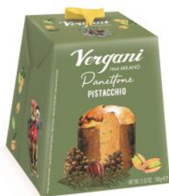
100g Pistachio Panettone with pistachio cream 80g x 12 VER9864