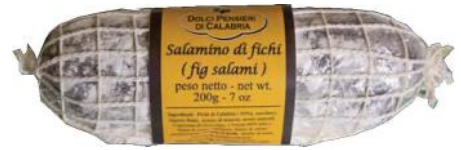
Fig Salame Figs, oranges, rum, dark chocolate 200g x 12 CODE RAO200S1