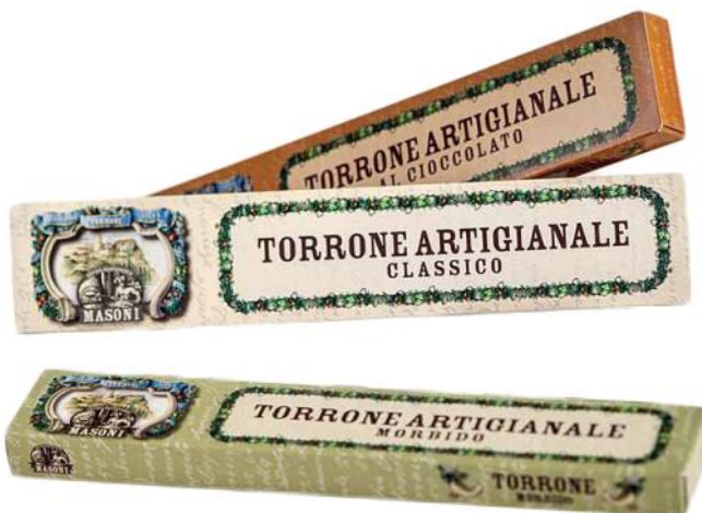
Masoni Almond Nougat HARD - traditional CODE MAS720 SOFT - chocolate coating CODE MAS724 SOFT - traditional CODE MAS722 200g x 12