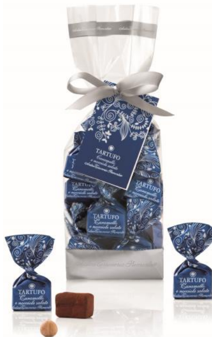
Caramelised Truffle Bag with salted hazelnuts & dark chocolate 200g x 12 CODE ATP4500