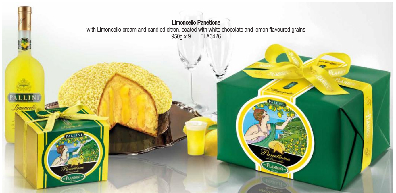
Limoncello Panettone with Limoncello cream and candied citron, coated with white chocolate and lemon flavoured grains 950g x 9 FLA3426