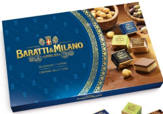
Blue Cremini Box 230g x 8 CODE BM4347