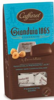
Dark Gianduia window ballotin chocolate with hazelnut paste 150g x 12 CODE CAF79860