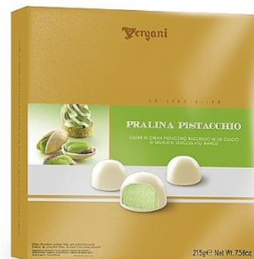
Pistachio Pralines White chocolate pralines filled with pistachio cream. 215g x 8 CODE VCH57241