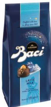
Milk Baci Bag 10 pieces 125g x 12 Bag CODE 12439571