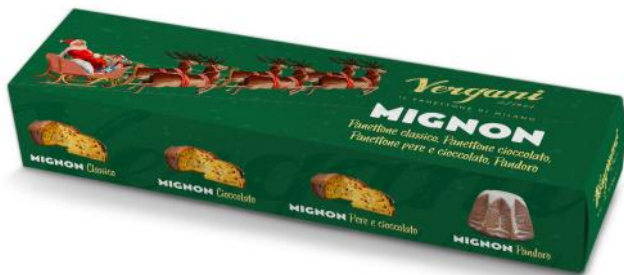
Panettone Assorted Box traditional, chocolate, chocolate/pear and pandoro 380g (4 kinds) x 6 VER5569