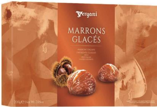
Marrons Glacés box whole (17g) chestnuts by Vergani 200g x 8 CODE VCH49015