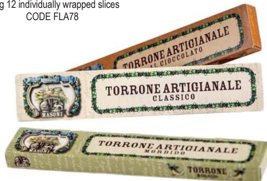
Masoni Almond Nougat HARD - traditional CODE MAS720 SOFT - chocolate coating CODE MAS724 SOFT - traditional CODE MAS722 200g x 12