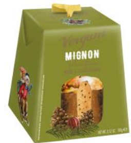
100g Chocolate & Pear Panettone with chocolate drops 100g x 12 VER8461