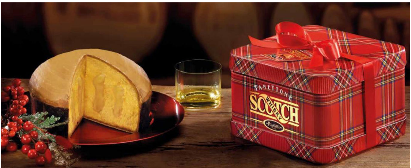
Alcohol Cream Selection Panettone with Whisky cream 950g, Rum cream 950g, Gin cream 1kg 4 x of each kind (12 pieces) FLA3980