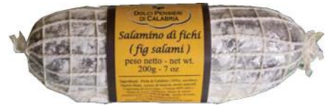
Fig Salame Figs, oranges, rum, dark chocolate 200g x 12 CODE RAO200S1