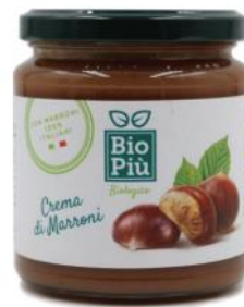
Organic Chestnut Spread 320g x 6 CODE ARC16