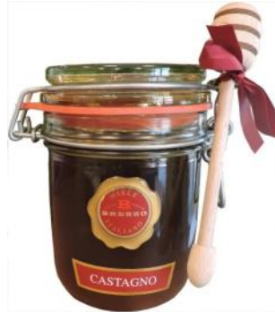
Chestnut Honey by Brezzo 400g x 6 CODE BRE39.12