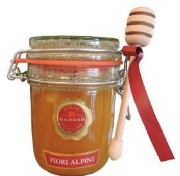
Wildflower Honey from the Alps by Brezzo 400g x 6 CODE BRE39.06