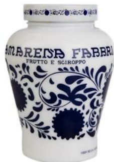
Amarena Fabbri wild cherries in syrup 600g x 6 CODE FAB01