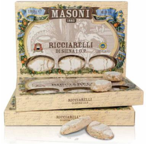
Masoni - Ricciarelli Gift Box IGP Siena by Masoni 180g x 18 MAS204