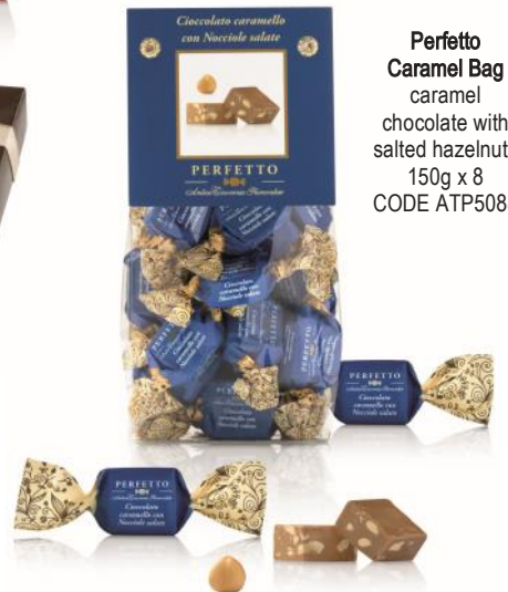
Perfetto Caramel Bag caramel chocolate with salted hazelnuts 150g x 8 CODE ATP5088