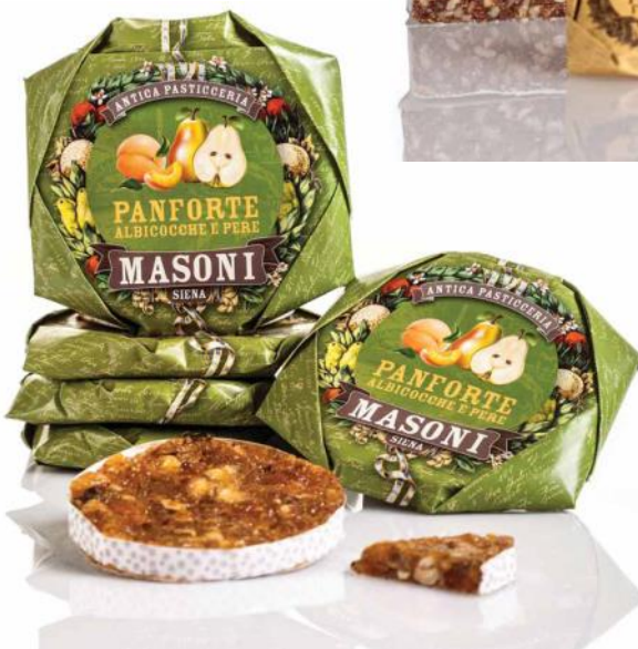
Apricot & Pear Panforte by Masoni 250g x 12 MAS864