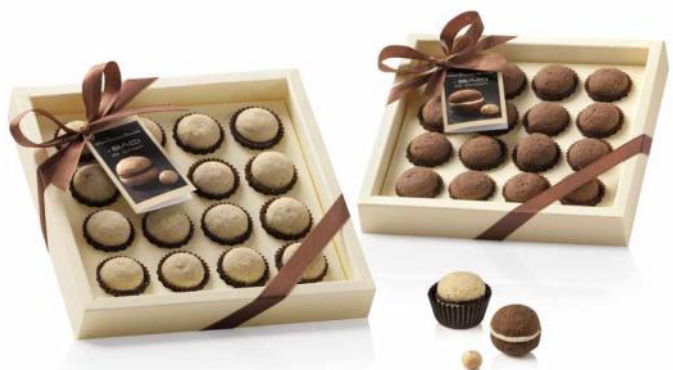
Baci di Dama in box 5 x white with dark chocolate cream 5 x dark with white chocolate cream 150g x 10 CODE ATP2599