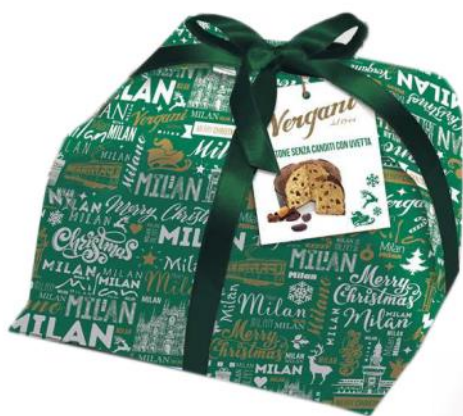
Raisin Panettone (no candied fruit) 1kg x 6 VER9130