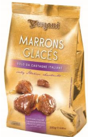
Marrons Glacés bag chestnuts in pieces by Vergani 200g x 20 CODE VCH49000