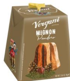
80g Pandoro light plain cake, no raisins or candid fruit peel 80g x 12 VER8485