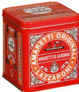
Amaretti tin 450g x 4 LAZT450