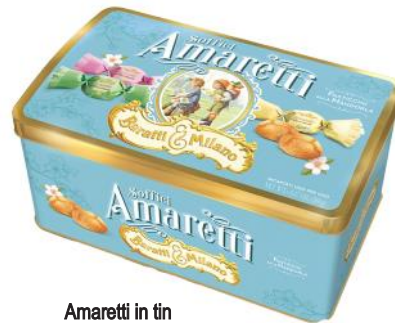
Amaretti in tin Baratti & Milano 260g x 6 CODE BM4605