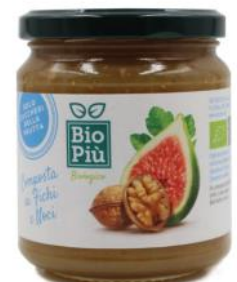
Organic Fig & Walnut Spread 320g x 6 CODE ARC17