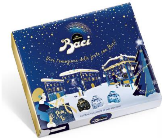
Christmas Assorted Baci gift box Coated in extra dark, milk and dark chocolate 250g x 10 boxes CODE 12488344