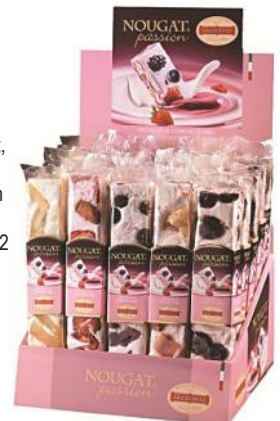
Summer Fruit Selection cherry, exotic fruit, berries, strawberry, lemon 100g x 25 pcs CODE QUA403982