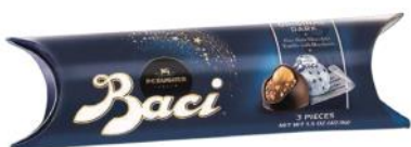
Dark Baci 3 pieces tube display 37.5g x 14 in display CODE 12439533