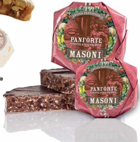
Chocolate & Cherry Panforte covered in chocolate by Masoni 250g x 12 MAS854