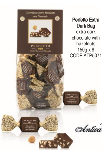
Perfetto Extra Dark Bag extra dark chocolate with hazelnuts 150g x 8 CODE ATP5071