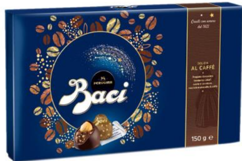
Coffee Baci gift box Coated in dark chocolate 150g x 6 boxes CODE 12555482