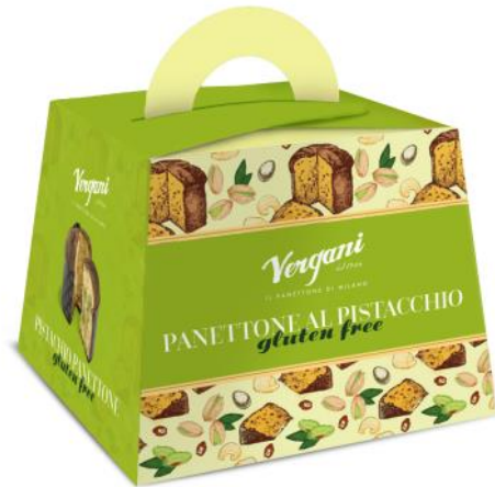
Gluten free Pistachio Panettone with raisins and candied orange peel 600g x 6 VER5576