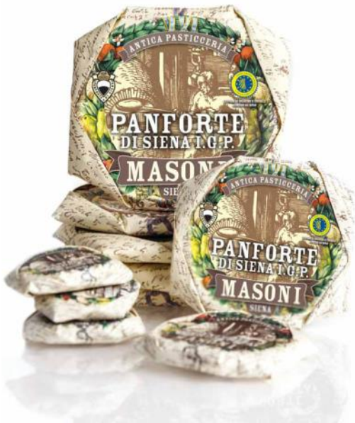
Masoni IGP Siena Panforte 450g x 12 MAS132 250g x 12 MAS134 100g x 12 MAS135