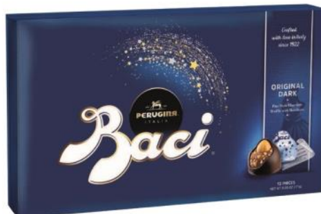
Baci 12 pcs gift box 150g x 6 boxes CODE 12439387