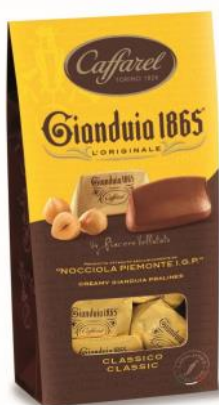
Gianduia window ballotin milk chocolate with hazelnut paste 150g x 12 CODE CAF79859