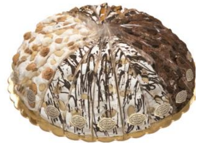
Assorted Chocolate Cream Nougat Cake 3.3kg - 20 individually wrapped slices each slice 165g CODE QUA403879