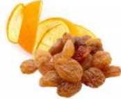
Traditional Panettone with candied orange peel & raisins 750g x 6 CODE VIN1499