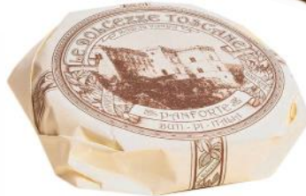
Marchi Vanda - Premium Panforte artisan soft panforte with honey 250g x 12 CODE MVPANF4