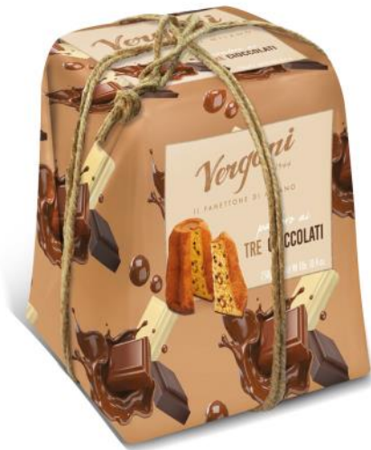
Three Chocolates Pandoro with dark, milk and white chocolate drops, 750g x 6 VER8119