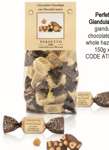
Perfetto Gianduia Bag gianduia chocolate with whole hazelnuts 150g x 8 CODE ATP5095