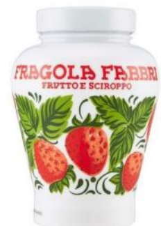
Fragola Fabbri strawberries in syrup 600g x 6 CODE FAB02