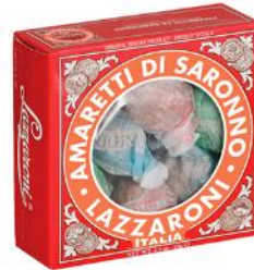
Amaretti Window box 65g x 18 LAZW65