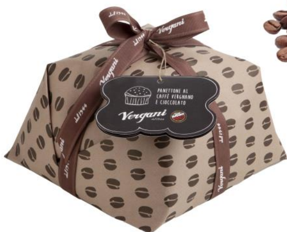
Coffee & Chocolate Panettone with Vergano coffee and chocolate drops 750g x 6 VER2193