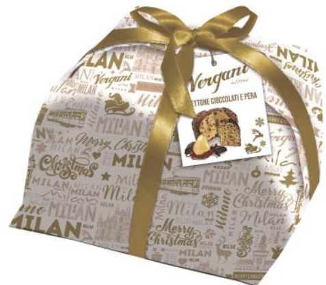
Chocolate & Pear Panettone with chocolate drops, and candied pear 1kg x 6 VER8881