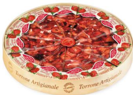
Premium Strawberry Nougat Cake by Flamigni with 60% strawberries and almonds 150g x 12 individually wrapped slices CODE FLA80