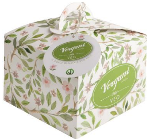
Vegan Christmas Cake with raisins and candied orange peel 750g x 6 VER1752