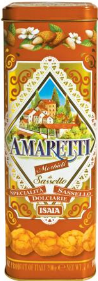
Traditional Amaretti in red tin almond flavour 200g x 6 CODE ISA0750