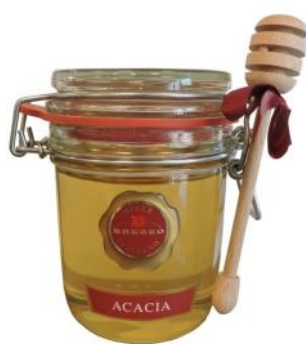
Acacia Honey by Brezzo 400g x 6 CODE BRE39.02