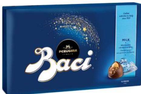
Milk Baci 12 pcs gift box 150g x 6 boxes CODE 12439542