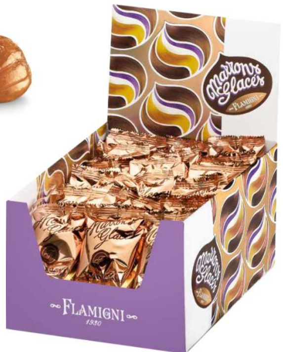
Marrons Glacés Display whole (20g) chestnuts individually wrapped by Flamigni (54pcs) x 1 CODE FLA1130