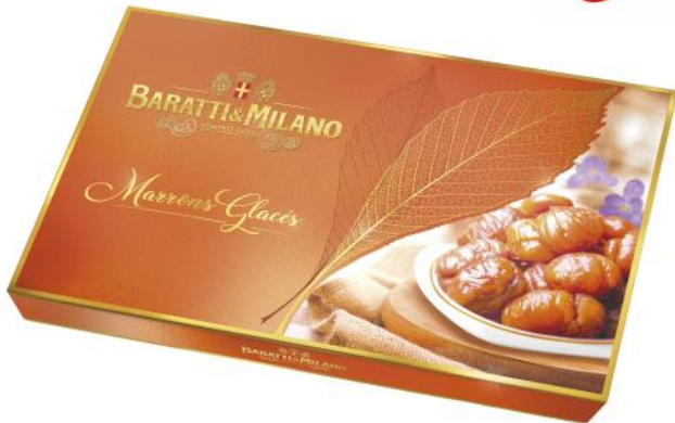
Marrons Glacés box Baratti & Milano whole large (22g) chestnuts 180g x 8 CODE BM4661