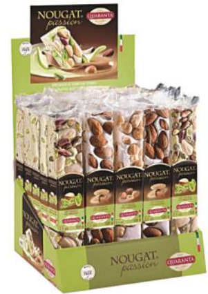
Traditional Soft Nougat pistachio, almond, hazelnut 100g x 25 pcs CODE QUA403984