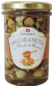
Nuts in Acacia Honey by Brezzo 350g x 6 CODE BRE40.5