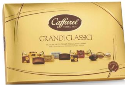
Great Selection Gianduiotti, piemonte & dark chocolates with creamy filling 250g x 6 CODE CAF80657