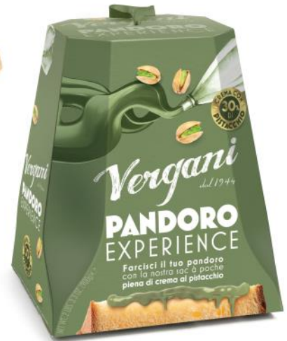
Pistachio Pandoro Box light plain cake with 30% pistachio cream sac a poche 850g x 6 VER8089