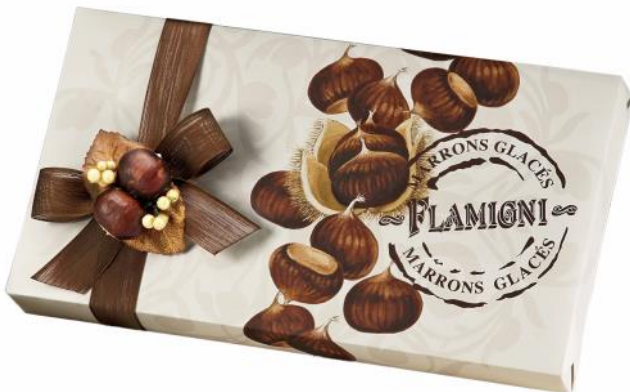
Marrons Glacés Gift box whole large (20g) chestnuts by Flamigni (12pcs) 240g x 6 CODE FLA1135