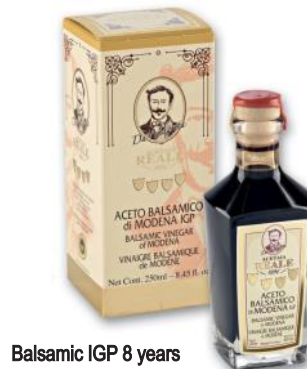
Balsamic IGP 8 years Balsamic Vinegar 250ml x 1 CODE LE115