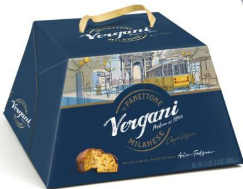
Traditional Milanese Panettone with raisins, candied orange and lemon peel 1kg x 6 VER0014 750g x 6 VER0021