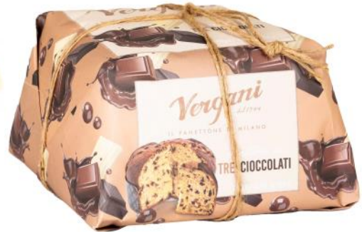
Three Chocolates Panettone with dark, milk and white chocolate drops, 750g x 8 VER4708