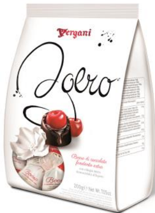
Boero Bag Cherry Liqueur dark chocolates 200g x 24 CODE VCH65050