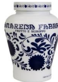
Amarena Fabbri wild cherries in syrup 230g x 6 CODE FAB03