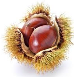
made solely from chestnuts grown in Italy