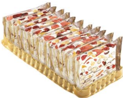
Square Fruit Cream Nougat Cake 1.8kg - 12 individually wrapped slices each slice 150g CODE QUA404051