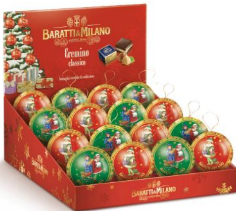
Christmas Ball Display Tin balls with cremino chocolates 42g x 16 Ball size: 10cm in diameter Display CODE BM4787