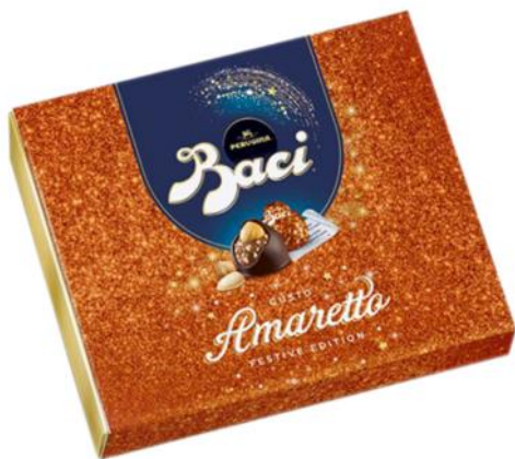
Amaretto Baci gift box Coated in dark chocolate 200g x 10 boxes CODE 12552125