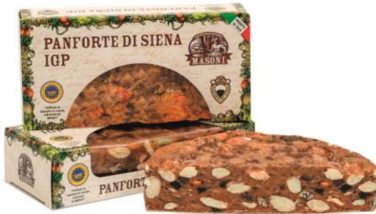
Masoni IGP Siena Panforte in window box 370g x 16 MAS117

Panforte is a heavenly mixture of spices, candied fruit, almonds and honey formed into a cake. This sumptuous dessert is sought out by connoisseurs. Serve in tiny slices with sweet dessert wine or coffee.