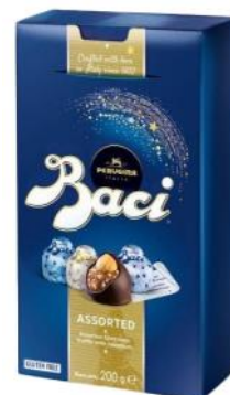
Assorted Baci Bijou box 14 pcs dark, milk and white chocolate 175g x 10 boxes CODE 12439601