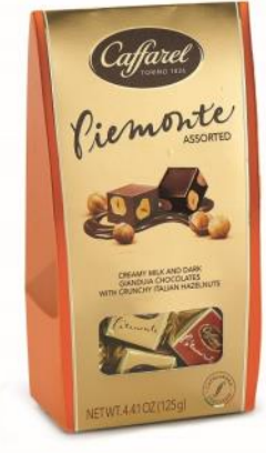
Piemonte Assorted window ballotin Milk and dark chocolate cubes with whole hazelnuts 125g x 12 CODE CAF80291