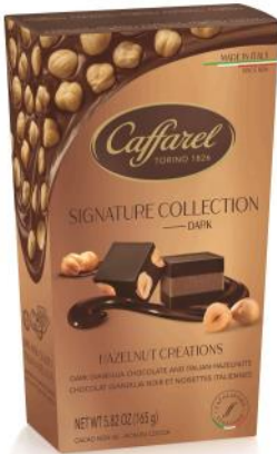
Signature Collection Dark chocolate cremino and piemonte 165g x 8 CODE CAF80545