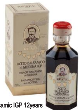
Balsamic IGP 12 years Balsamic Vinegar 250ml x 1 CODE LE125