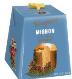
100g Panettone no candied fruit 100g x 12 VER8478