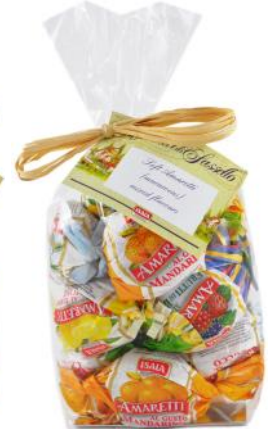
Fruit Amaretti tangerine, citron, lemon, coconut, wildberries 215g x 10 CODE ISA03