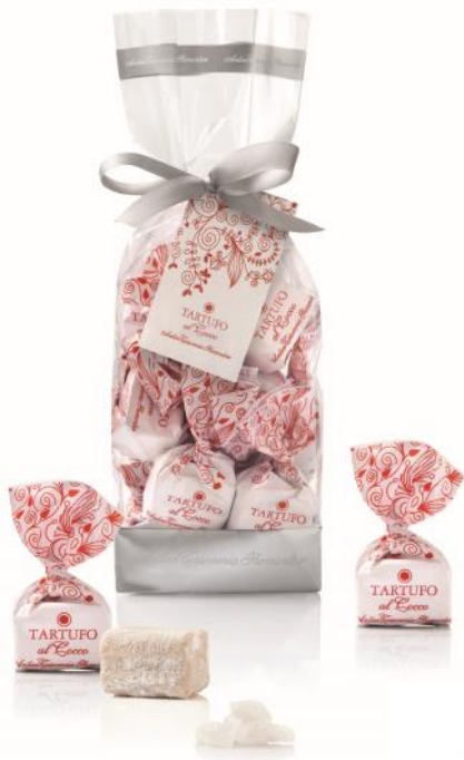
Coconut Truffle Bag 200g x 12 CODE ATP3787