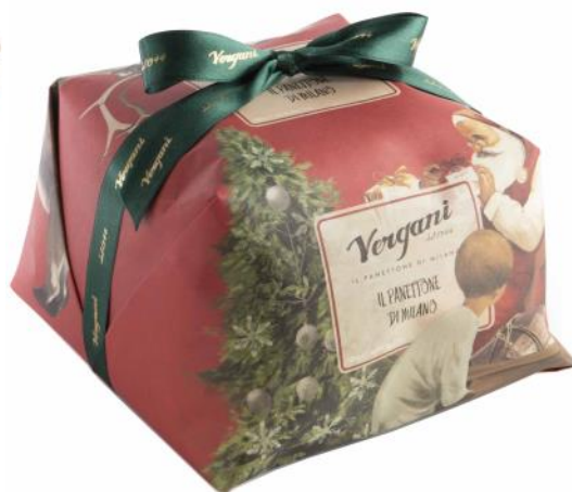
Santa - Traditional Milanese Panettone with raisins, candied orange and lemon peel 1kg x 6 VER4371