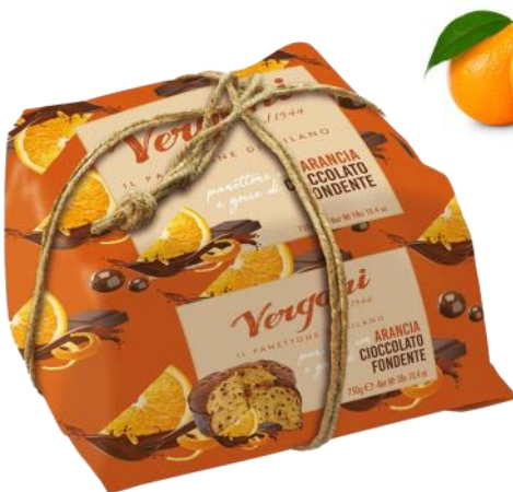
Chocolate & Orange Panettone with chocolate drops, and candied orange peel 750g x 8 VER9178