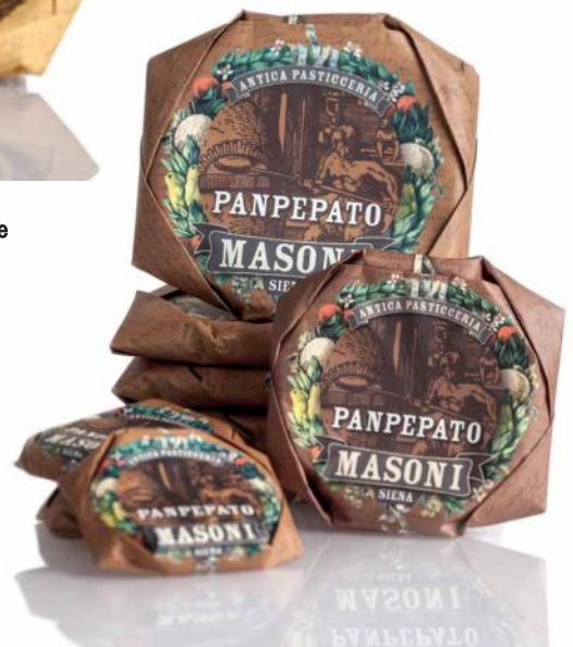
Panpepato with spices by Masoni 250g x 12 MAS108