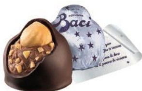
Baci Bulk 3kg x 1 CODE 12439386