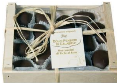
Figs in Rum covered in Dark Chocolate Box Figs soaked in rum covered in dark chocolate 200g x 12 CODE RAO200B7