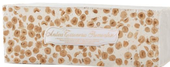
Soft Nougat/Torrone in block by Antica Torroneria Hazelnut 2.5kg x 1 CODE ATP IGP Piemonte Hazelnuts Almond 2.5kg x 1 CODE ATP