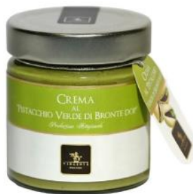
Sicilian 65% Pistachio Cream made of DOP Bronte Pistachio by Vincente 180g x 6 CODE VIN01