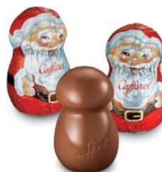
Santa Claus Bulk milk chocolate with gianduia creamy filling 1kg x 1 CODE CAF37512