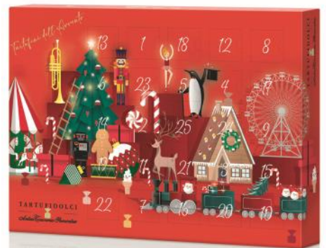
Red Advent Calendar with assorted truffles 175g x 4 CODE ATP4784