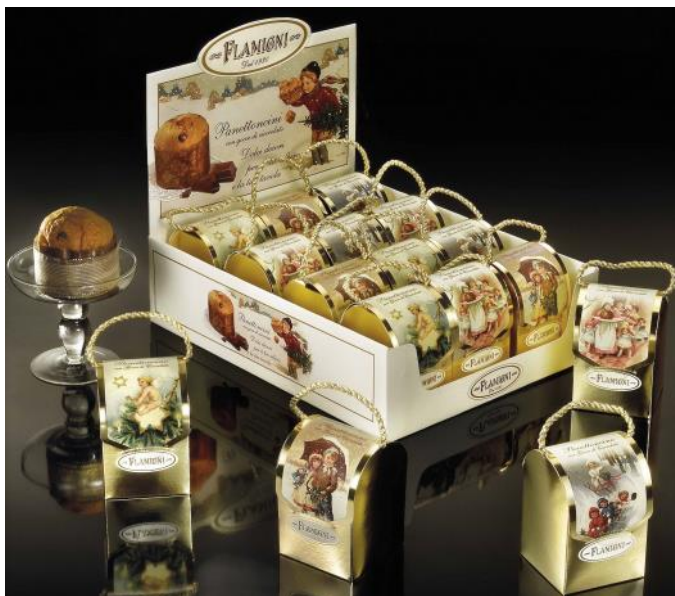
80g Chocolate Panettone in display with chocolate drops 80g x 36 FLA3601