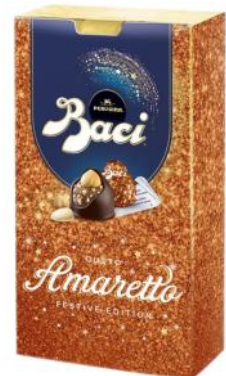
Amaretto Baci Bijou box 150g x 10 boxes CODE 12551983