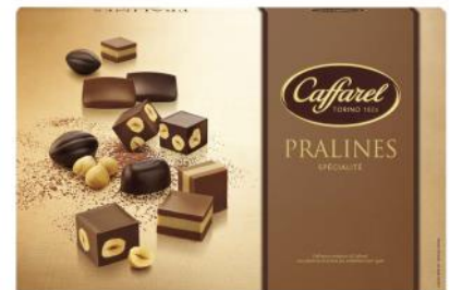
Assorted Pralines Gift Box Cream filled pralines, cremini & gianduiotti 220g x 8 CODE CAF72953