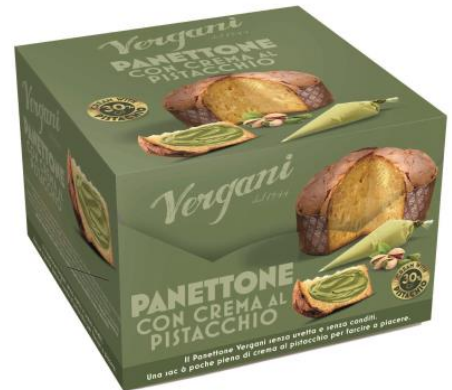
Pistachio Panettone Gift Box cake with 30% pistachio cream sac a poche no raisins or candied fruit 850g x 6 VER9185