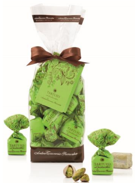
Pistachio Truffle Bag truffles with white chocolate 200g x 12 CODE ATP1394