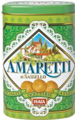
Traditional Amaretti in green tin almond flavour 200g x 6 CODE ISA0729