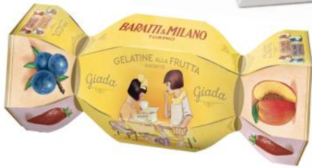
Gelatine Assortment Fruit jellies Size: 30cm x 15cm 200g x 6 CODE BM5863