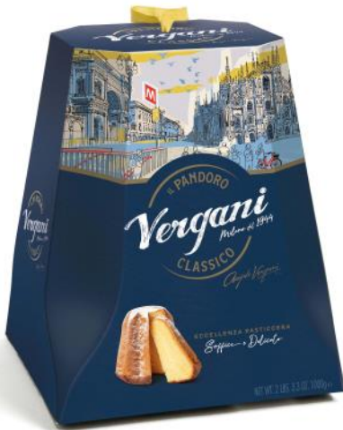
Traditional Pandoro Box light plain cake, no raisins or candid fruit peel, dusted with icing sugar 750g x 6 VER8263