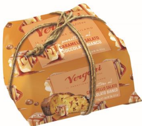
Salted Caramel Panettone with pieces of soft caramel and white chocolate 750g x 8 VER3404