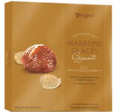
Marrons Glacés Gold box whole very large (25g) chestnuts by Vergani 230g x 8 CODE VCH49020