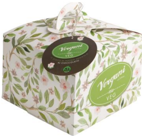
Chocolate Vegan Christmas Cake with chocolate drops 750g x 6 VER0328