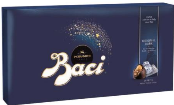
Baci 18 pcs gift box 225g x 6 CODE 12439543 Baci 28 pcs gift box 350g x 6 CODE 12439754