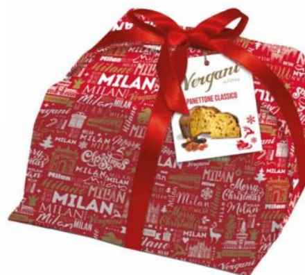
Traditional Milanese Panettone with raisins, candied orange and lemon peel 1kg x 6 VER8812 500g x 10 VER8799