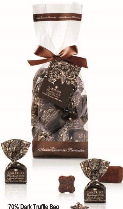
70% Dark Truffle Bag 200g x 12 CODE ATP4722