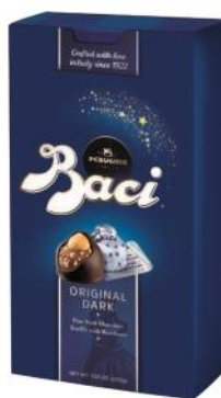
Baci Bijou box 14 pcs 175g x 10 boxes CODE 12439537