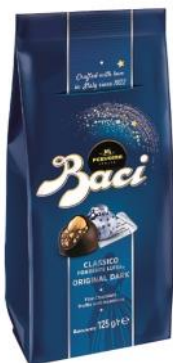
Baci Bag 10 pieces 125g x 12 Bag CODE 12440824