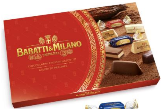
Red Box Assorted Chocolates 230g x 8 CODE BM4442