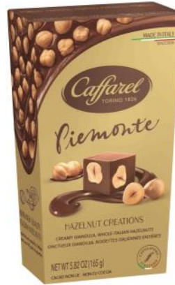
Piemonte Box Milk chocolate cubes with whole hazelnuts 165g x 8 CODE CAF80352