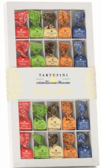
Truffle Rainbow Box milk chocolate, pistachio, gianduia, salted caramel (25 pcs) 175g x 6 CODE ATP5279