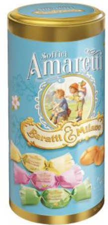
Amaretti in cylinder tin Baratti & Milano 145g x 6 CODE BM4604