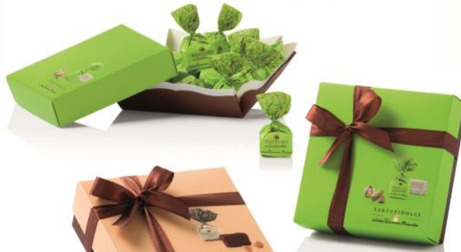
Truffle in gift box Beige - Dark chocolate & hazelnuts 125g x 6 CODE ATP3732 Green - White chocolate & pistachio 125g x 6 CODE ATP3701