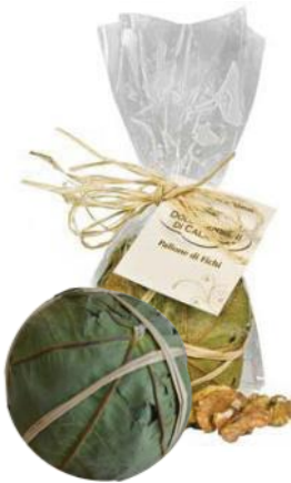
Figs Ball Baked Calabrian figs wrapped in leaves a complement for cheeses 200g x 12 CODE RAO200P1