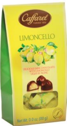
Limoncello ballotin Dark chocolate with liqueur filling 120g x 12 CODE CAF79977