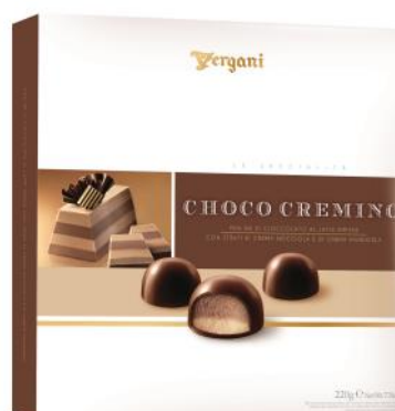
Choco Cremino Milk chocolate pralines filled with hazelnut & almond cream. 220g x 8 CODE VCH57081