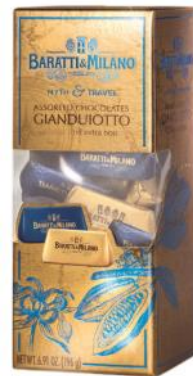
Gold Window Box Milk & Dark Gianduiotti 196g x 10 CODE BM4342