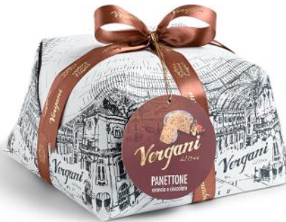
Chocolate Panettone with chocolate drops, sprinkled with chocolate drops 500g x 10 VER2537