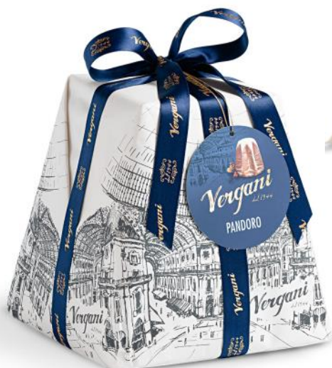
Pandoro light cake without candied fruit or raisins, dusted with icing sugar 750g x 6 VER0724