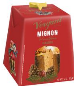
100g Traditional Panettone with raisins, candied orange and lemon peel 100g x 12 VER8454