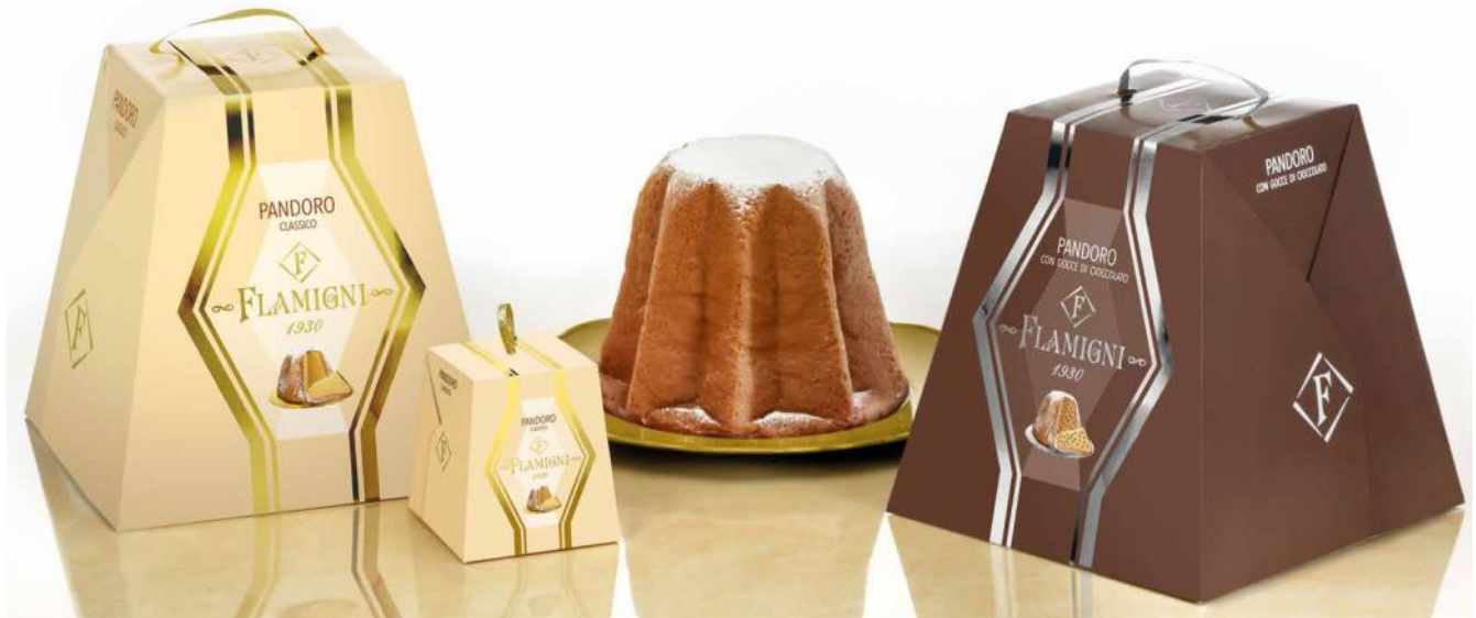
Oro - Pandoro Box Traditional 1kg x 6 CODE FLA3307 Chocolate drops 1kg x 6 CODE FLA3308