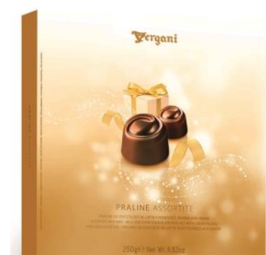
Roxy Milk & dark chocolate pralines filled with cream. 250g x 8 CODE VCH61273