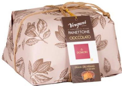
Domori Chocolate Panettone Grand Cru Vidama with 60% cocoa dark chocolate drops 750g x 8 VER8096