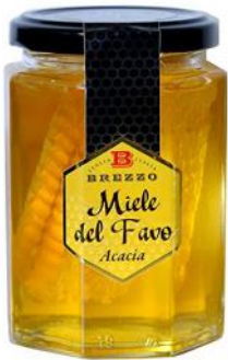
Acacia Honeycomb by Brezzo 250g x 6 CODE BREFA03