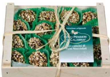
Figs in Chocolate & Hazelnuts Box Figs covered in dark chocolate and crushed hazelnuts 200g x 12 CODE RAO200B11