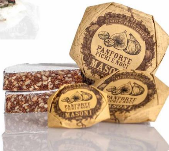
Figs & Walnuts Panforte by Masoni 350g x 12 MAS843 100g x 12 MAS845