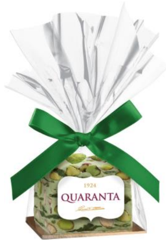
Pistachio Soft Nougat Cube 130g x 6 pcs CODE QUA404015