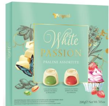
White Passion white chocolate pralines filled with pistachio and strawberry cream. 200g x 8 CODE VCH61170