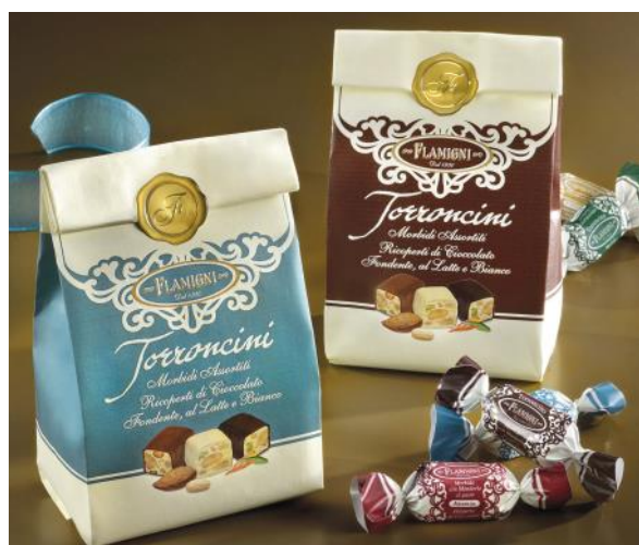
Flamigni Nougat in bags Covered in chocolate assorted soft nougat in 5 flavours: orange, lemon, vanilla, milk chocolate and dark chocolate 180g x 12 CODE FLA178