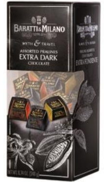
Black Window Box Assorted Dark Chocolates 248g x 10 CODE BM4472