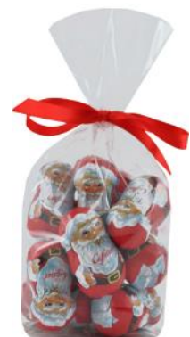
Santa Claus Bag milk chocolate with gianduia creamy filling 140g x 7 CODE CAF37512B