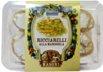
Masoni - Ricciarelli in clear tray IGP Siena 240g x 12 MAS201

Almond paste cookies made with freshly crushed almonds, blended with sugar and other ingredients. Due to their soft delicate texture they are among the world's most exquisite pastries.