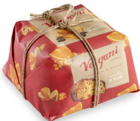
Traditional Milanese Panettone with raisins, candied orange and lemon peel 750g x 8 VER4128