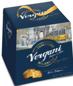
Traditional Panettone with raisins, candied orange and lemon peel 500g x 20 VER0076