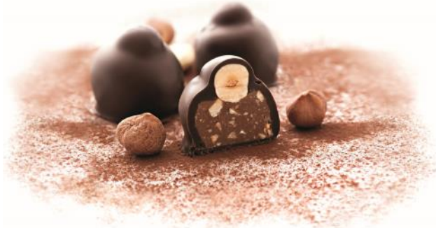
Dark chocolate with a whole hazelnut , filled with milk chocolate and pieces of hazelnut. Each piece wrapped in foil contains a messages of love and friendship.