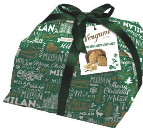
Soave Panettone (no fruit or raisins) almond glazed 900g x 6 VER8942