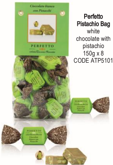
Perfetto Pistachio Bag white chocolate with pistachio 150g x 8 CODE ATP5101