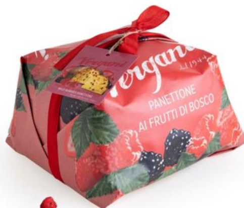
Wildberries Panettone with wild strawberries, raspberries, blackberries and blackcurrant 750g x 8 VER3367