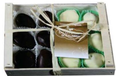
Figs in Dark and White Chocolate Box Figs covered in dark and white chocolate 200g x 12 CODE RAO200B6