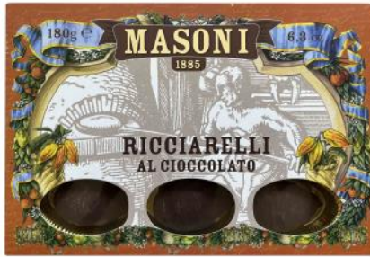
Masoni - Chocolate Ricciarelli 180g x 18 MAS210