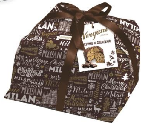
Chocolate Panettone with chocolate drops, sprinkled with chocolate drops 1kg x 6 VER8867

Cocoa comes from an area in Ivory Coast, where the exchange of pollen with wild plants of orange, mango, wild coffee and cardamom near the cultivated cocoa plantation gives a particular fragrance to the dark chocolate Grand Cru Vidama.