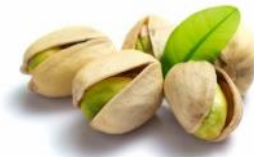
Pistachio Panettone filled with pistachio cream, covered in dark chocolate and sprinkled with crushed pistachio nuts 750g x 6 VER2926