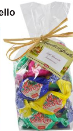
Traditional Amaretti almond flavour 215g x 10 CODE ISA04