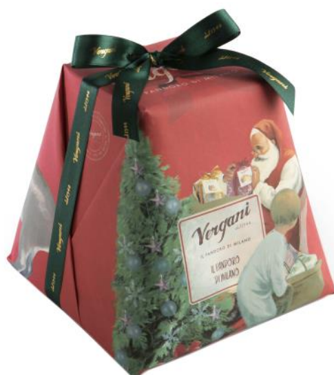
Santa - Traditional Pandoro light plain cake, no raisins or candied fruit peel, dusted with icing sugar 1kg x 6 VER4685