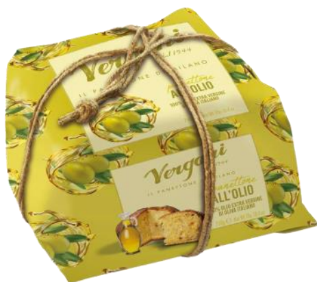
Extra Virgin Olive Oil Panettone with raisins, candied orange and lemon peel 750g x 8 VER9246