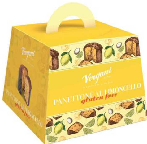
Gluten free Limoncello Panettone with raisins and candied orange peel 600g x 6 VER9222