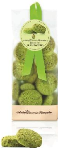
Pistachio Biscuits biscuits with pistachio 200g x 8 ATP4791