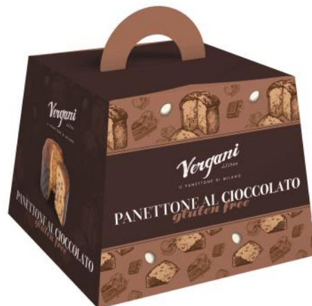
Gluten free Chocolate Panettone with chocolate drops 600g x 6 VER9215