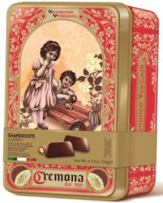
Chocolates Red Tin Gianduia hazelnut milk chocolates Size: 17.5cm x 10.5cm x 5cm 120g x 12 CODE VCH64078