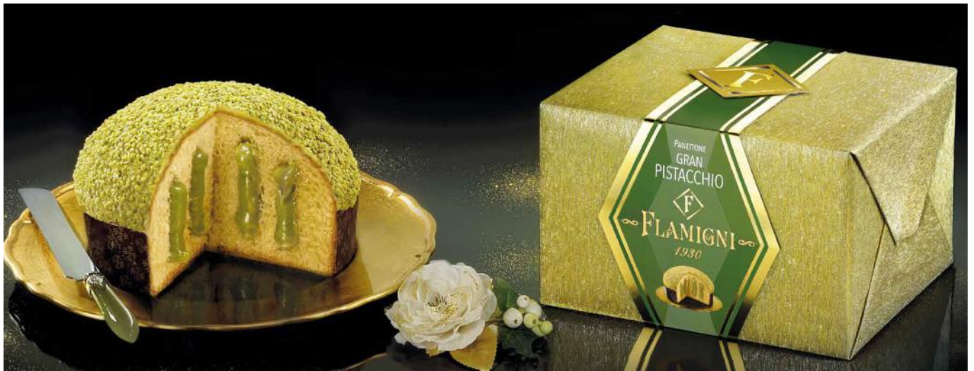
Gran Pistachio Panettone with Pistachio cream coated with white chocolate & pistachio grains 950g x 9 FLA3682