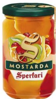
Mostarda di Cremona candied mixed fruit chutney 380g x 6 CODE SPE688