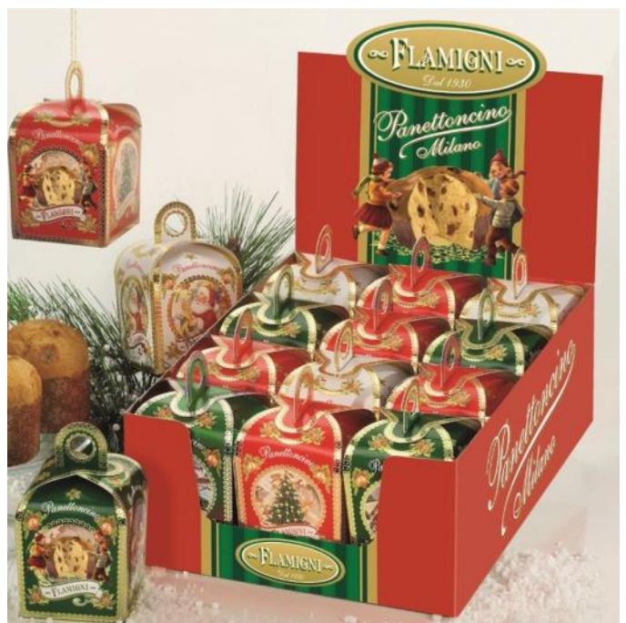
80g Traditional Panettone in display with raisins, candied orange and lemon peel 80g x 36 FLA3900