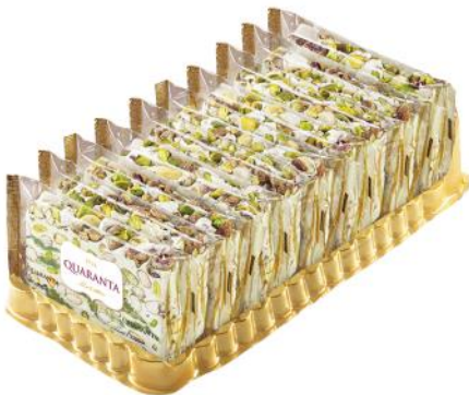
Square Pistachio Cream Nougat Cake 1.8kg - 12 individually wrapped slices each slice 150g CODE QUA404054