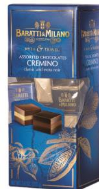
Blue Window Box Milk & Dark Cremino 210g x 10 CODE BM4478