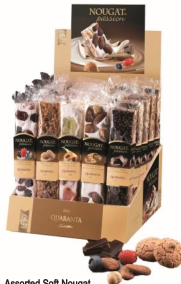
Assorted Soft Nougat Chocolate, Fruit & Nut 100g x 25 pcs CODE QUA403980