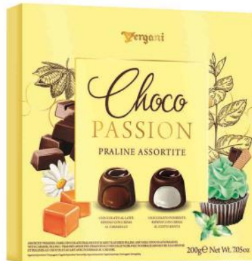
Choco Passion Milk chocolate pralines with caramel filling & dark chocolate pralines with mint filling. 200g x 8 CODE VCH61174