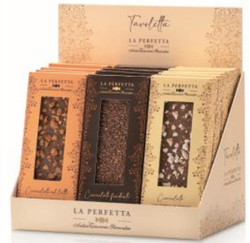
Chocolate Bars Display milk chocolate with caramelised hazelnuts, 70% dark chocolate with cacao nibs, milk chocolate with nougat pieces (85g x 18pcs) x 1 CODE ATP5294