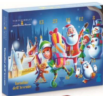
Blue Advent Calendar with assorted truffles 175g x 4 CODE ATP4968