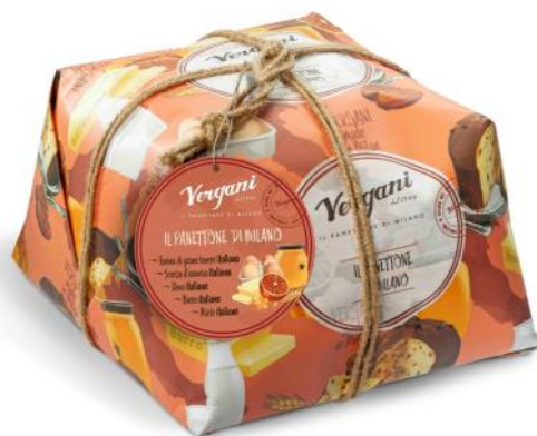
Premium Quality Traditional Milanese Panettone with raisins, candied orange and lemon peel Main ingredients are 100% Italian 1kg x 6 VER3664