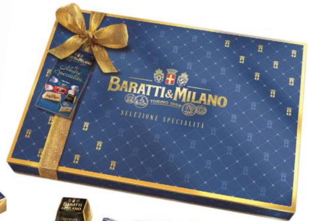
Blue & White Gift Box Assorted Chocolates: cremino, gianduiotto, 70% extra dark chocolate, dark & milk nocciolotto 300g x 6 (3+3) CODE BM4408