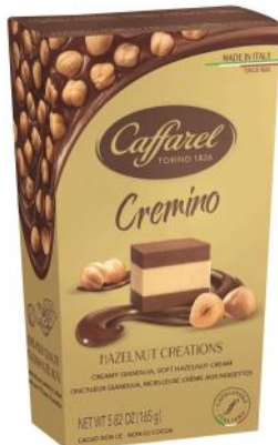
Cremino Box Milk gianduia chocolate with soft hazelnut cream 165g x 8 CODE CAF80353